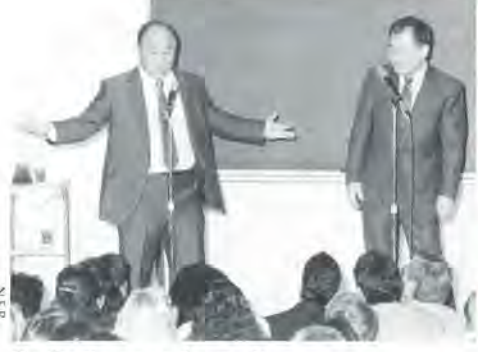
Father's speech, p. 4