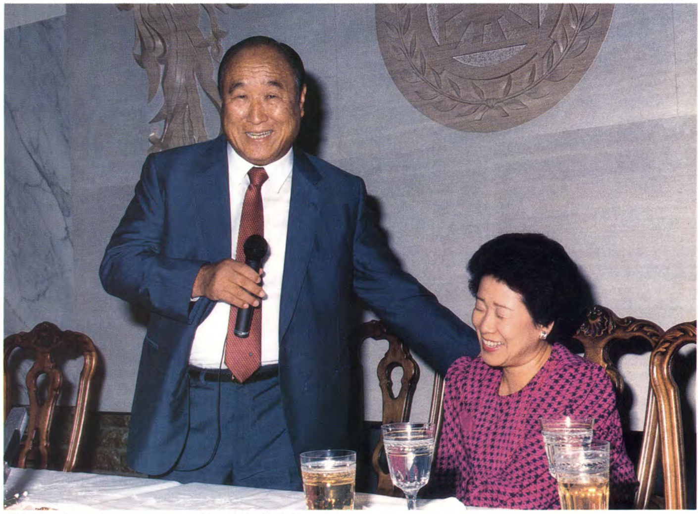
"If I do not have a true woman, the world would be bleak for me."

What is the original value that God wanted to give every human being? God created man to become mature, to become a