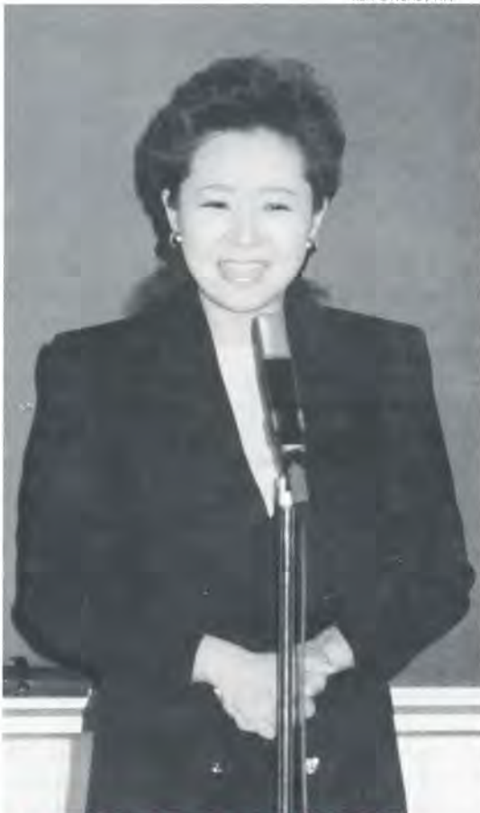
"My blessing is to return love to my subject."

leaves must be my expression of joy and love and beauty to them."