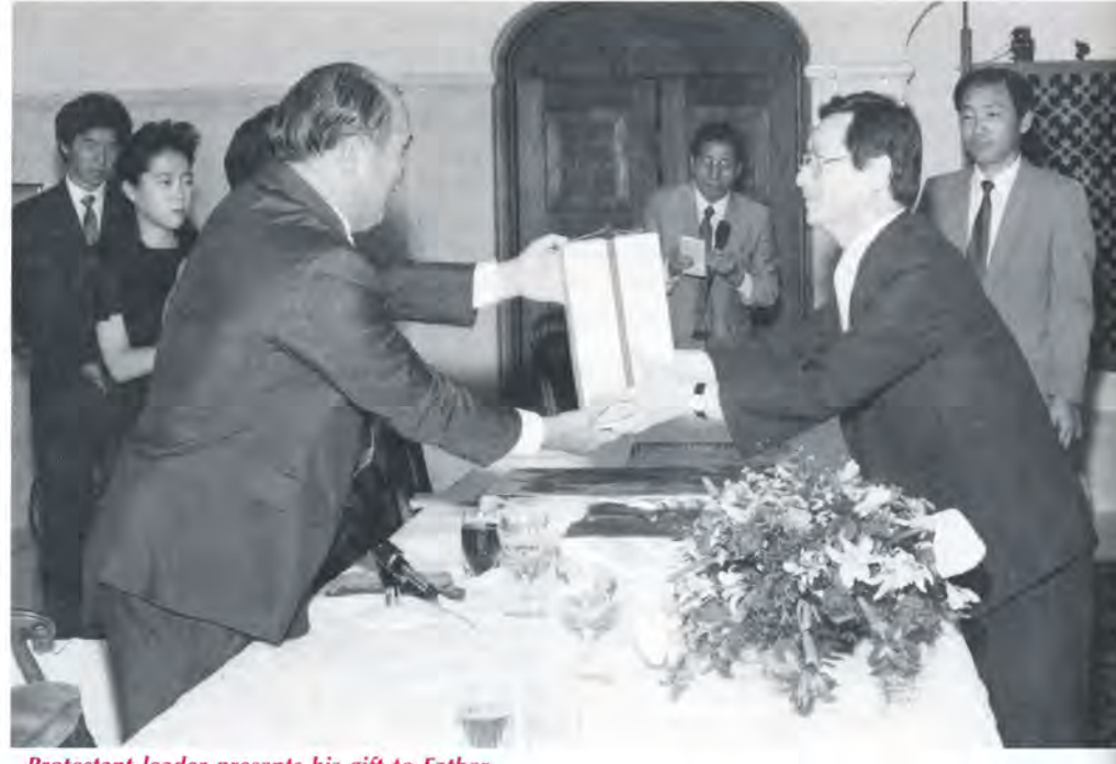
Protestant leader presents his gift to Father.

All these gifts were symbols of the dedication of their minds and hearts to