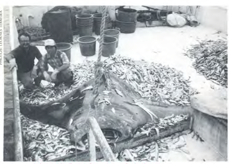
A large "devil ray" that got caught in the net.

that after eating meat they feel like they have eaten a brick. It makes people look ugly after a long time, too. Seafood is a very natural food that isn't processed a lot; it only gets packed and frozen. Today there is a product called Surimi made from pollock in Alaska. It has different flavors, and can taste just like any kind of seafood or any kind of meat you find on land.