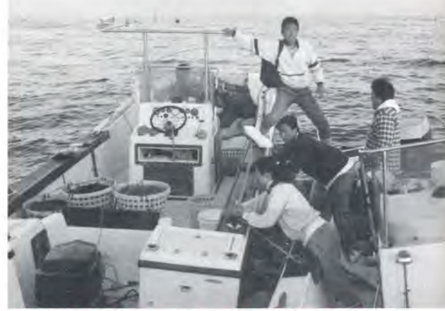
Transferring various materials from one boat to the other, Ipswitch Bay.

and internal success. For now, our successes can be seen in our determination to fulfill the providential vision Father has for us and to resolve the difficulties and differences that are evident amongst us: the old and the new, the second generation and those who are endeavoring to pass from the old