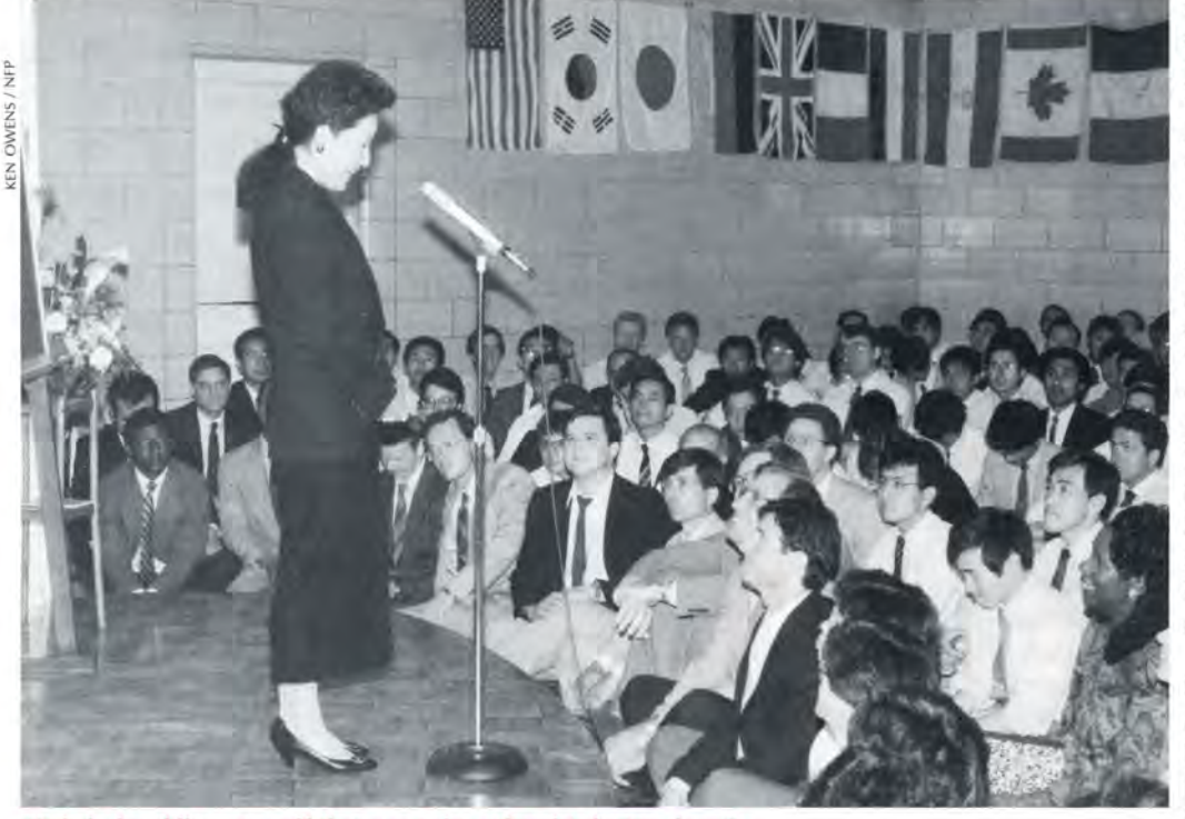
"It is in humbling yourself that you gain and maintain true love."

So when Parents ask you to do your mission, to unite with your leaders, to unite with True Parents, with husband and wife, that is what you must do. We as Unification Church members, and as men and women, must always know our position. For the sake of love, you must meet at the center. Meeting at the cen-