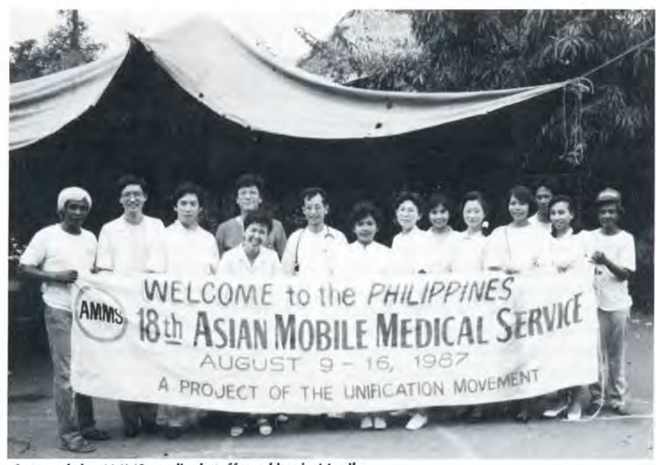
Some of the AMMS medical staff working in Manila.

This is the fourth time that AMMS has sponsored a medical service project in the Philippines, and when I went there this time, I saw that many Philippine people were still in desperate need of medical services. The situation of the poor seemed to be little changed from what I saw two years ago. Since the February 1986 revolution, the economic condition has not improved very much, in spite of a