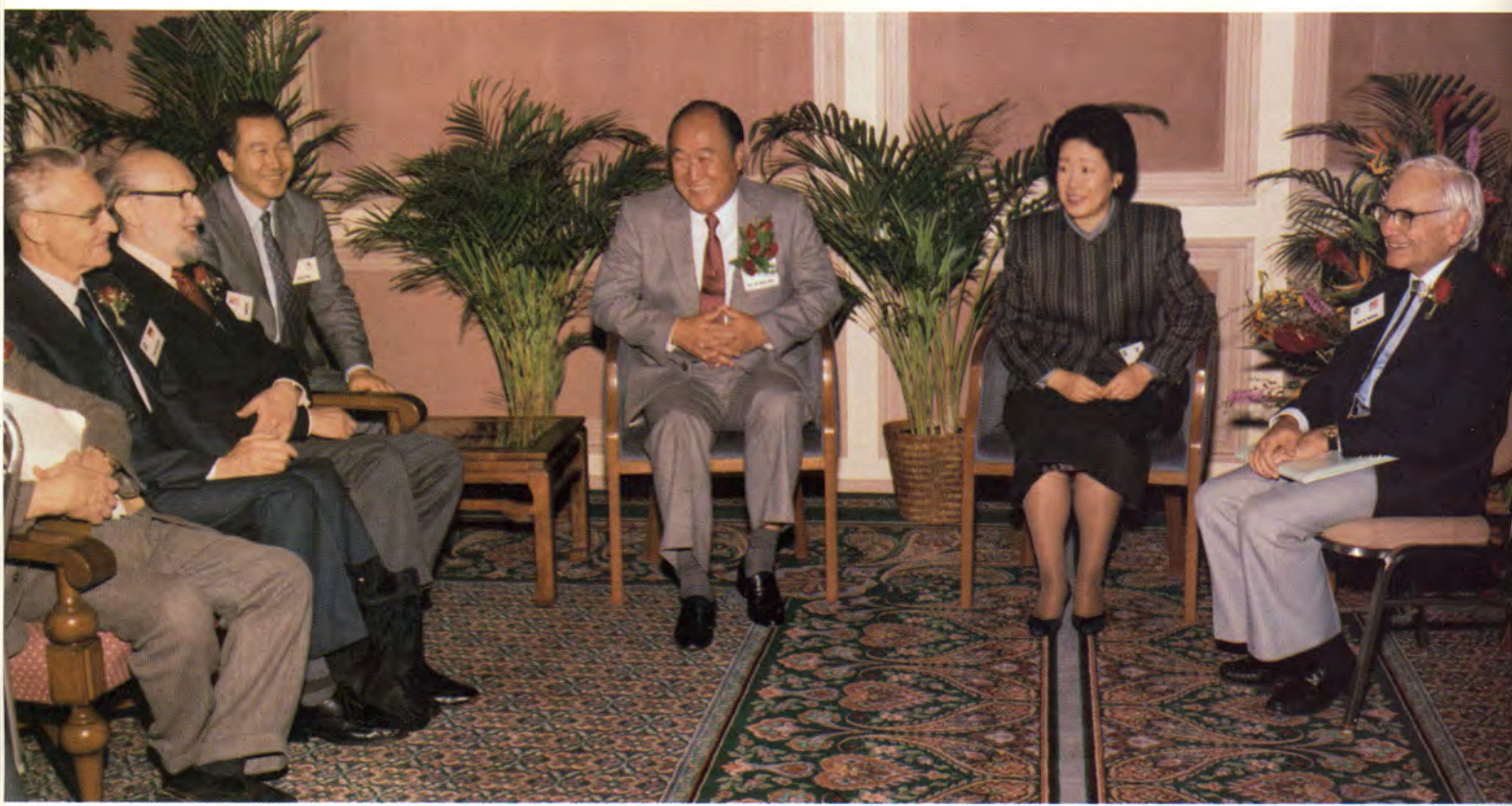
"Father really loves the scholars a lot. In fact, True Parents as well as the participants feel that ICUS is like a large family."

will also connect in heart with Father's vision for ICUS.