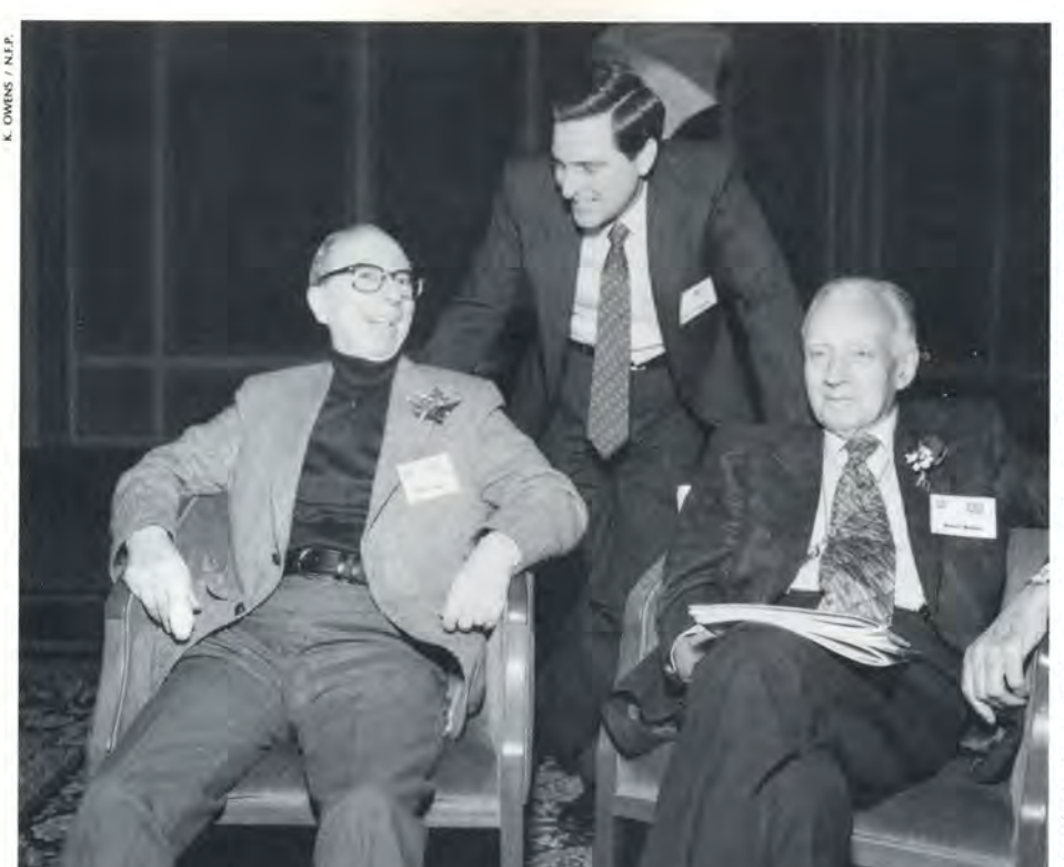
"How often do students in universities have this kind of experience with renowned professors from all the world?"

scheduled things two or three years in advance. Also those who did agree to write papers could not always produce the best quality in the short time provided.