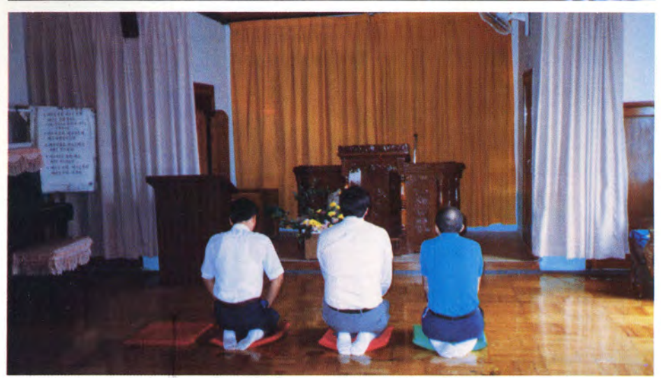
Top: In the museum one can see photographs of the cardboard hut and the foundation rock Father used to build it. Middle: The lamp and table used by Father to write the Principle. Bottom: A prayer in the chapel built on the spot where the cardboard hut stood.

felt closer to True Father than ever before. I now felt I knew him as a young man, and I could put his life into perspective with my own.