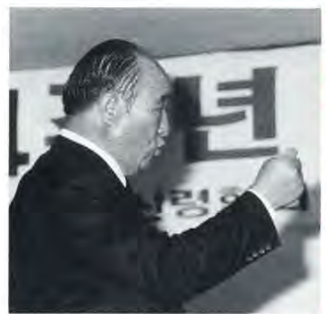
God's Day morning speech, p. 4