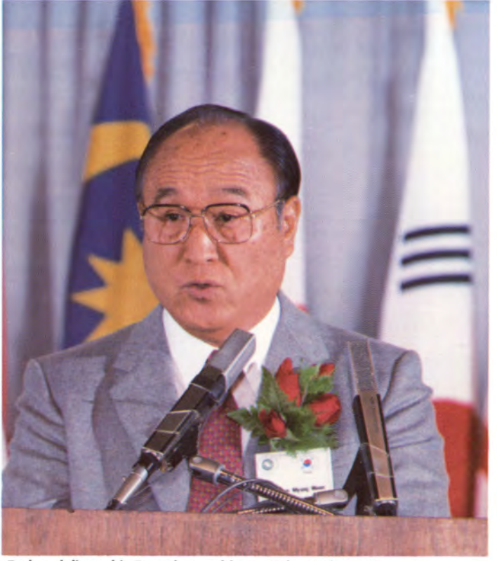
Father delivers his Founder's Address at the 16th ICUS.

I know that "absolute values" is not a popular theme among scholars today. But I hope, first of all, that scholars do not make the mistake of confusing absolute values and absolutism. I have emphasized several times at ICUS that absolute values are based on God's love. God's love is not sectarian. God's love reaches deep into human hearts and becomes the source of true love gushing out into the everyday lives of human beings. Therefore, God's love is