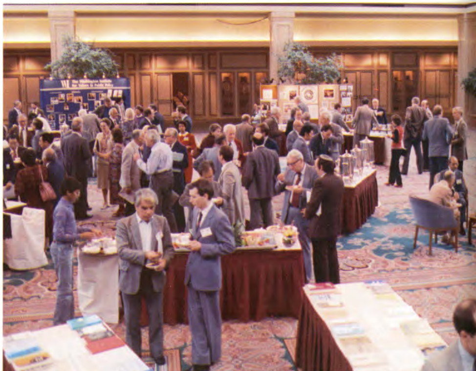
The scholars mingle among themselves during a coffee break.