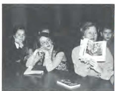
Journalists visit the USSR, p. 17