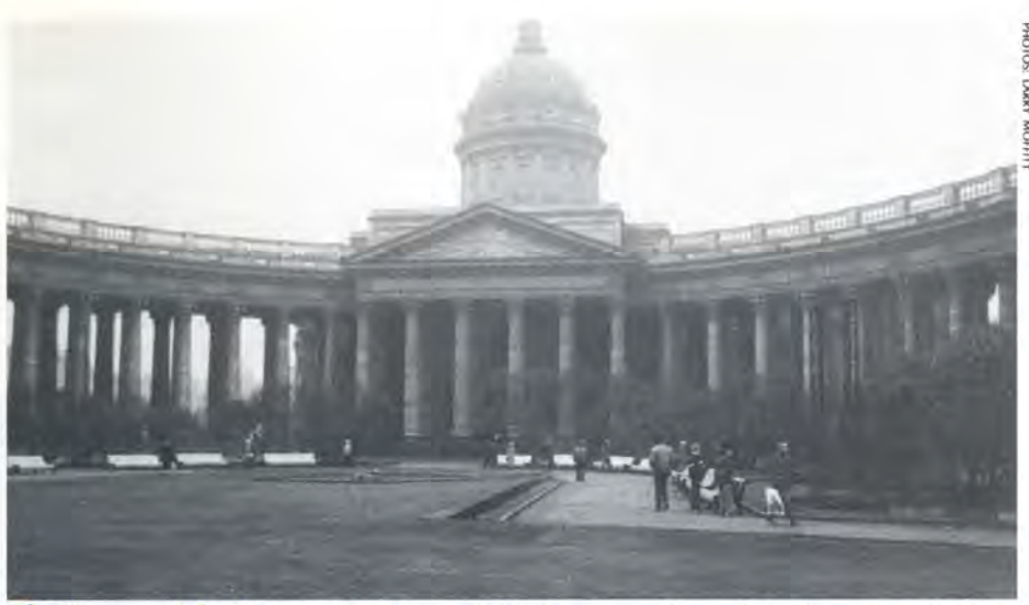
The Museum of the History of Religion and Atheism. It was formerly Leningrad's Cathedral of the Virgin of Kazan.

Victoria: Is the black market pretty active?