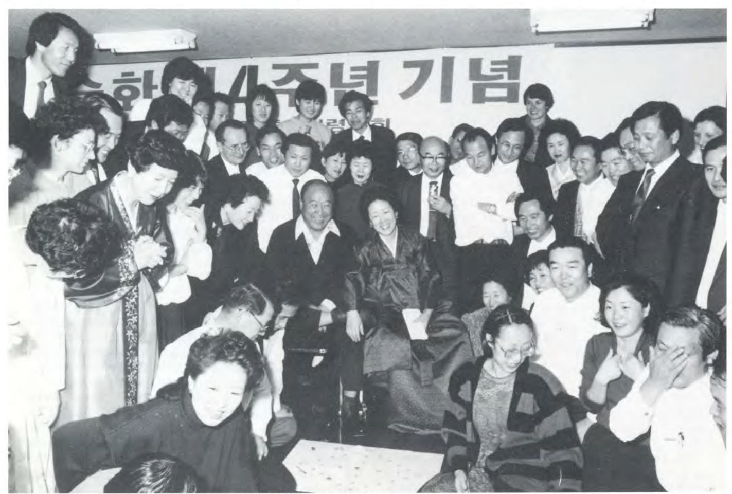
A spirited yute game with the True Family on January 2, the Day of Victory of Love.

I went through suffering, and I have established a foundation. It is easy for you now to fly on that foundation. Are you women going to freely offer your husbands for this purpose? Are you husbands going to offer your wives? One or the other of you must devote yourself to the cause