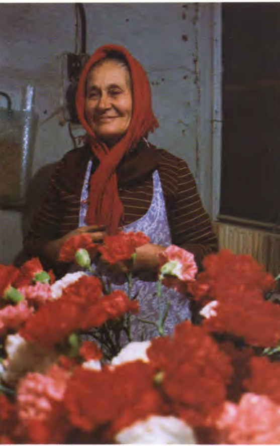
Woman at a flower stall in Samarkand.

held inside. It was so alive! The room was filled wall-to-wall with people who had arrived up to two hours before the service—young people and old. The whole two-hour service was heartfelt testimonies, repentance, and prayer. They had a choir that was just vibrant. It was the only place in the Soviet Union where I actually felt God's spirit. And it was strong!