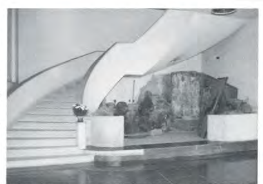
Left: The newly-restored stairway in the main lobby of the national headquarters building. Right: Main entrance to the national headquarters building in Sao Paulo, Brazil, a former scientific laboratory now undergoing complete restoration.

Love for True Parents and the Principle and the immediate practice of every new providential direction initiated by Father are the heart behind the growth of the Brazilian church.