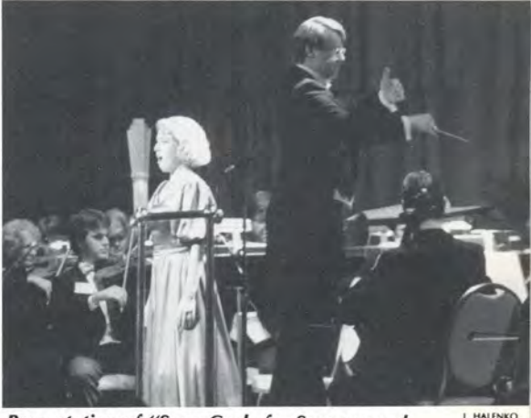
Presentation of "Song Cycle for Soprano and Orchestra" at the Farewell Banquet.

as more and more scientists find themselves pushed to the limit of science, they will find that the key to transcending this limit is to regard that, behind all material and life phenomena, there is a purposeful motive working in accordance with God's purpose of creation.