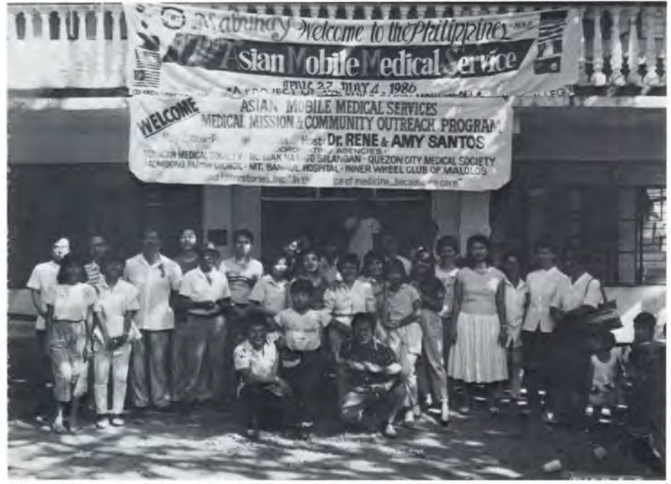
The medical team is given a warm welcome in Paombong, Bulacan.

Our journey to Baguio was quite an experience. We left Manila in the afternoon and finally arrived on a one-lane mountainous road in Baguio at 10 pm. Drivers in the Philippines honk their horns constantly, signal-