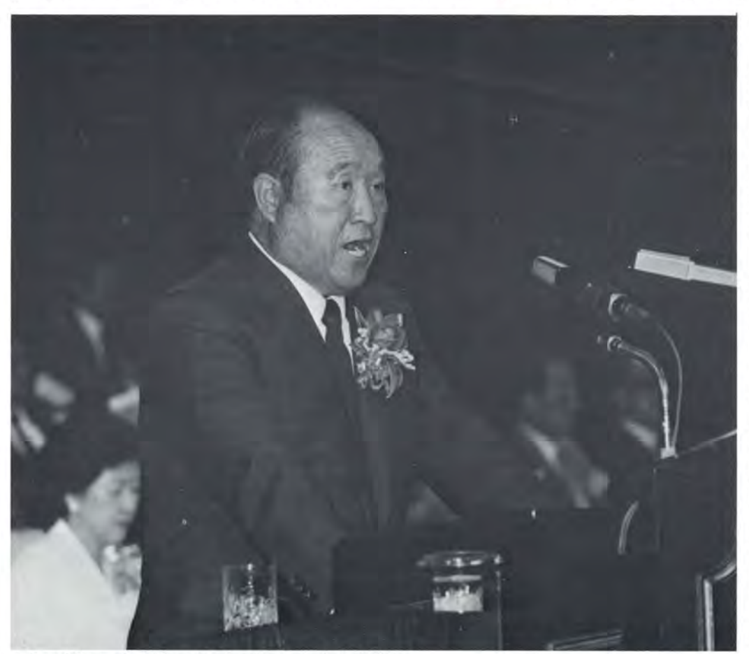
Father delivers the Citizens' Federation Founder's Address.

The answer is no. Rather, communism itself was branded by science as a 19th-century superstition. Science in the 20th century is serving as a witness to God by overthrow-