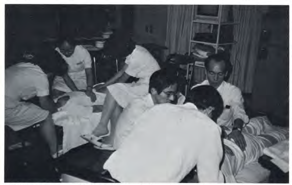
The doctors and nurses at Isshin practice newly-learned reiki techniques on each other.

I visited another woman who was recovering from a cancer operation during which her right lung had been removed. She was still in great pain. Her breathing was restricted, and her voice was very weak. After the first reiki treatment she began to improve, and by the fourth treatment the pain had gone, and her breathing and voice were much stronger. She had been going every day to the hospital's morning service but was now able to sing the holy songs with everyone else. She was so impressed and grateful that she occasionally followed me around the hospital, introducing me to the other patients. Her response to me was totally different from the way