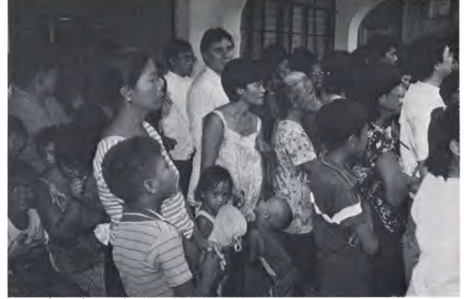
In Paombong, the crowd waits patiently for the clinic to open.

In one week our team traveled to three different towns, setting up our temporary clinic in each one. Everywhere we went, there were so many people waiting to see us we couldn't take any breaks. The people who assisted us, whether they were Unification Church members or not, supported us continuously. One day I treated patients for 12 hours straight, and the Filipino woman who worked with me stayed with me every moment. She wouldn't eat anything un-