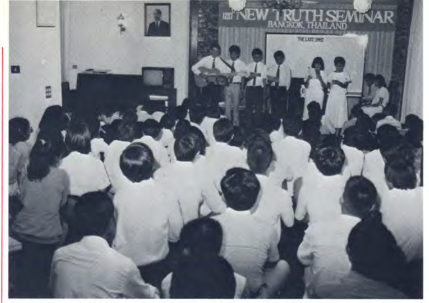
Our New Truth Seminars attract many guests every Saturday.

The other countries in our region—Malaysia, Singapore, Indonesia, and Burma—have had varying degrees of success. The Thai church has been the most financially successful so far, so we help support the other countries. Whenever they send their members to