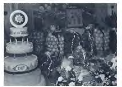
Day of All Things, p. 18