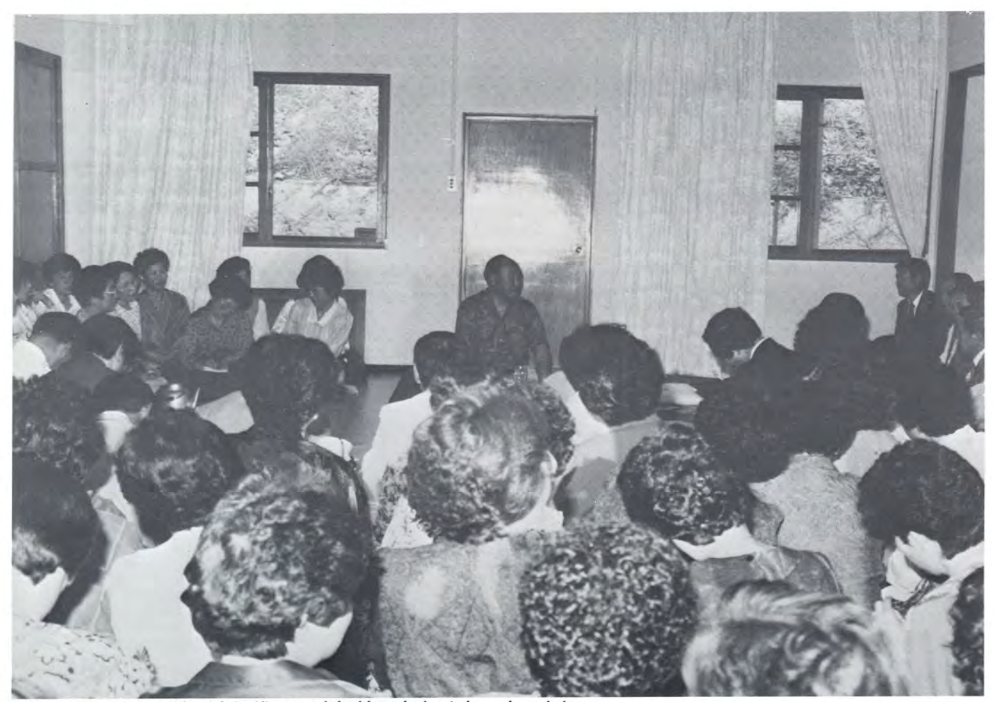
Father explains the providential significance of the blessed wives' pioneering mission.

Father asked the wives to alert their communities to the threat from North Korea and to prepare to receive members from around the world who may be coming to assist with the newly established Citizens' Federation for the Unification of the Fatherland. On a practical level, many of the blessed wives will sell McCol, a barley drink produced by II Hwa that is very popular in Korea, to help raise funds for the Federation.