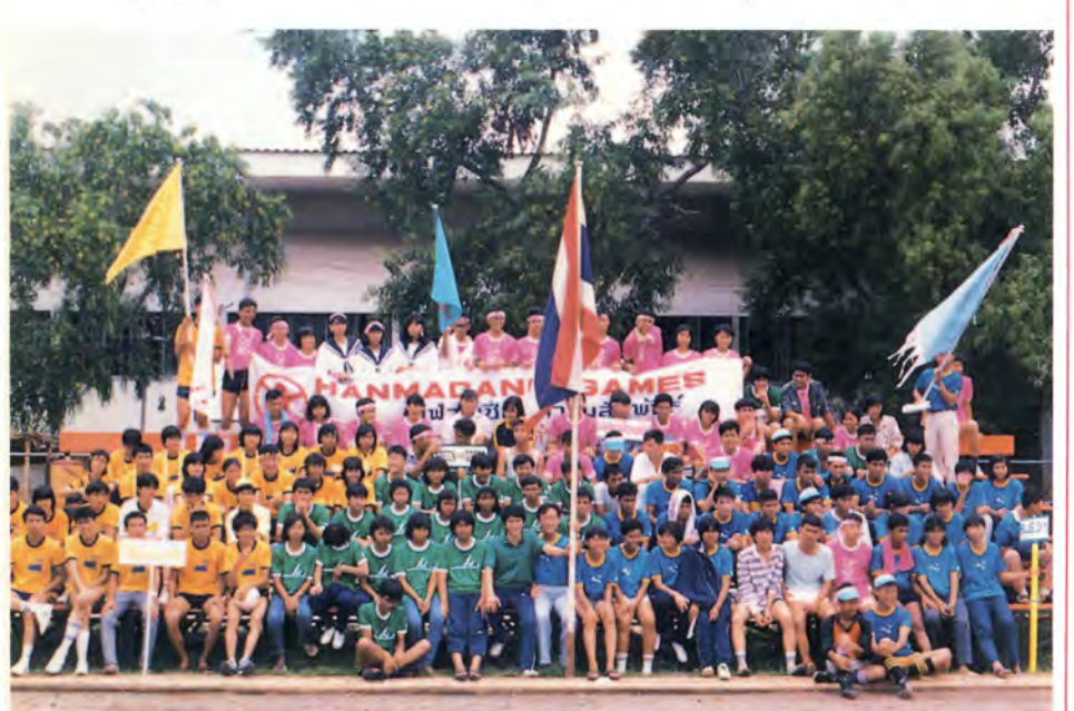
A Thailand version of the Han Ma Dang Games.

BECAUSE OF IRFF'S WORK IN THAILAND, MANY PEOPLE IN THE HIGHEST LEVELS OF GOVERNMENT KNOW AND RESPECT OUR MOVEMENT.