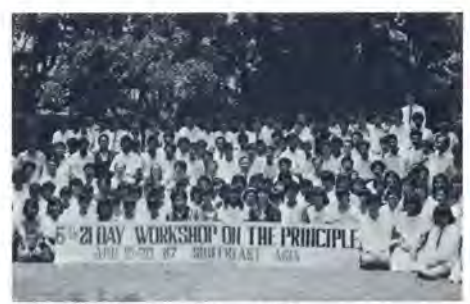
The land of smiles, p. 25

FRONT COVER: While Mother looks on, Father signs a program at the Summit Council for World Peace.