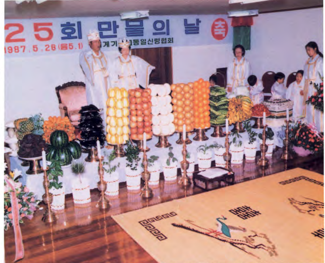
True Parents celebrate the Day of All Things at Han Nam Dong with some of their children.

Once I was pioneering in the northern part of Korea, where I had 50 home members to take care of. These generous members would offer me donations of food from their harvests