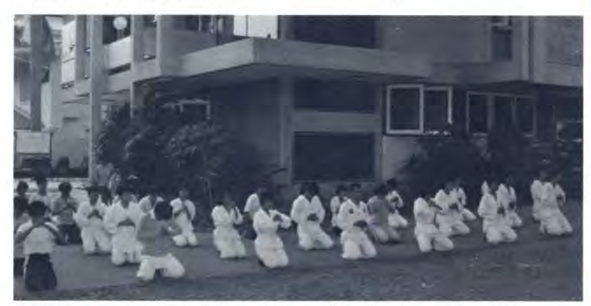
An early morning tae kwon do lesson in front of the Bangkok headquarters.

Before breakfast, the members study Korean or tae kwon do (Korean karate) and then clean the center. The atmosphere we maintain in the center is vital, so cleaning is very important. All day long the members are singing, which creates a high spiritual atmosphere by the time the guests come in the evening. Some members have testified that they joined in part because of the singing. Thais love the happy enthusiasm of our members.