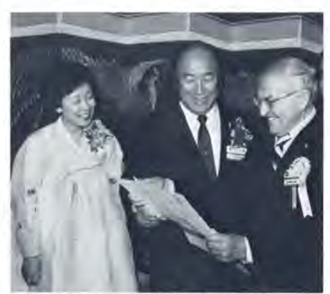
Gathering of world leaders, p. 9