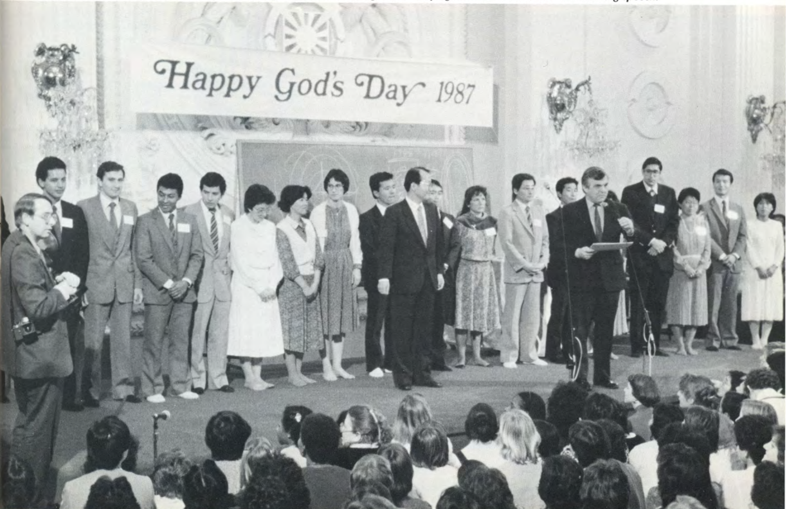
Below: CAUSA-USA volunteers who had the highest results in the signature campaign receive awards after the morning speech.