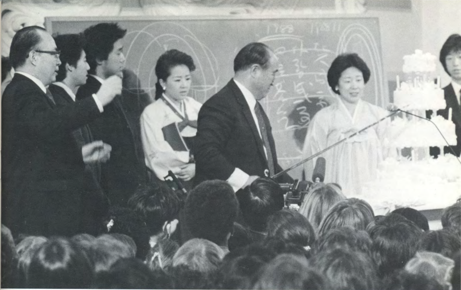
Above: Father cuts the celebration cake as the True Family watches.