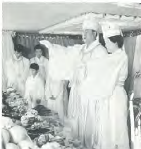
God's Day 1987, p. 4