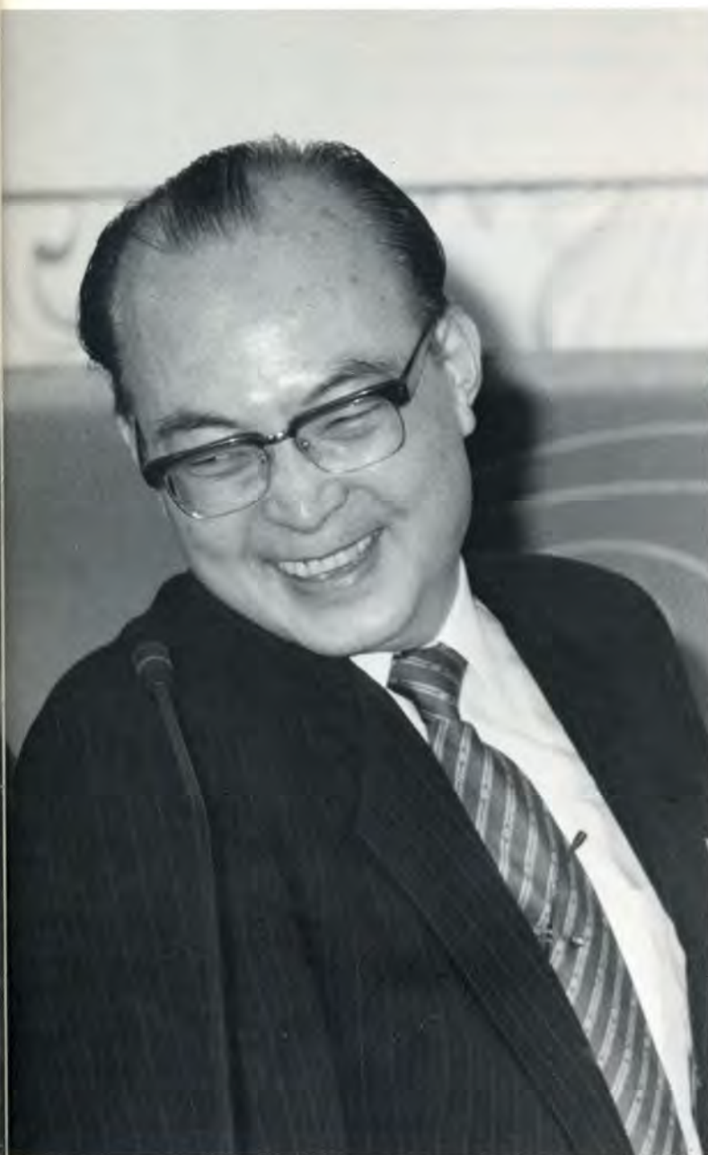
K. OWENS / N.F.P.

Then where can we find that fatherland? The world could be said to be our fatherland, but more specifically, the fatherland of our Unification faith is Korea.