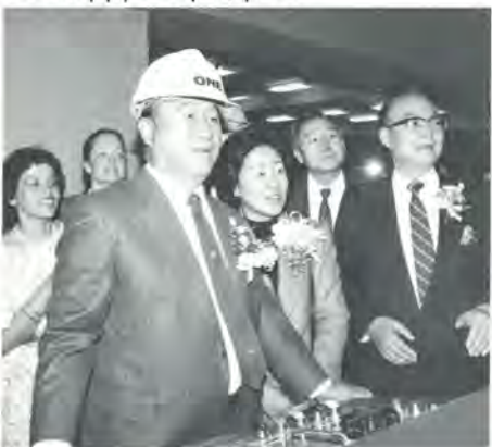
Roll the presses, p. 36