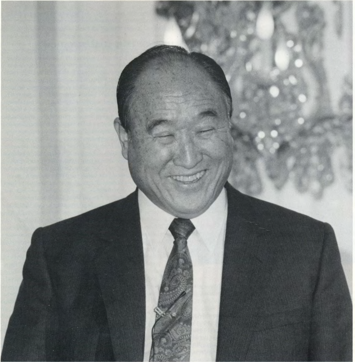
K. OWENS / N.E.P.

As soon as we bring people true love, they will receive it eagerly— like a thirsty man reaching for water.