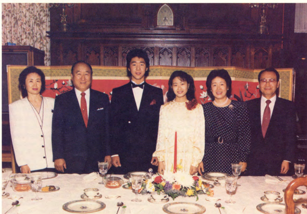
Right: The new couple with their parents.