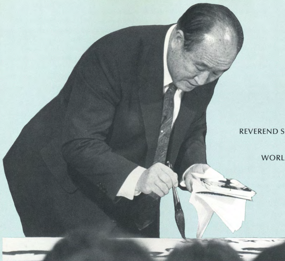
REVEREND SUN MYUNG MOON MIDNIGHT SPEECH JANUARY 1, 1987 WORLD MISSION CENTER