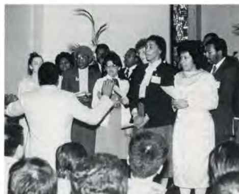
American ministers sing some gospel at the headquarters church in Seoul.