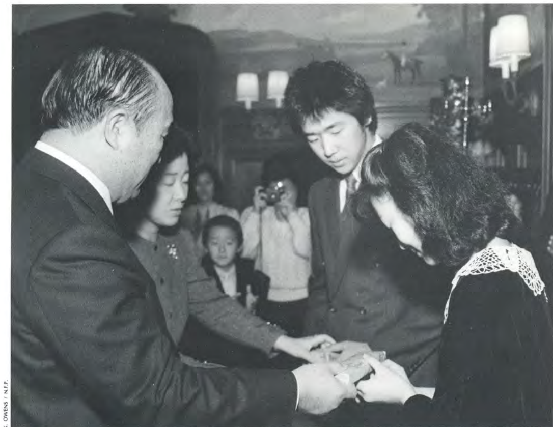
K. OWENS / N.E.P.