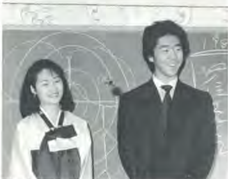
The happy couple, p. 20