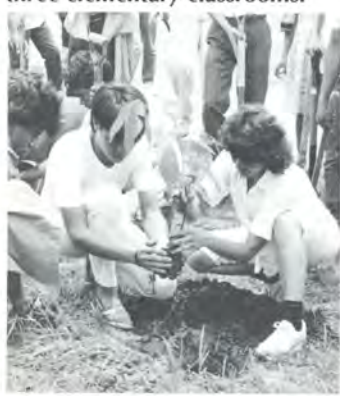
Planting a mahogany seedling.