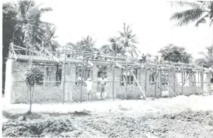
School construction in progress in Iloilo. This building will house three elementary classrooms.

At each site the work was grueling. The environment was so hot and smelly that sometimes it was hard just to get up in the morning. The volunteers challenged themselves to give their love continuously through