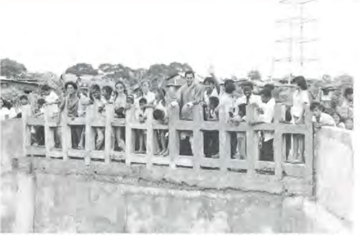
Some of the RYS volunteers and the village children celebrate the completion of the bridge that connects a Christian and a Muslim community.

Love is a wonderful topic, but behind love lie the actions of selfless giving and service. Without concrete actions, love cannot survive. Secular, romantic love is a fleeting emotion. When it dies, so does the young couple's willingness to serve each other. The husband begins to look at his wife as someone who will always prepare his meals on time. The wife may come to regard her husband merely