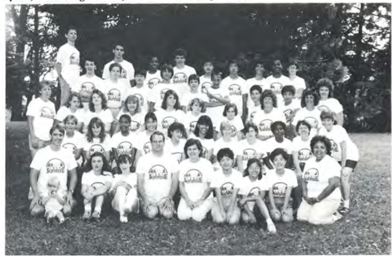
The older campers with their counselors.

BETWEEN JULY 19 AND AUGUST 9, CAMP Sunrise happened—once again! For the last seven years Camp Sunrise has provided an opportunity for blessed children to come together and share, to learn new skills and have fun. This season a record number of campers—over 120—attended.