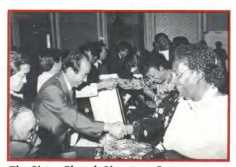
The Sister Church Signature Ceremony.