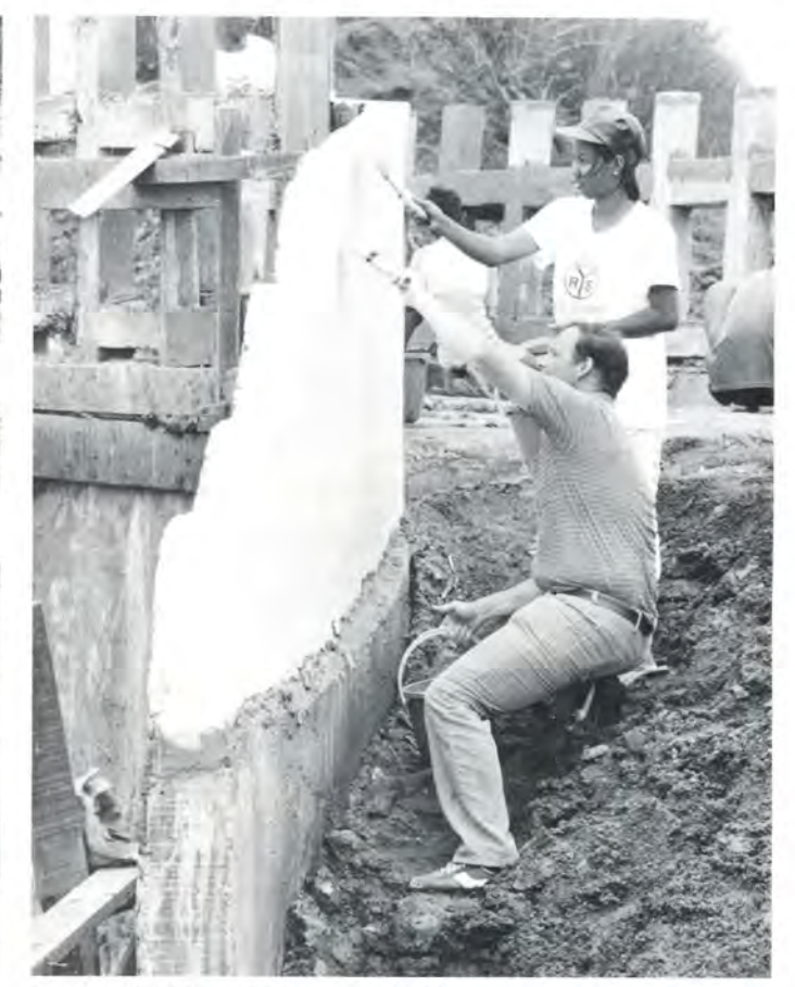
The last finishing touches on the bridge.