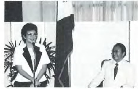
President Aquino speaks to the group.