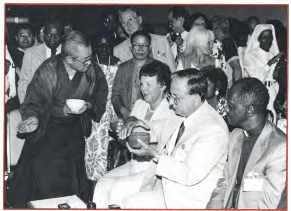
Ministers are graciously served at the tea ceremony in Tokyo, Japan.

ing a cup of tea so delicately and yet so firmly offered. As the recipient of Japanese service you feel almost hopelessly at the mercy of the server you are flattened by their uncanny grace and you can't tell them to stop!