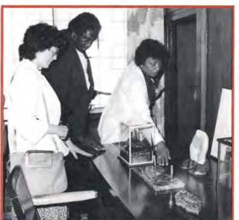
Upstairs at the Old Chung Pa Dong Church.

You could only hear whispers as the ministers brushed their fingers reverently over the sparse furniture and marveled at Father's humble beginnings.