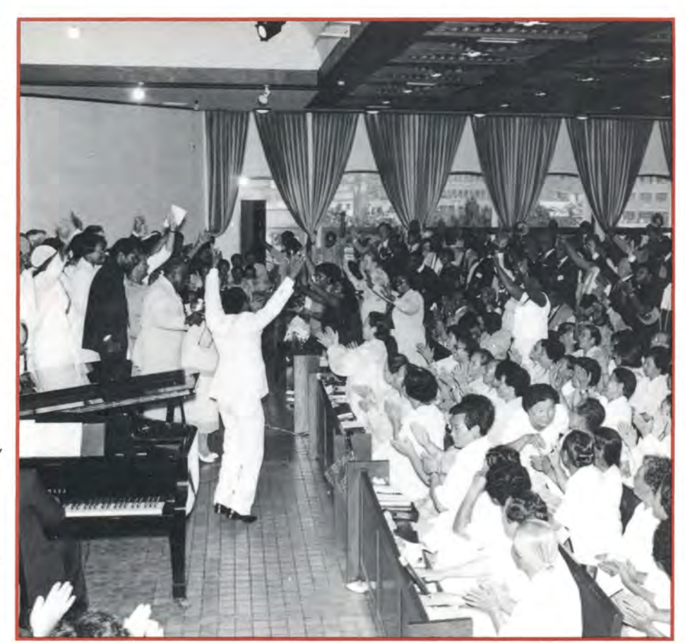
Rousing gospel singing at Sunday service at the UC Headquarters Church in Seoul.

For our day trip to Pusan we went by air. At the airport the ladies were separated from the men and we women were frisked thoroughly for weapons by strictly no-nonsense female security. We were told that because Korea is in a politically tense situation, precautions have to be taken on all domestic flights. Any cameras with film in them were confiscated for the duration of the flight. I said my camera had no film in it. The lady said gruffly, "Open!" I fumbled with it nervously and finally opened it to show her there was no film inside. She found something in my purse and took it out. "What is this?" "A tape recorder," I said. "Play!" she commanded. So I played it and she seemed satisfied. I guess she wanted