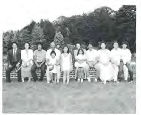
Testimonies by the True Family, p. 8