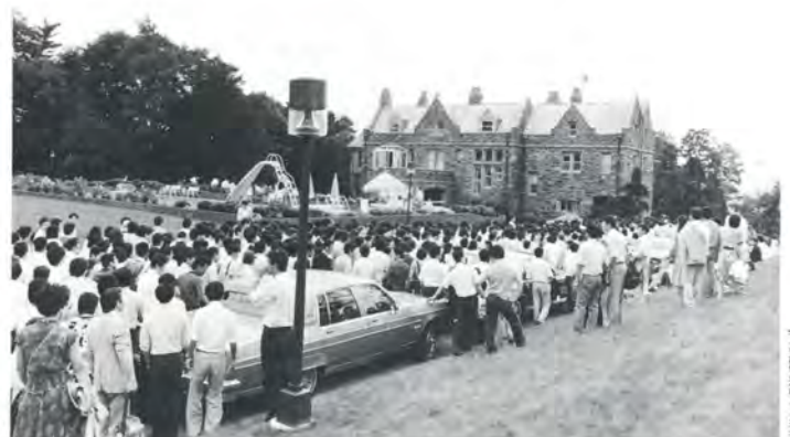
All the Japanese members were invited to East Garden.

Japan has been the enemy of enemies to Korea. Once Japanese authorities even tried to kill me, and because of them I actually came to the brink of death many times. I have chosen Japan as the Eve nation because forgiving and loving the enemy and going beyond one's own misery is the highest condition before Heaven. Young people are coming here from an enemy nation to do God's will. America was once an enemy to Japan, and now you Japanese must try to save her. Germans must also try to save America. Then Japan and America can save Korea. By uniting enemy nations, we can establish the highest tradition centered on God. \square