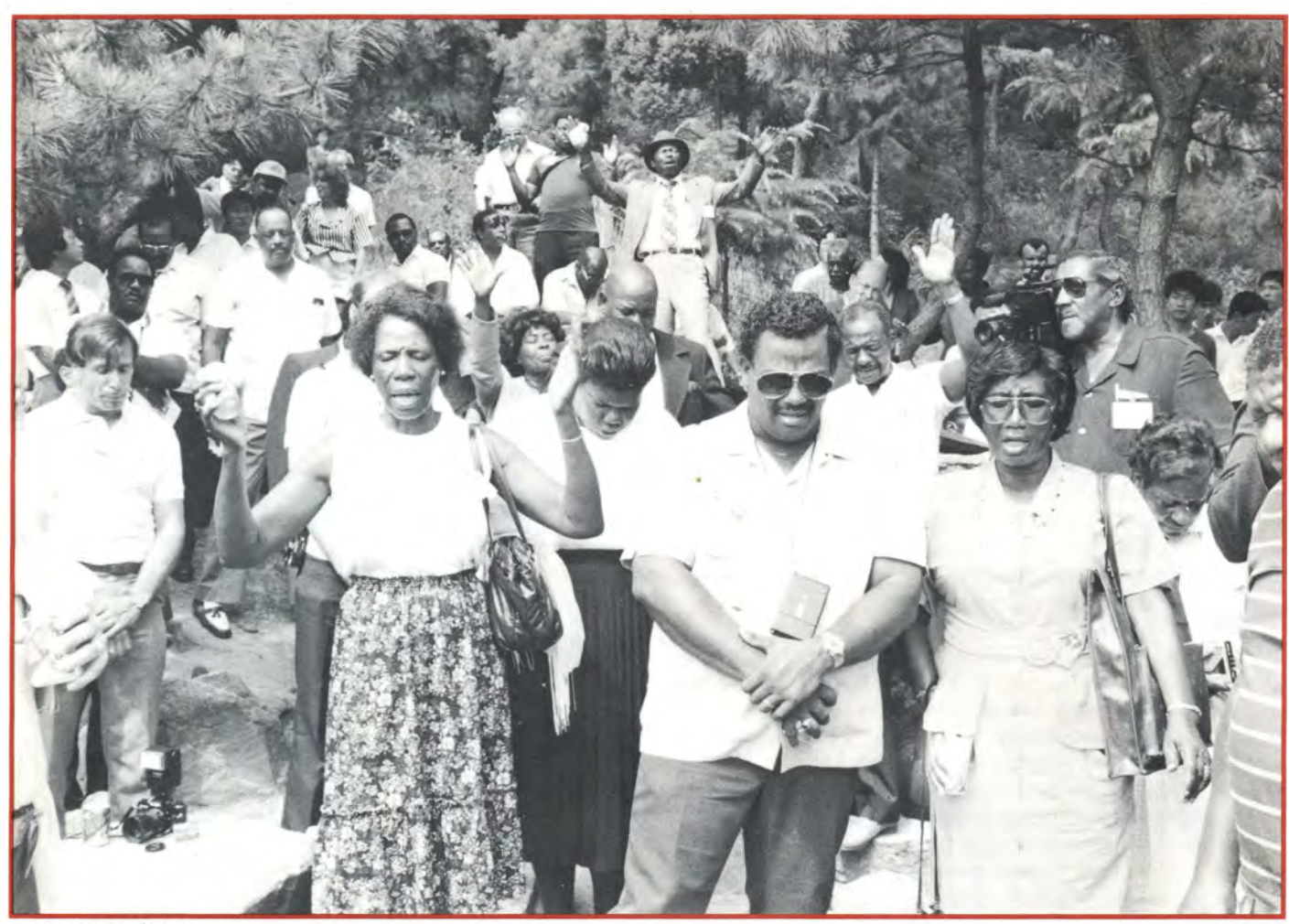
At the Rock of Tears.