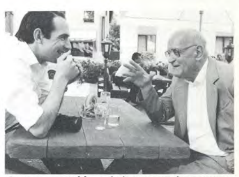
Openness and heartistic connection among the participants developed throughout the week.