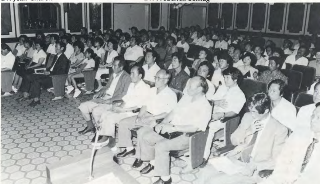
A Korean audience listens to one of the professor's speeches.