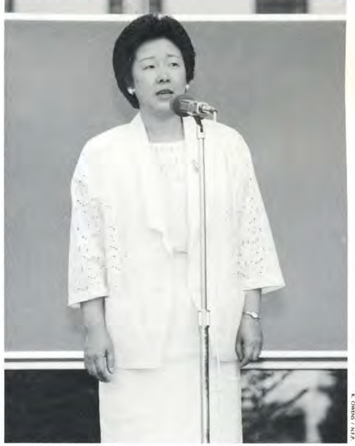
True Mother speaking.

It is very easy for us just to revere and follow Father, but it is not easy at all to substitute for him. I myself know