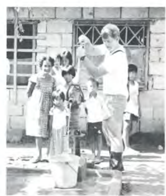
The new water pump.