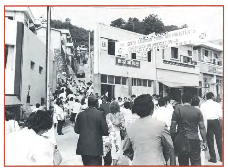
Outside the entrance to the museum in Pusan. The narrow alley leads up to the Rock of Tears.