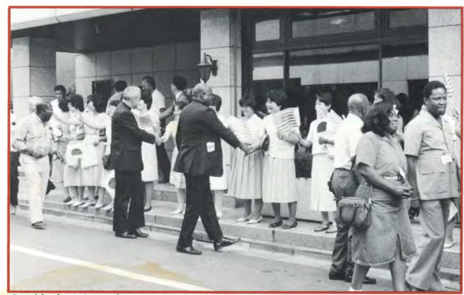
Outside the UC Headquarters Church in Tokyo.

We got a taste of Japanese culture the first day by participating in a traditional Japanese tea ceremony. The tranquility of the ceremony was not possible to preserve as the ministers swarmed noisily around the group and wanted to take part, but the beautiful Japanese ladies in kimonos maintained a sweet, unhurried dignity in serving every last person who sat down. No one could resist receiv-