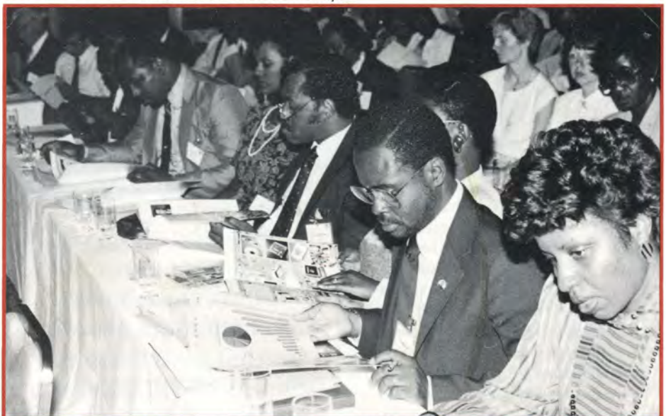
The ministers read literature about the Japanese Unification movement.