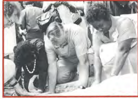
A numbers of ministers started praying and crying deeply at the Rock.

hillsides, so had the historical forces of evil completely overrun the world, and only that one man crying there offered God hope. I couldn't help but stroke the rock in tears in an attempt to comfort God. Never had I felt that God was so vulnerable, so dependent upon us to respond, to do something. I just kept reassuring Him that the advent of these ministers coming here was going to start a healing process, and that His wounds would be healed. "They are coming, they are learning," I cried softly. "See? Here they are. Please don't worry. Everything will be restored back to You."