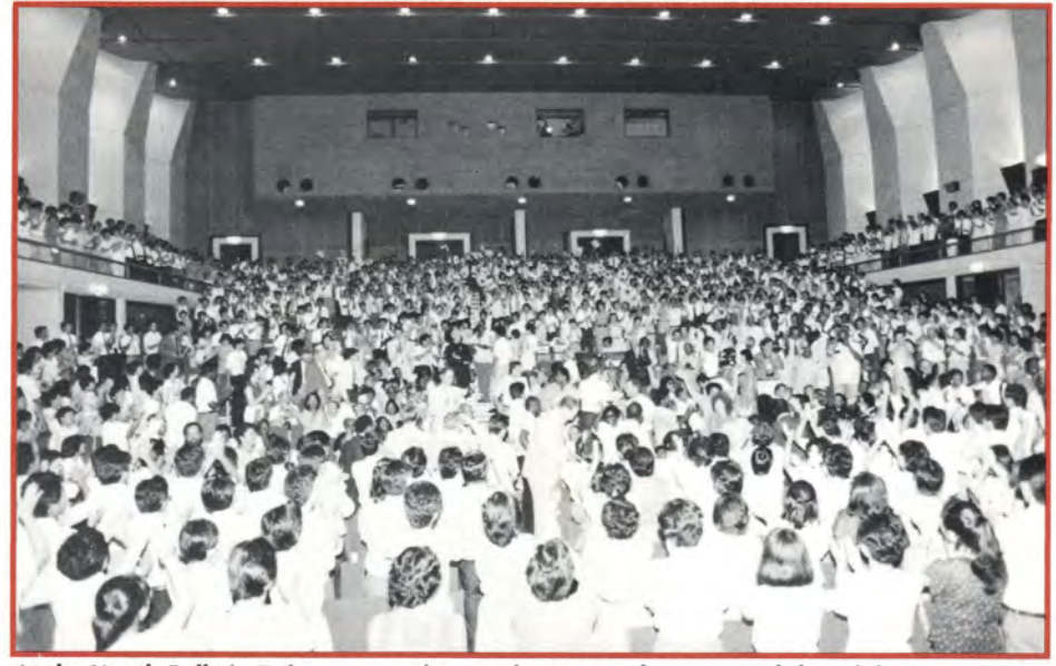
At the Youth Rally in Tokyo over a thousand new members greeted the ministers.