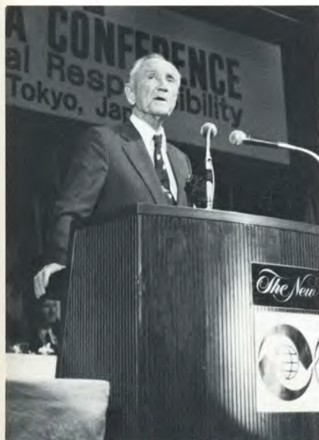
United States Ambassador to Japan Mike Mansfield, delivered a strong message about the value of the conference at the farewell banquet.