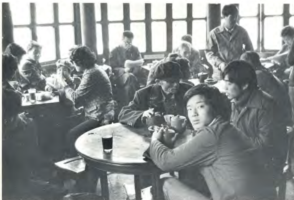
Teatime in Shanghai's "Old Town."

smoke and dust made the first impression as was also the case in Peking. During a visit to the "Wild Goose Pagoda," we noticed several Buddhas on display, but the atmosphere was decidedly less religious than at similar shrines in Japan and Korea. Strains of Elvis Presley's Love Me Tender could be heard in a souvenir shop nearby where five girls attended zero customers.