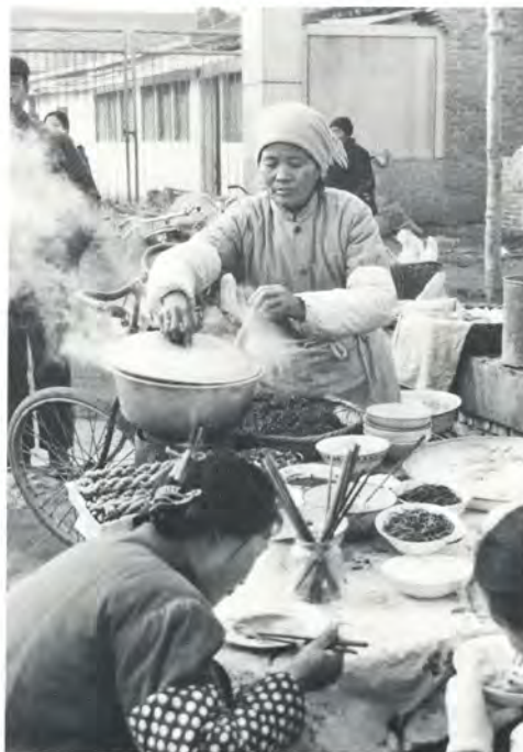
Our guides, knowing China better than we did, almost never took meals with us. They probably slipped out to eateries like this one in Xian.