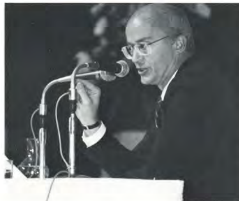
James Watt proved to be as volatile a speaker as he was a Secretary of the Interior. His harsh words about the U.S. media ethics seemed to make everybody at the conference either extremely happy or very angry.

In moving testimonies afterwards, several of the participants expressed their high regard for both conferences. Having given them a forum for their ideas at the Media Conference, they were open to listen to our worldview at the CAUSA seminar. And it will surely bear fruit which will multiply in the form of more objective reporting and a stronger effort to reach the truth. ♦