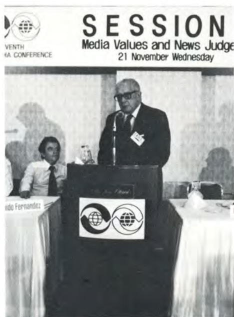
Dr. Jacques Soustelle, conference co-chairman and former vice prime minister of France, offers his comments during the discussion period in one of the sessions.

shape next year's conference, which is to be held in Washington.