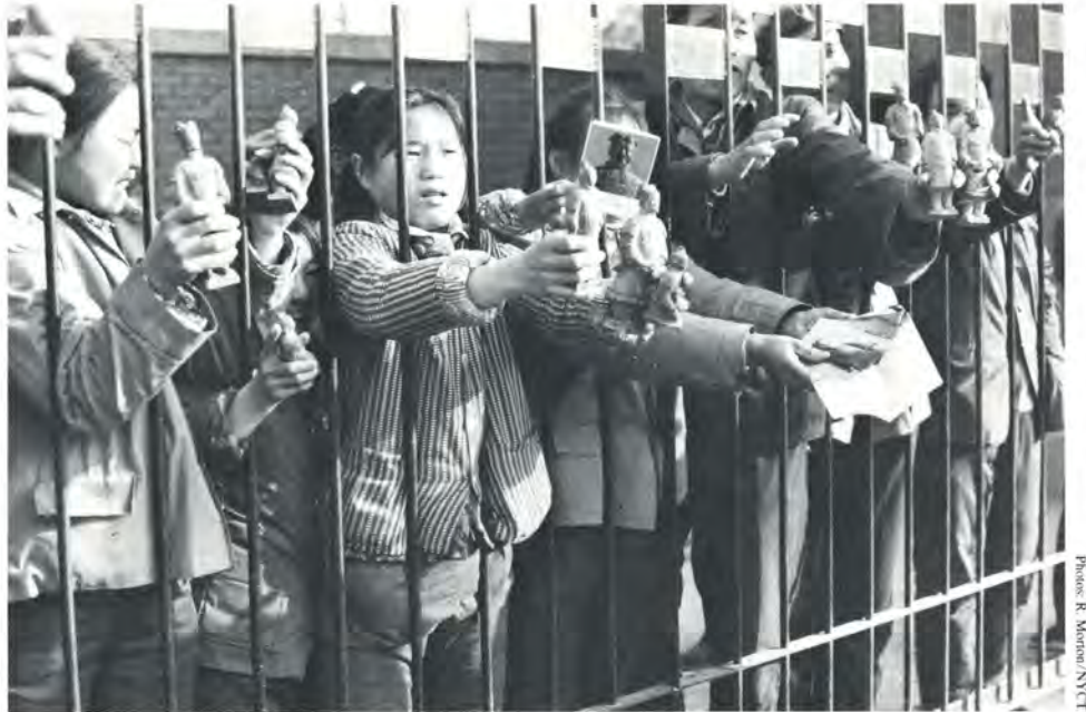
Foreign tourists to the Soviet Union would never encounter citizens indulging in personal fundraising as above in Xian.

In the afternoon, some of the journalists returned to the American Embassy for a session with the ambassador, while others visited the Institute of Soviet and East European Studies for an interesting briefing (see related articles in the New