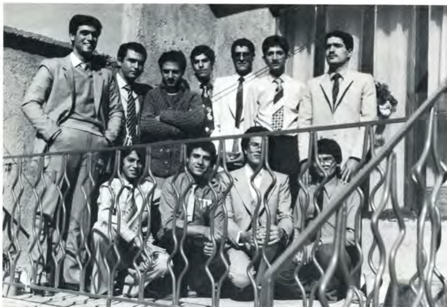
Some members in a northeastern city of Iran.