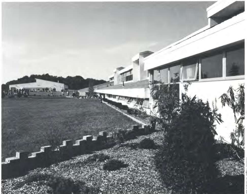
The prison complex. Prisoners return from their work at the T-shirt factory.

I have a weight problem; so the Reverend used to sit and