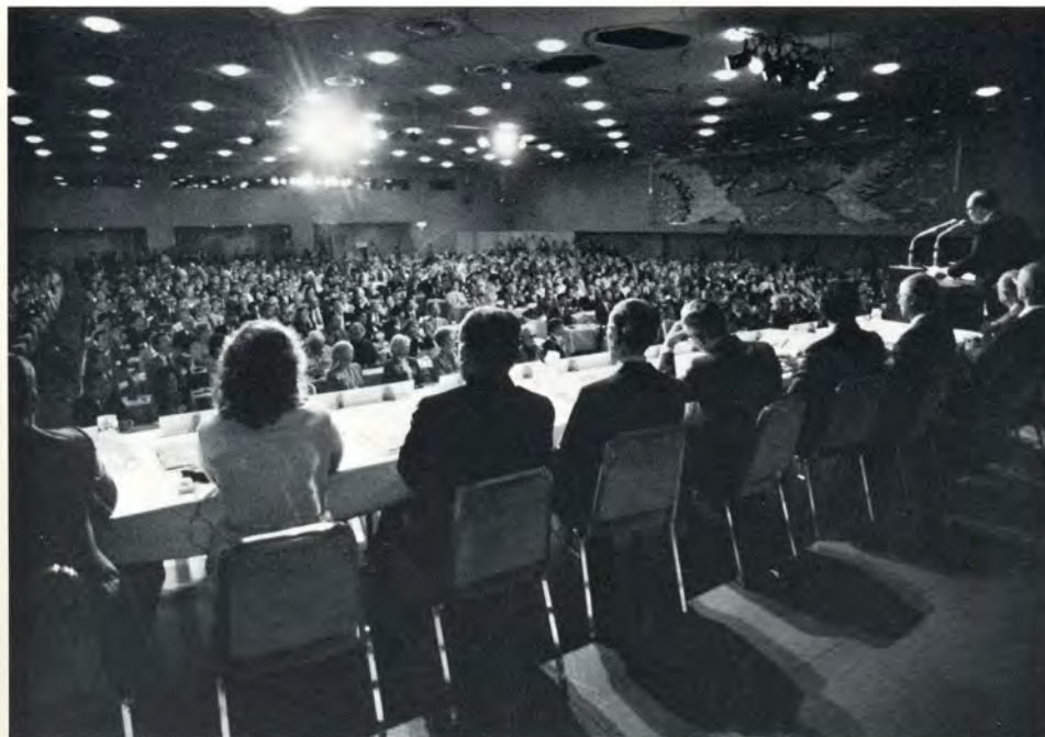
The Seventh World Media Conference was the largest ever, attended by 700 publishers, editors, reporters, scholars and public officials from 87 countries. Discussion centered on the conference theme "Media Credibility and Responsibility."

The World Media Conference brings together like-minded people with the urge to communicate, and gives them a sense of comradeship and optimism for the future.