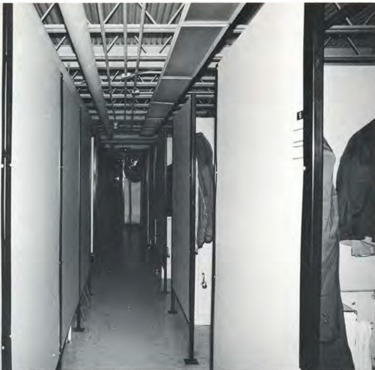
Hallway through the bed cubicles.

going to pay it. But he wasn't even in prison for that! He was in prison for stealing securities and selling them. He never served a day in prison for the $150,000 he owed the government, and the government has never even attempted to convict him on that.