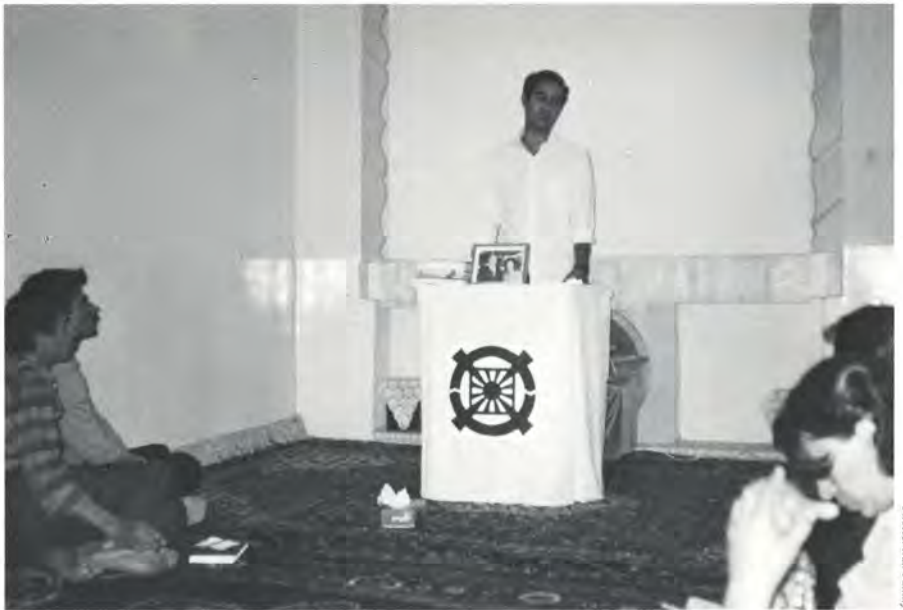
Sermon at a Friday service in Teheran.