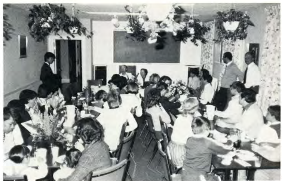
Evening report at the Toronto center.

Since we began this condition, spirit world has inspired many people to inquire on their own about our movement. Again, once they heard about Father's vision, many wanted to be asso-