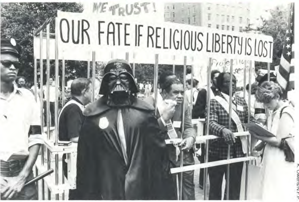
Washington, D.C., August 9, 1984. Ministers in a mock jail cell during the Washington Rally guarded by the "Department of Injustice."