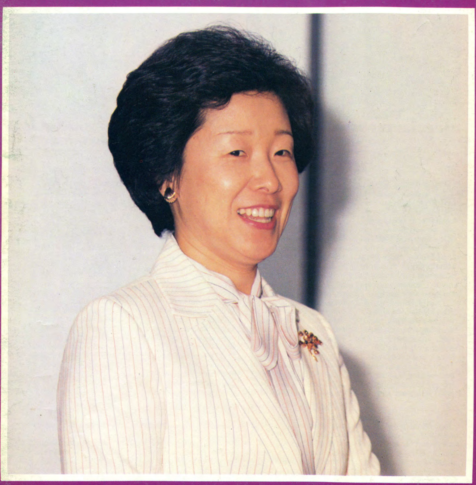
INSIDE: CONVERSATION WITH HYO JIN NIM (PART I) P. 14 OCTOBER 1984