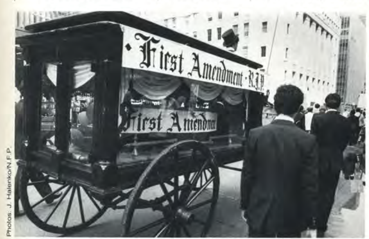
The First Amendment in a mock casket is drawn through the streets of New York City in a carriage.