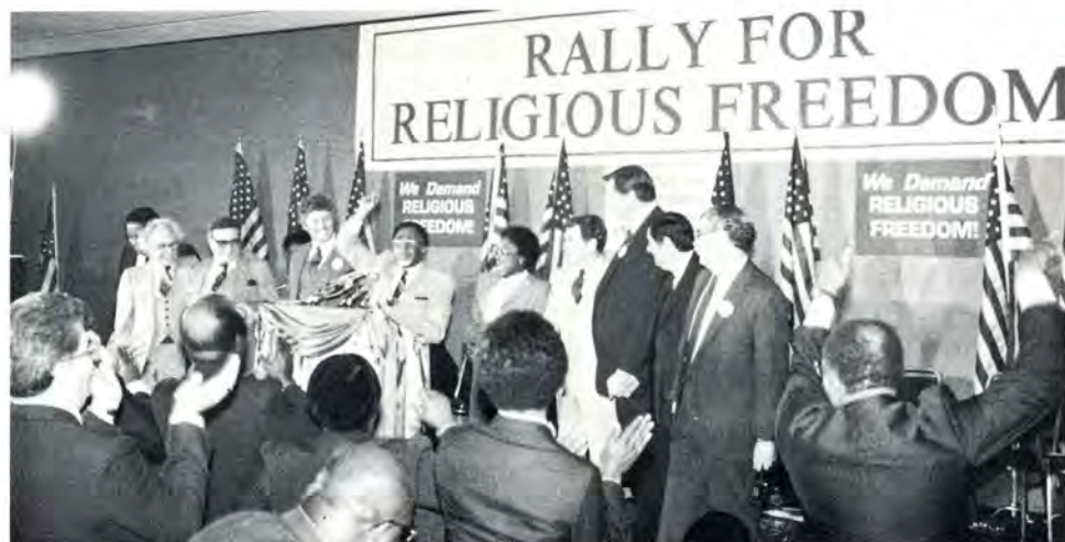
Washington D.C., May 30, 1984. Priests, ministers and lay leaders stand up at the Capitol Hill Hyatt Hotel and pledge to stay in prison for one week with Rev. Moon.

At the conclusion of the rally, which observers commented was charged