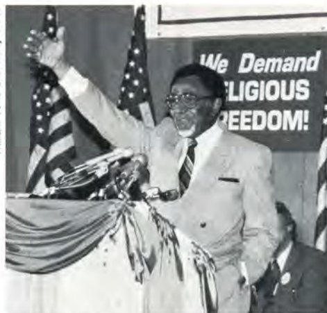
Dr. Joseph Lowery

We are here in a sacred moment in history. God moves in a mysterious way, His wonders to perform. He plants His footsteps on the sea and rises upon the stars. Our nation was founded on the principles of liberty and justice for all. But many of us have been compelled from the very beginning to engage in vigilant and vigorous struggle in order to make these noble principles live for all of God's children.