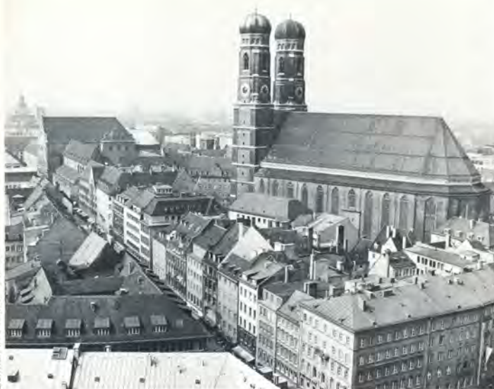
Frauenkirche in Munich.