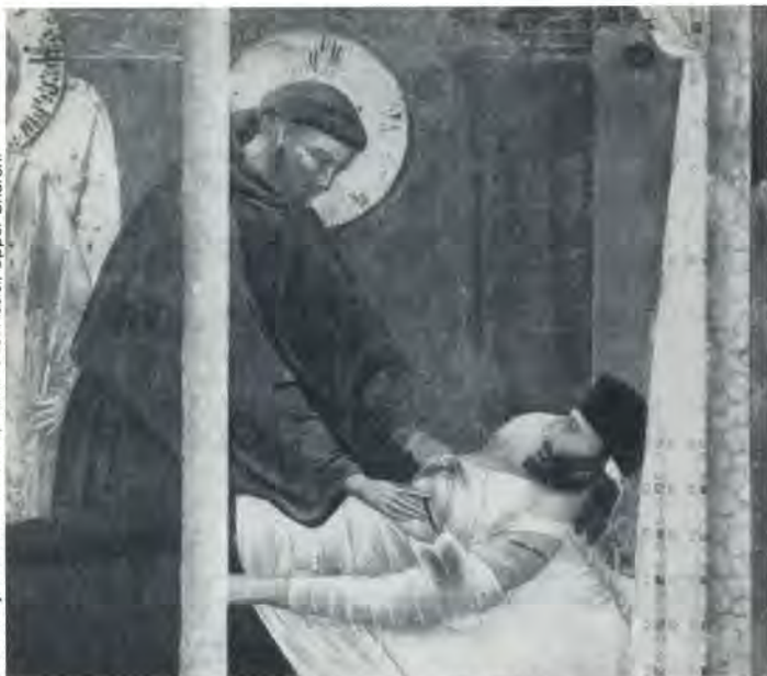
St. Francis of Assisi curing a wounded man.

looked just as if he himself opposed Father, which above all he did not want to do. Whenever he saw Christians oppose Father, he felt great pain and suffered personally because of this.