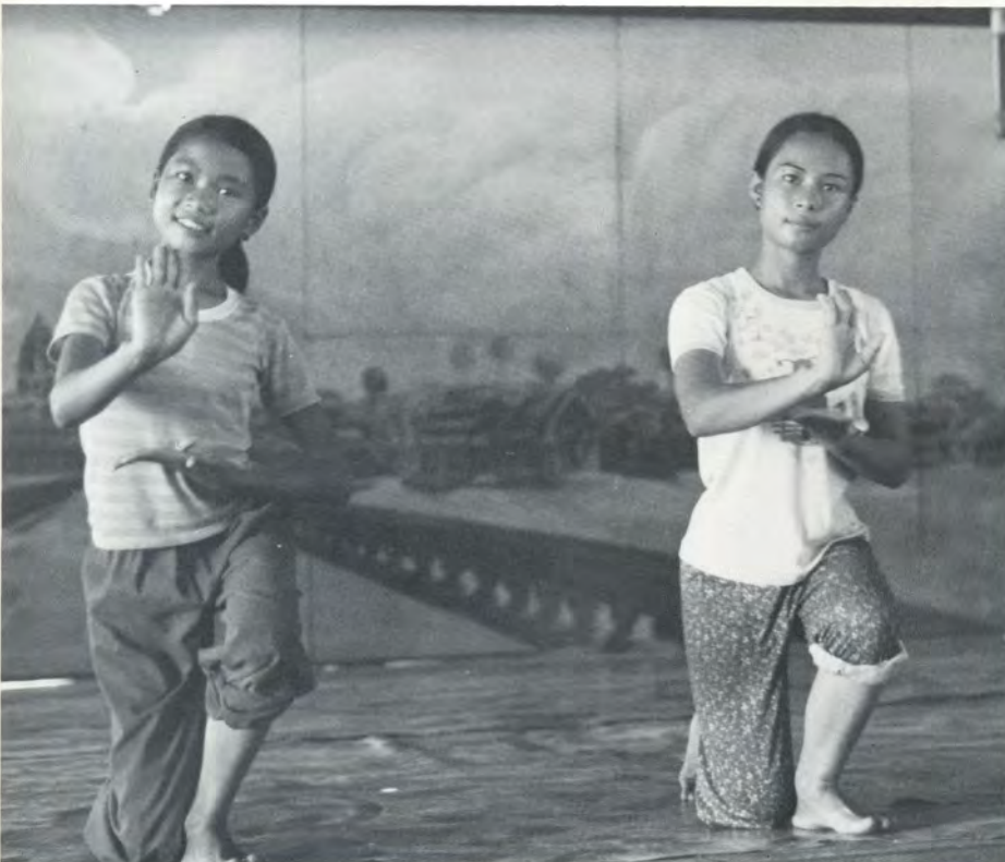
These Cambodian girls danced for the journalists in the Cambodian village of Ben Sangae. Days later, the village was overrun by communist Vietnamese who killed many civilians.