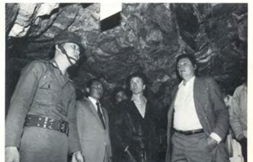
Reporters tour one of the invasion tunnels dug under the DMZ by North Korea. At least ten tunnels are known to exist, but only three have been discovered.