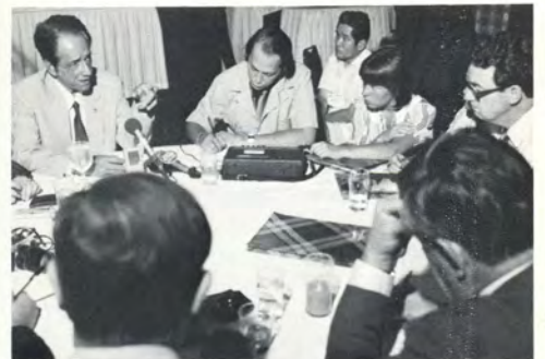
The pro-Marcos mayor of Manila gives his views at an impromptu session with reporters after dinner.