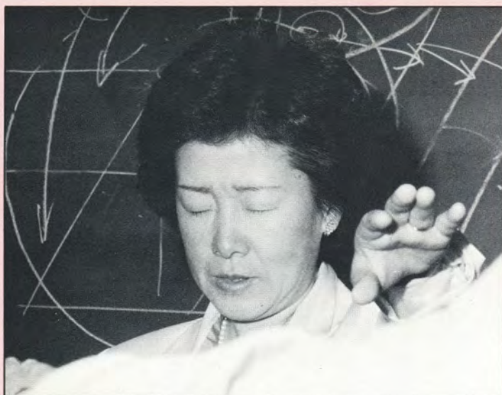
Father and Mother passing on their blessing to all brothers and sisters in Belvedere, toward the end of the Sunday service, on May 20, 1984.