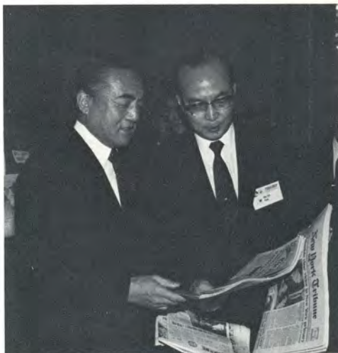
Japanese Prime Minister Nakasone and Col Bo Hi Pak.