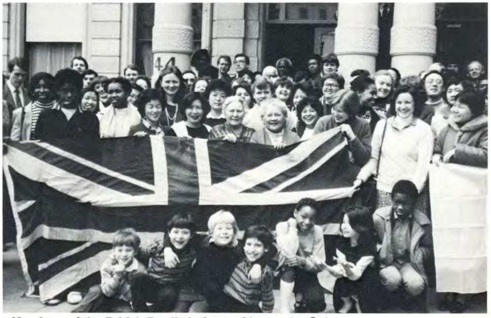
Members of the British Family in front of Lancaster Gate.