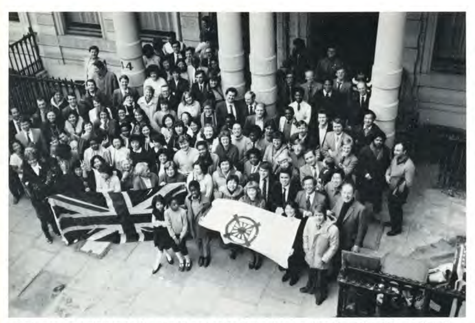
Brothers and sisters in front of Lancaster Gate from a "God-eyed point of view."

I believed that people in communist countries around the world would have some internal experience because of my external witness here.