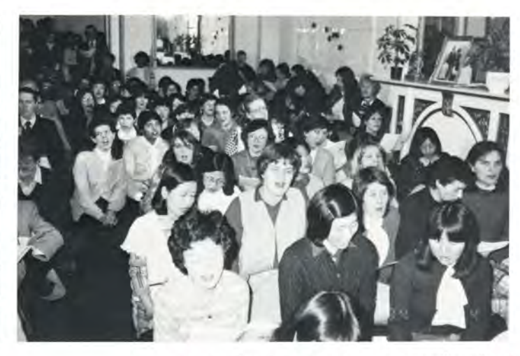
Brothers and sisters at the Lancaster Gate ballroom

We had the attitude with each person we met that we could say to them, 'Come! Go with us! No matter what has happened in the past, come with us now. We have great things to do.'