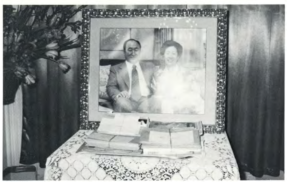
All 733 membership cards were offered to True Parents.