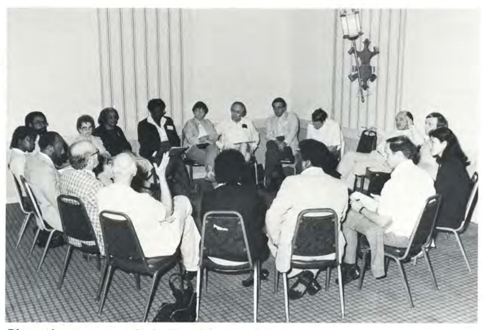
Discussion groups: unity in diversity.

The format of the conferences was very similar to those of the previous three: Divine Principle lectures in the morning, leisure time in the afternoon, and talks on the Unification movement and its social and ecumenical outreach in the evening. (Please see the August 1983 issue of Today's World for more information on the Interdenominational Conferences for Clergy or ICC, the National Council for the Church and Social Action or NCCSA, and the conference format.) Mealtimes were often spent in active conversations, in which views on theology, lifestyle and the Bahamian weather were discussed as people tried to understand the various ways in which we serve and understand God. For many, it was the first interfaith and interracial conference they had ever attended.