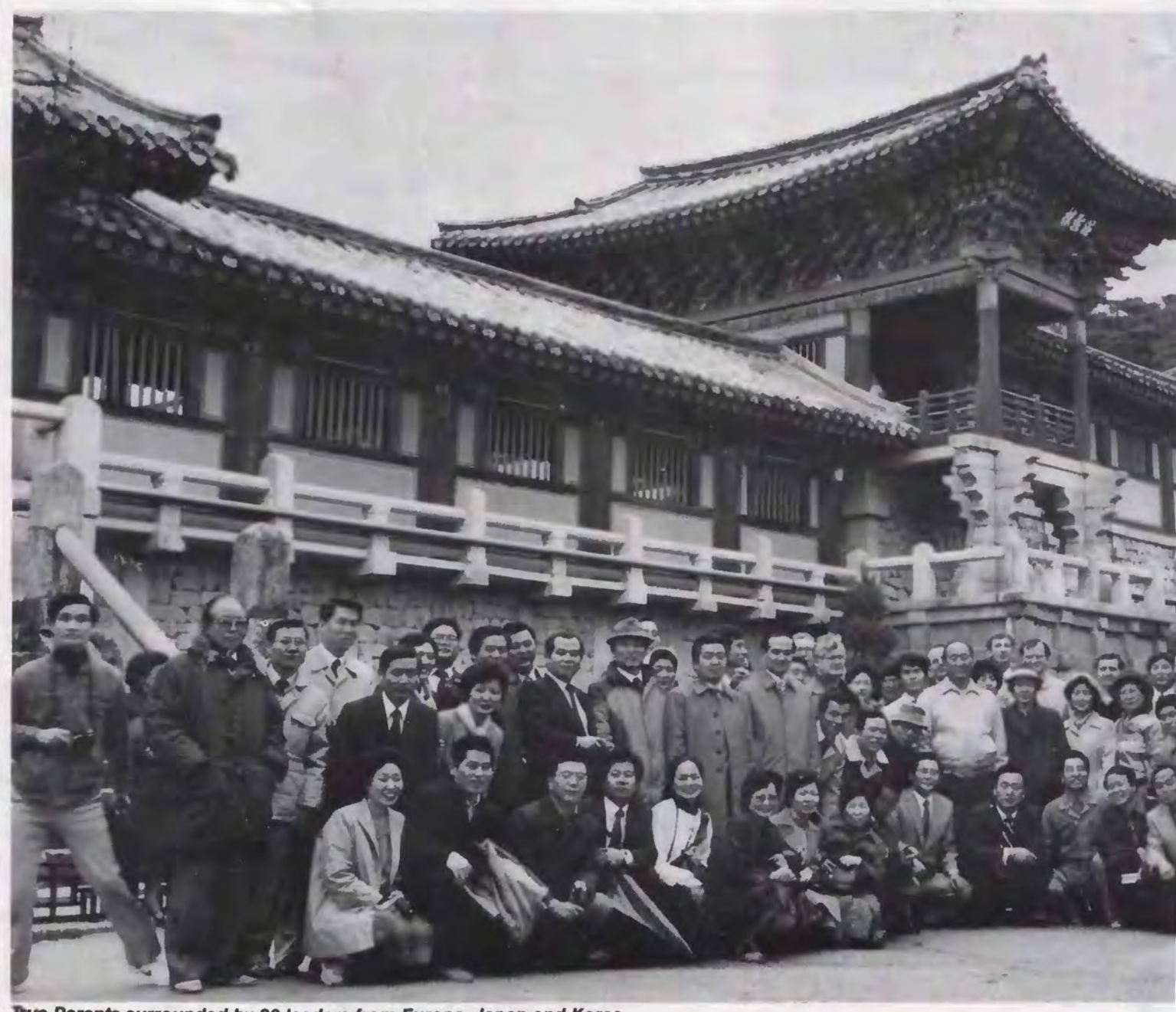
True Parents surrounded by 90 leaders from Europe, Japan and Korea.

REV. SUN MYUNG MOON SEOUL, KOREA EXCERPTS FROM APRIL 4, 1983 SPEECH