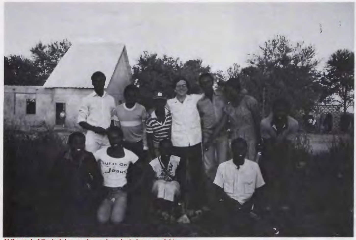
At the end of the training, each member planted a memorial tree.

GREAT HOPE...PROFOUND NEED/AN EXPERIENCE OF