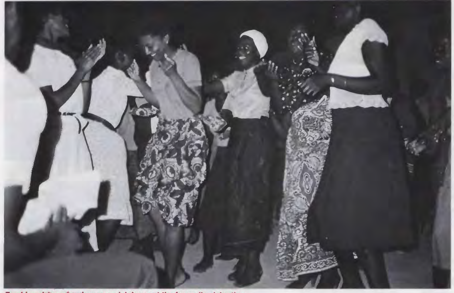
Zambian sisters showing a special dance at the farewell celebration.