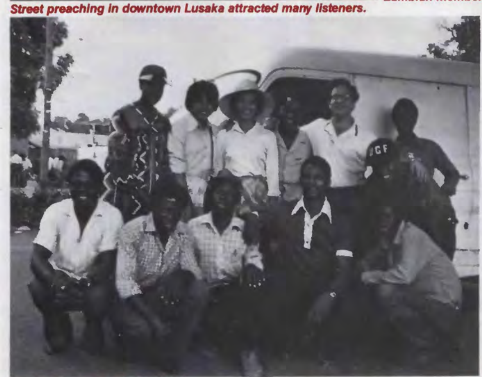
Members pose during fundraising.