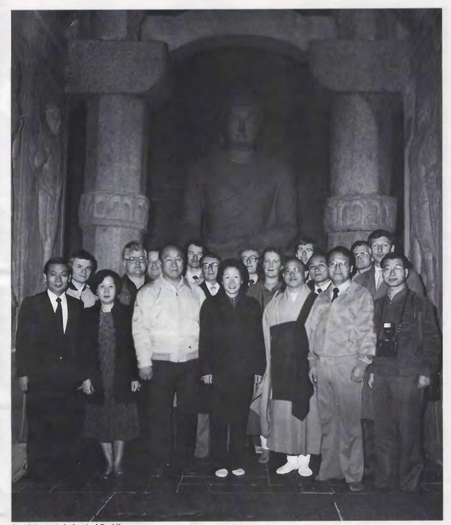
Special guests in front of Buddha...

other countries. On one hand, it is good for many members from around the world to come to us, but on the other hand, it is a cause for shame that we need support from others. So we need to make a strong determination to stand on the front line and set an example for the international members.