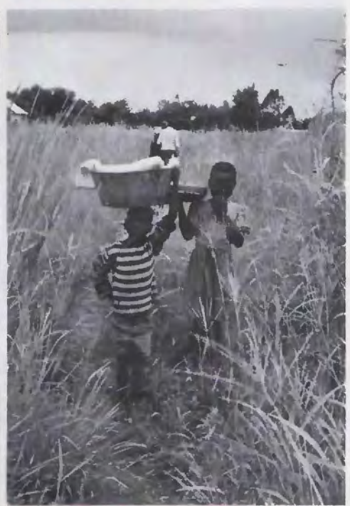
During the training, we received many curious local visitors.