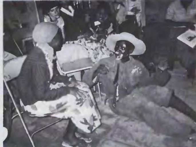
Skits and folk-tales are a long-time African tradition. Zambian members portray their talent.