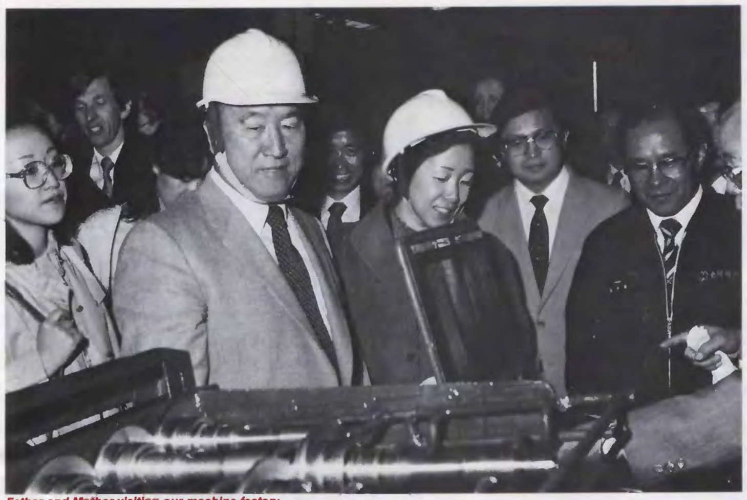
Father and Mother visiting our machine factory.