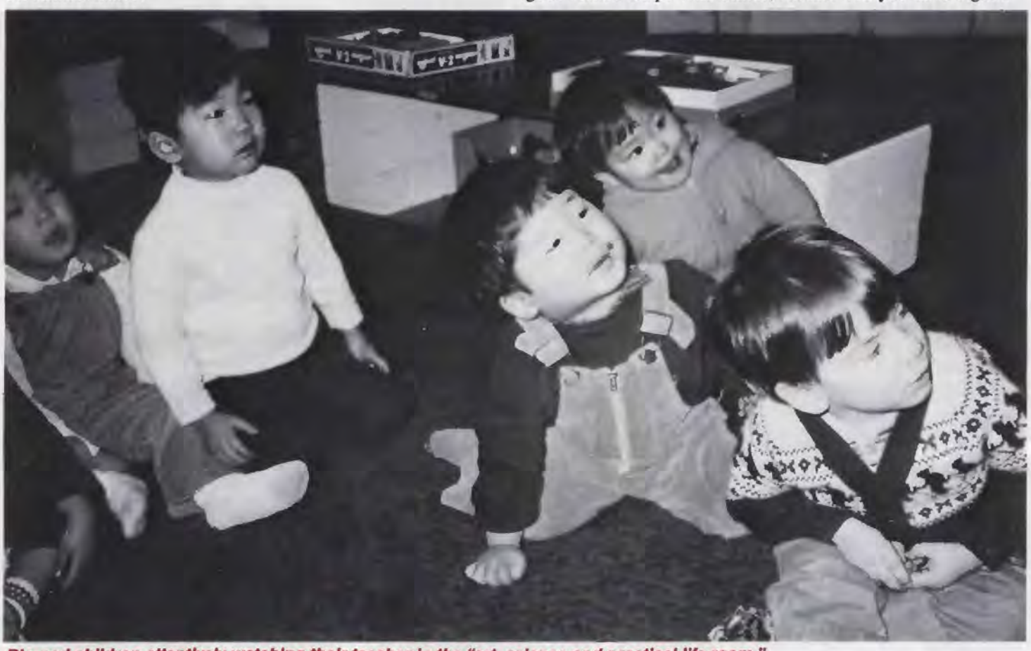
Blessed children attentively watching their teacher in the "art, science and practical life room."

In our nursery and kindergarten the main emphasis in education is on human relationships. If you do not have good relationships with others, neither will you have a good