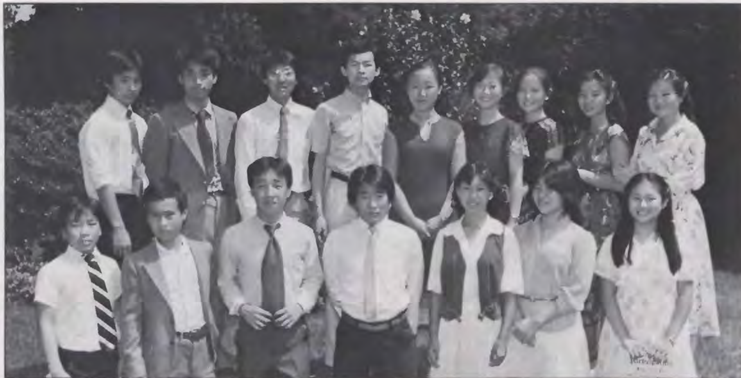
Some of the participants in last year's blessed children's workshop.

The blessing is something like a reservoir of water, and you are creating the channels that will lead the water into your lineage.