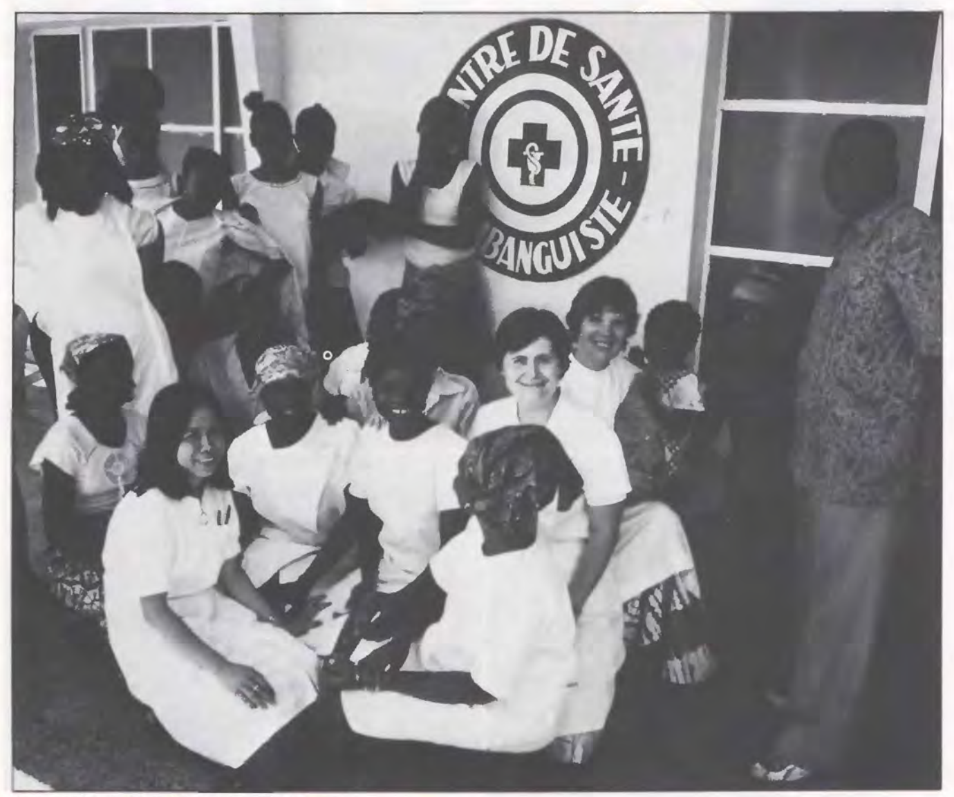
Team members in front of the Kimbanseke dispensary.

"The daring and remarkable work of the members of the WRFF medical team made many faces beam with smiles, through their determination to accomplish and their common sense in the service of a high ideal."