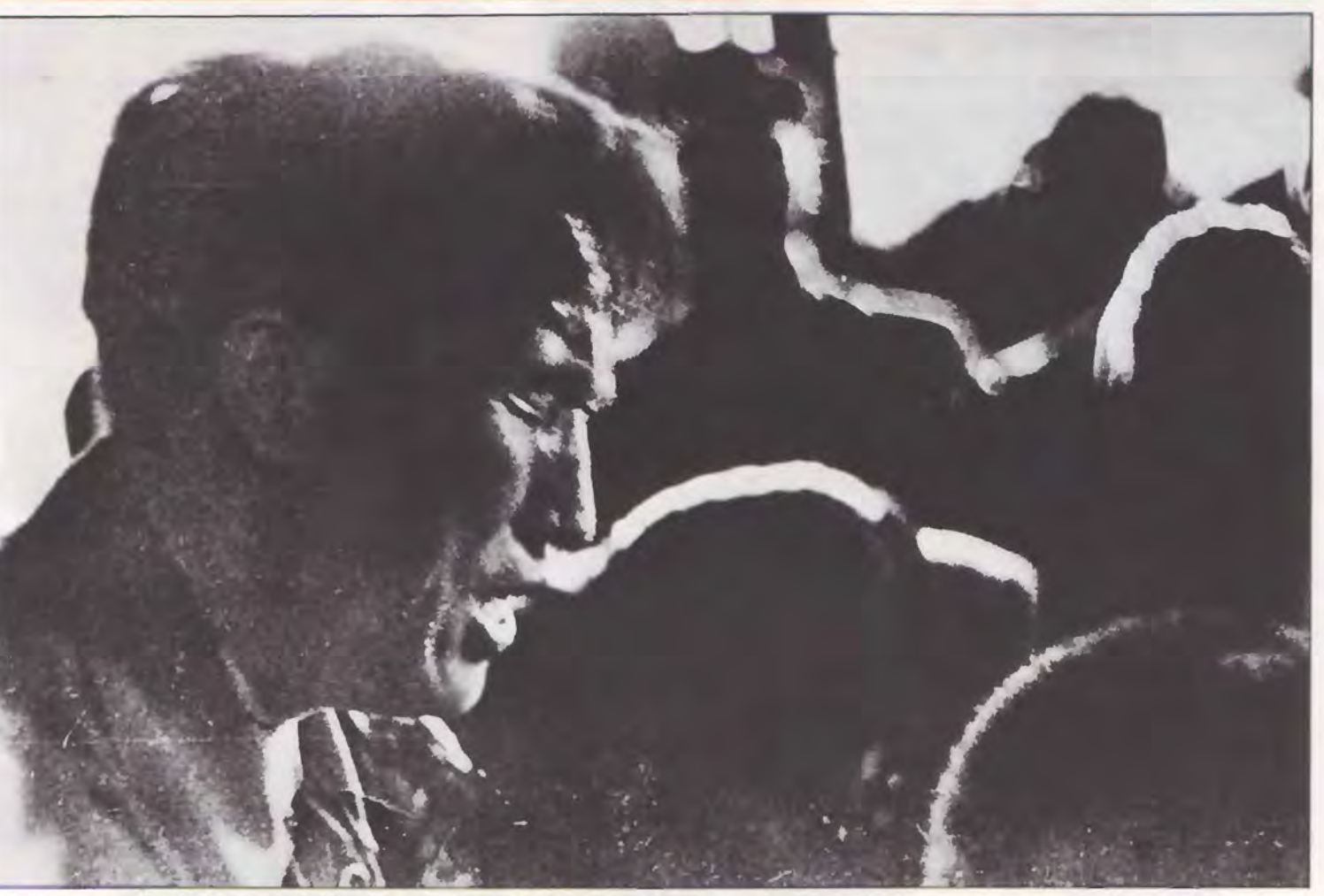
June 4, 1962, Korea, 72-couple Blessing

...We did not realize that there were enemies. We did not realize that the enemies were standing against heaven and earth. We did not realize the whole world was in their hands. Father! Now we know this. The enemies are trying to control mankind continually, and will do so even in the future. They are standing against Thee, against the True Parents, against the true families, and they have also been standing against Your faithful servants throughout all ages. Father! How long You have been waiting for those who can and will conquer and subjugate these enemies.