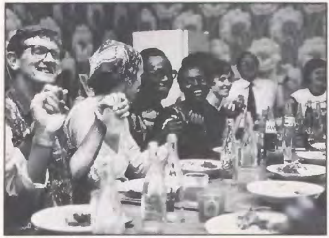
"Let's join our hands, friends of the earth."