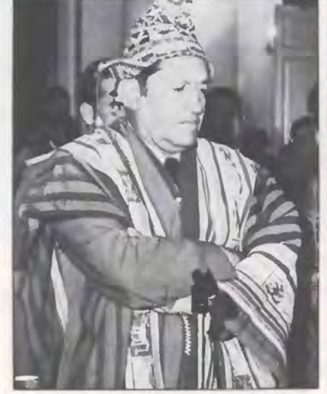
Bolivian president and fisherman, both in national costume.