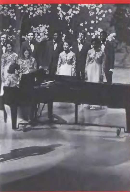
songs of his composition.