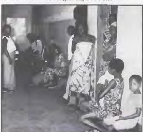
Patients awaiting consultation at Kimbanseke dispensary.

"Many of the patients come in an advanced state of illness, because they do not have enough money to come to the dispensary until their condition is totally unbearable."