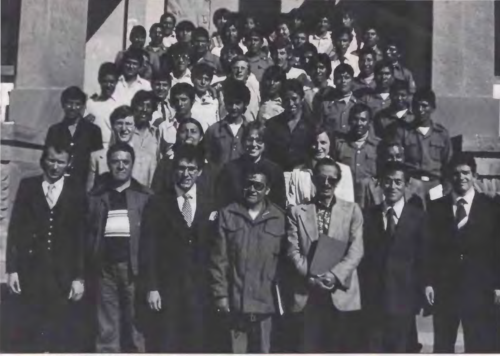
Workshop participants in front of workshop location.

of the country, the majority of them high school seniors or college freshmen. The best student of the class was also the youngest—15 years old.