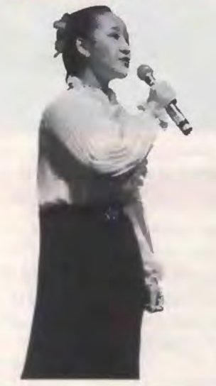
Historic CAUSA Workshop in Bolivia