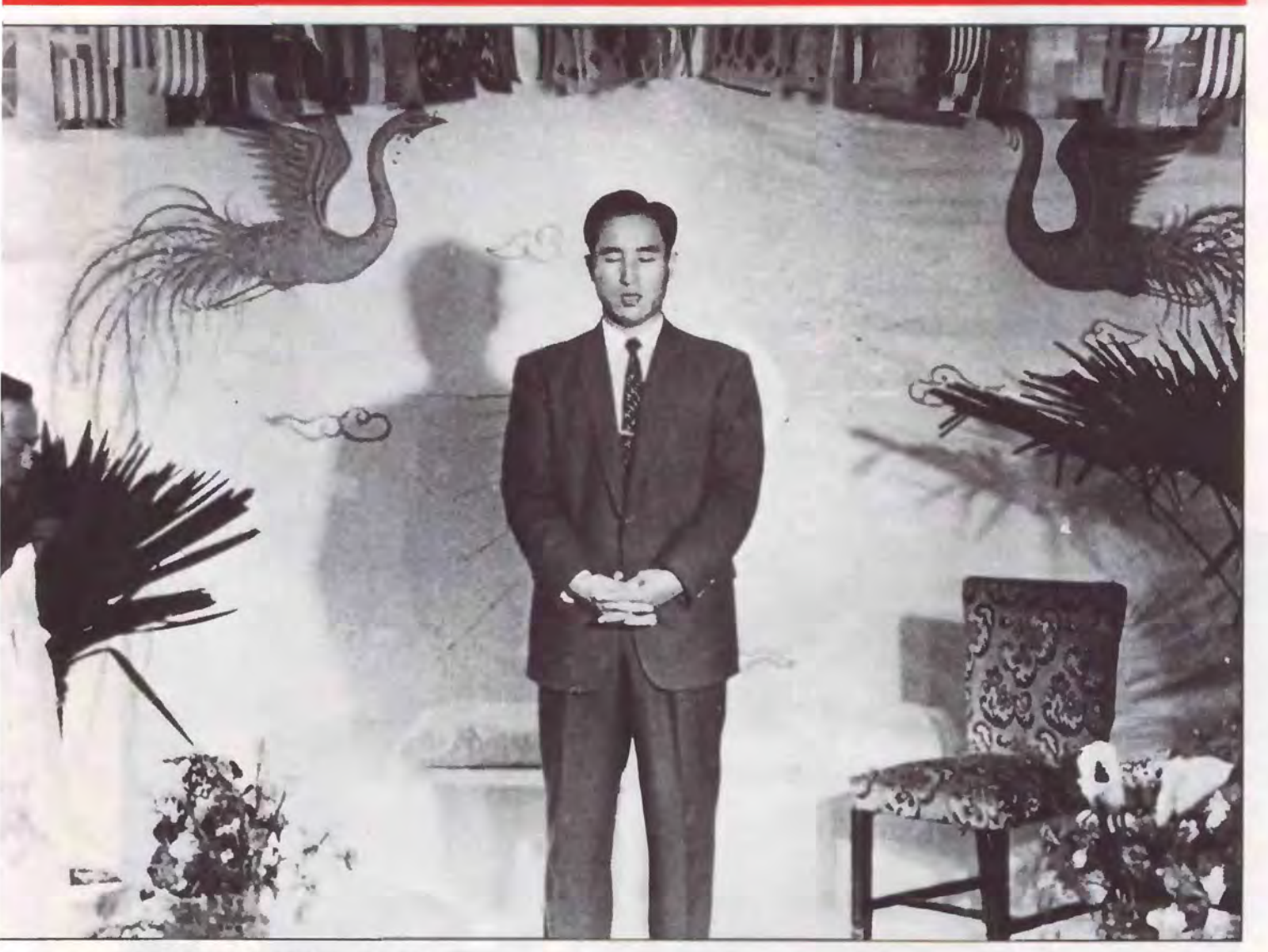
October 3, 1965, Japan

Heavenly Father, we are studying Your woeful principle of indemnity. Although we can seek Your comfort in times of hardship, still unless we rise above a given standard of indemnity, we cannot establish the standard that meets with Your own satisfaction. When we see that we cannot subjugate the substantial Satan to achieve the furthest limit of victory, we feel disgraced before our responsibility to account for our ancestors' sins. We realize that countless ancestors trod this same path, aiming for the goal that You desired, but unknowingly always ended as sacrifices for Satan. We pray with deepest sincerity that in this age You may place us in a position where we will not simply repeat their failures.