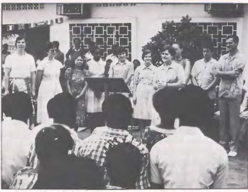
Introduction of the medical team at Sunday service.