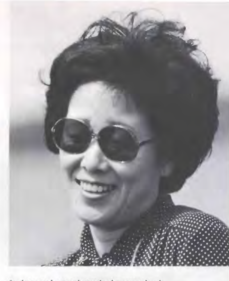
Seminary graduates volunteering for ocean church.

During the tedious hours of waiting for a tuna to strike, people complain and fight. But once a tuna bites, they are instantly united as one team. This is the unification spirit I am trying to promote. I want Unification members to come from all over the world to experience this.