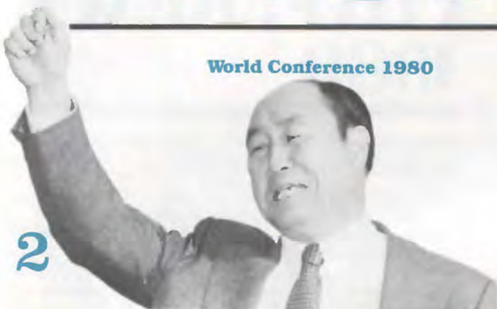
Reverend Sun Myung Moon