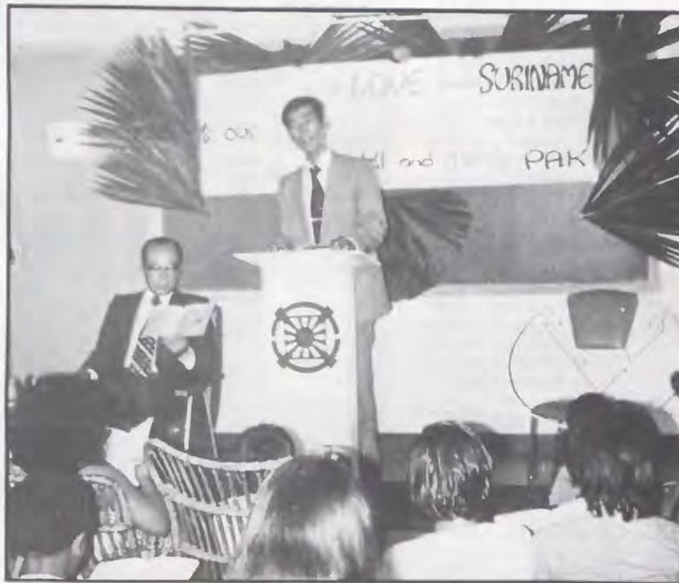
Col. Bo Hi Pak visits Suriname.

The newspaper started out very small, but eventually, we could print color on the cover, and make it in the format of a monthly news magazine. We print an average of 1,500 copies a month. Usually, the cost of printing is covered by advertising and subscriptions. Advertising is also a good way to contact people. This was generally my responsibility. I would visit people, and not just ask them to give us advertising, but explain the purpose of the paper. Many times, people would be inspired by its purpose and would want to buy advertising. However, the present economic situation in the country has made selling advertising more difficult.