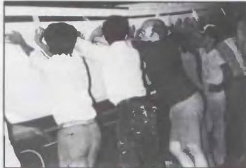
Teamwork speeds the construction of fiberglass boats.