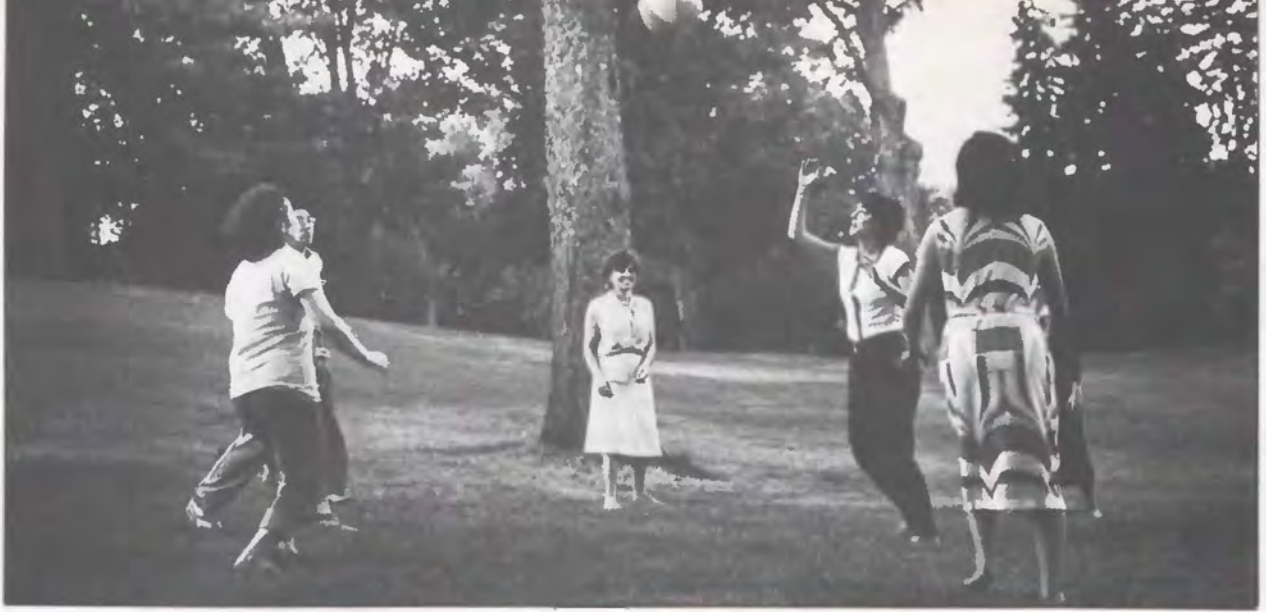
Workshop participants relax with games at Belvedere.