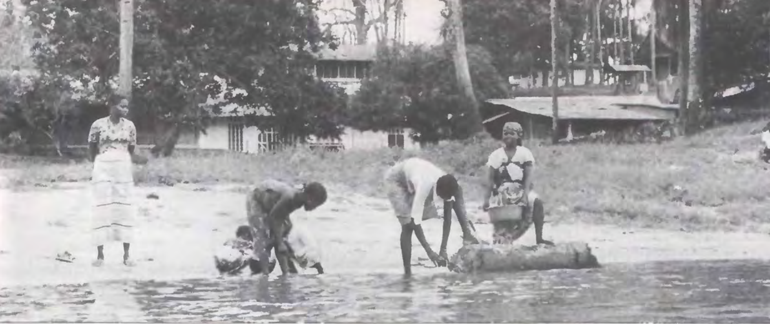
Washing clothes along the Ogoone River.