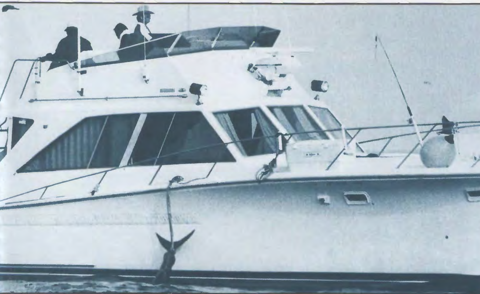
The "New Hope" with Father seated at the head of the stairs, wearing white hat.