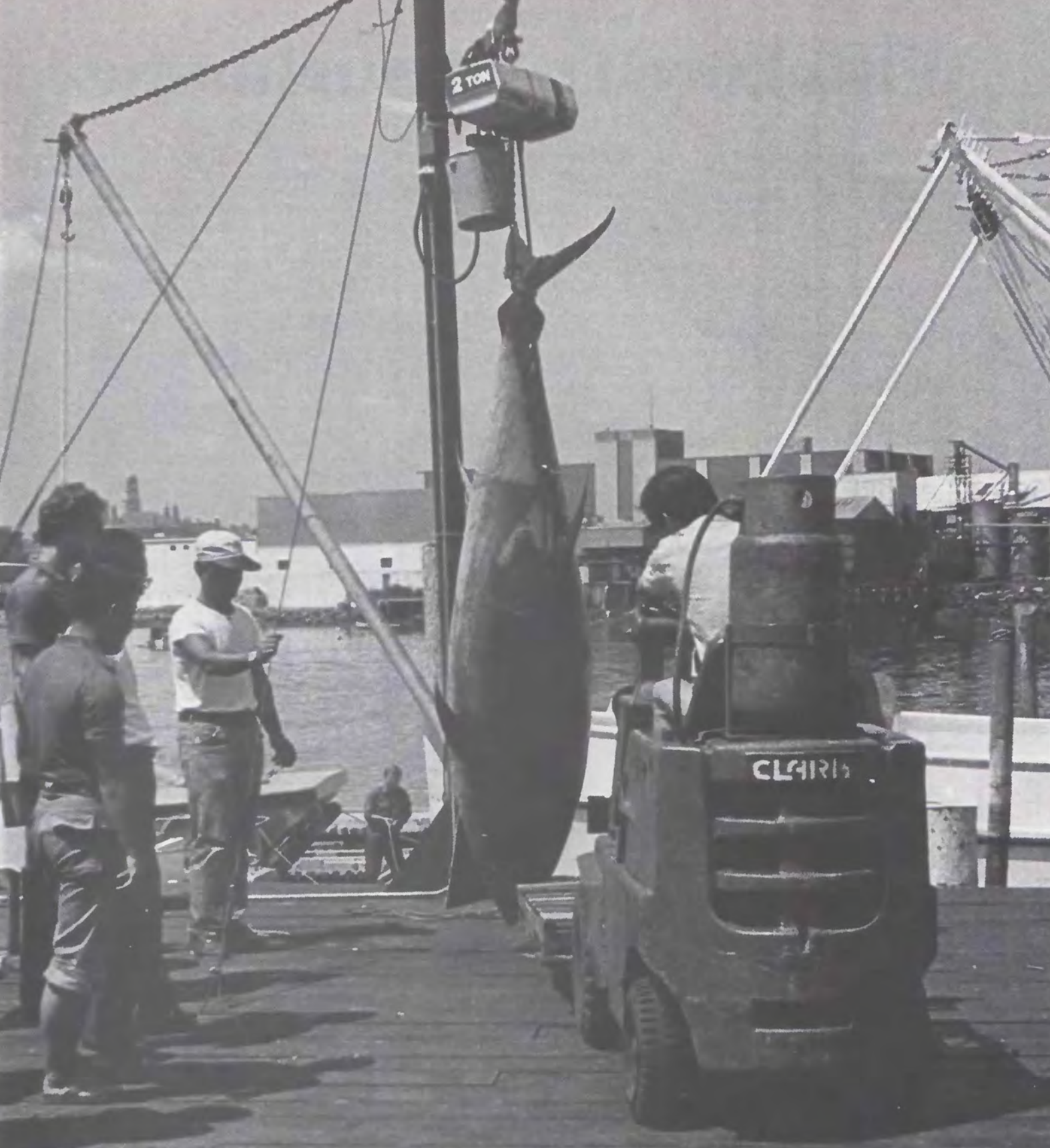
900 lb. Tuna caught by Unification Church members is hoisted onto the dock at International Seafood in Gloucester.