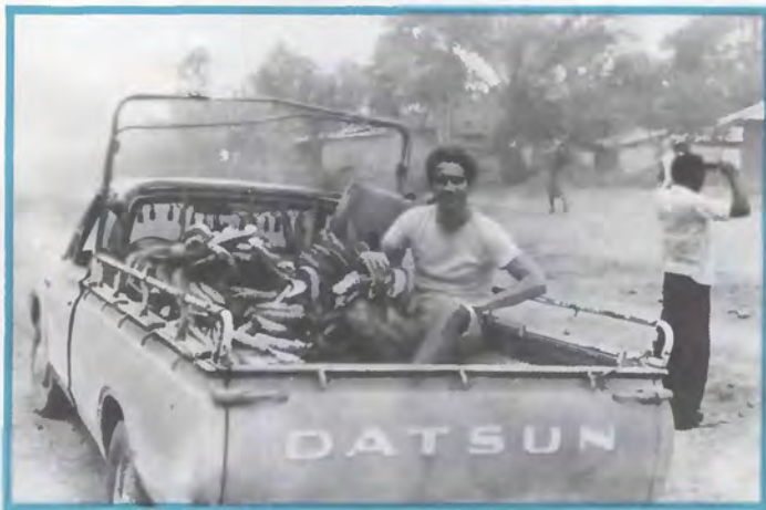
On the way from Lambarene to Libreville.