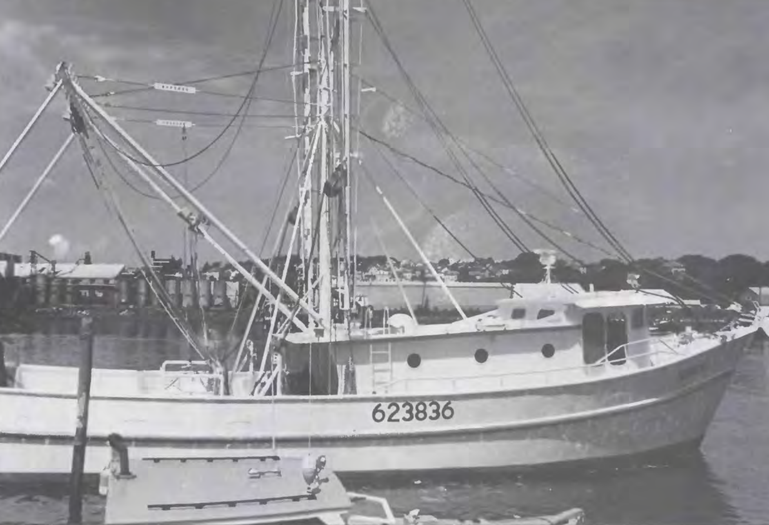
The sparkling new "Sunrise," a 90-foot dragger built by Unification Church members in Bayou La Batre, on display in Gloucester, Mass.

terrible smell. There is no escape from it. On one side of the boat, the chum is being cut up; on the other side you eat.