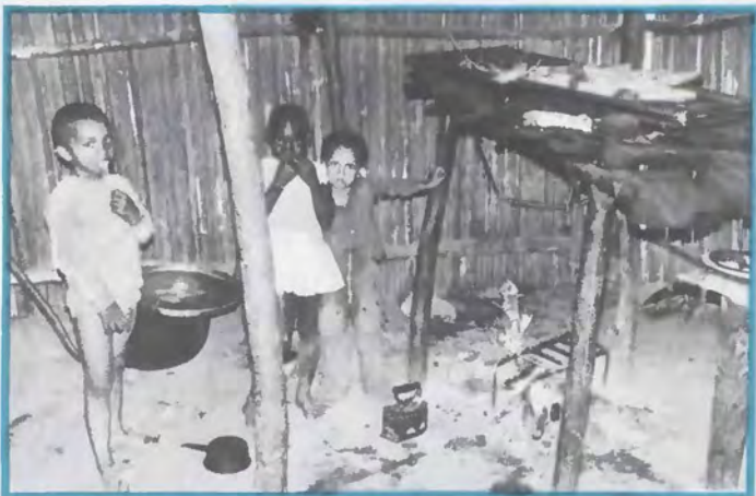
The kitchen in Lambarene.