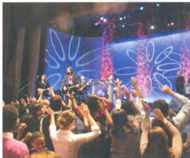
The Lovin' Life Band, Sonic Cult, provides a creative and energetic musical backdrop for the service that is broadcast to more than a hundred locations throughout the United States.