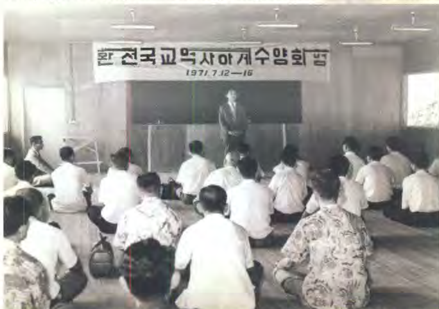
Summer workshop on self-improvement for district leaders from around Korea

Therefore, you should clearly know that it is your mission as Unification Church members, and especially as the leaders of local churches, to have the subjective character by which