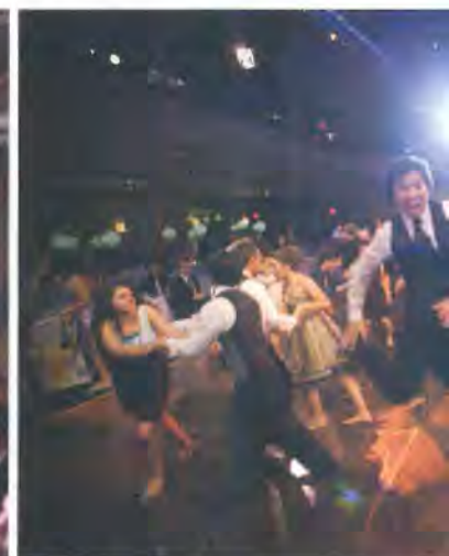
Left: Lovin' Life makes it a policy to be up there with the best in visual and sound quality; Middle: Ballroom dancing has become a social activity of choice for Lovin' Lifers; here, the recent CARP Winter Ball showcases the enthusiasm.

often pulls you back from spiritual growth and maturity.