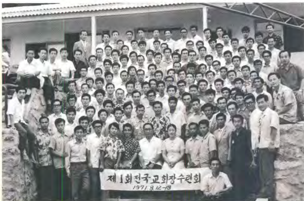
First church leaders meeting in Cheongpyeong, August 12–18, 1971, immediately after the training center was completed. The church leaders are standing (with Father and Mother seated) on the stairs down to the boat dock, which are still there today.

The grandmother was also embarrassed and she just bit her lips. [Laughter] Even though they were embarrassed, they knew they had to receive the blessing. Old and young alike are extremely serious in that kind of situation. Think about it. If you marry an old person, all you are going to do is take care of him or her. Nevertheless, you do that, run errands for and serve your spouse. If the person loves you, is it good or bad? Even though your spouse interferes in everything you do, the one thing that makes this all right is love. Those of you