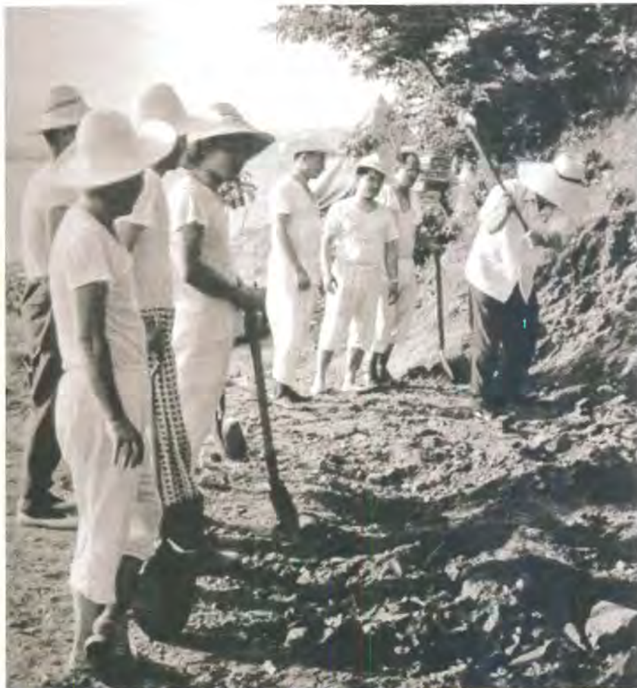
Father (at right, wielding a pickaxe) breaks the ground for the Cheongpyeong training center, June 17, 1971. A tent is visible in the background.