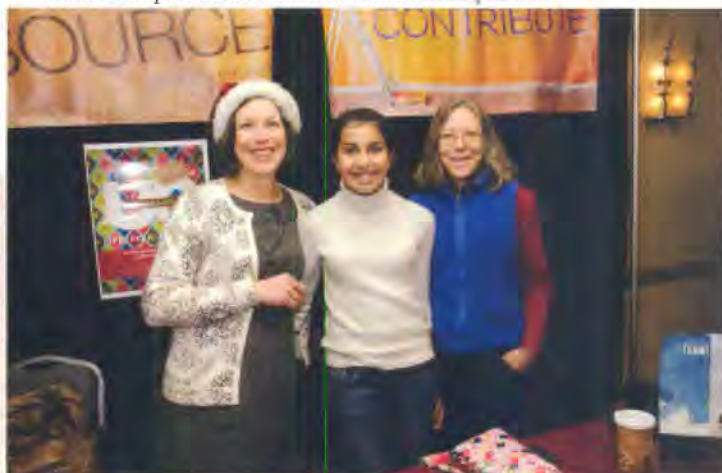
Left: One week's theme for Junction, encouraging participants to express their beliefs; Right: A table set up at the Lovin' Life Sunday service at the Manhattan Center invites all comers to join programs and activities, to take part in the fun.