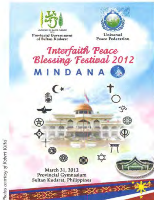
The front cover of the program for the Interfaith Peace Blessing Festival in March