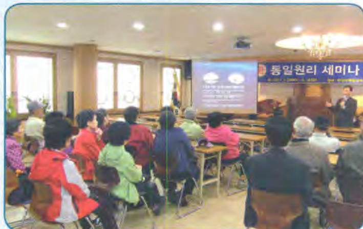
Spiritualists attended some of the Divine Principle lectures that the Euijeongbu Church holds on a regular basis.

Many other countries sacrificed their young men to help us, and that's how this nation developed to what it is now. I got a list from Yongsan [War Memorial offices] of all the soldiers who participated in the war, and I prayed to send them all to good places in the spirit world.