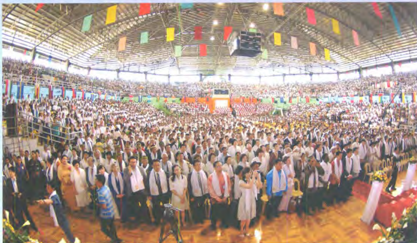
Some 16,000 people filled the gymnasium for the Blessing Festival—and even more were outside.

University campuses. Students and teachers were deeply touched by the power and clarity of the Principle. Even at the lunch break during one presentation, faculty members organized programs on another campus with six hundred students.