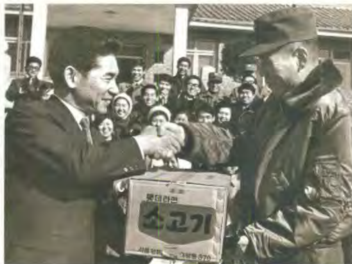
Japanese members visiting Korea pass out care packages (here, beef-flavored instant noodle soup) to Korean soldiers.