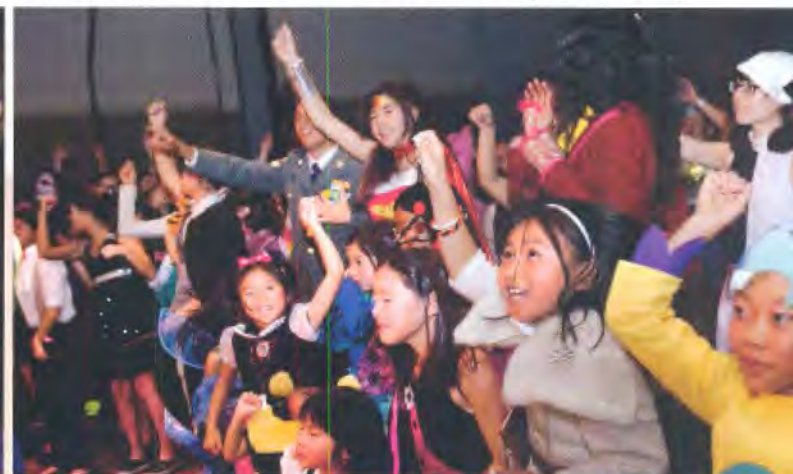
Left: Lovin' Life Ministries uses music as a form of prayer, but you can keep your eyes open, smile and dance; Right: The younger set cheer for the Lovin' Life band, Sonic Cult, at the "Autumnfest" Halloween costume party in Las Vegas last November.