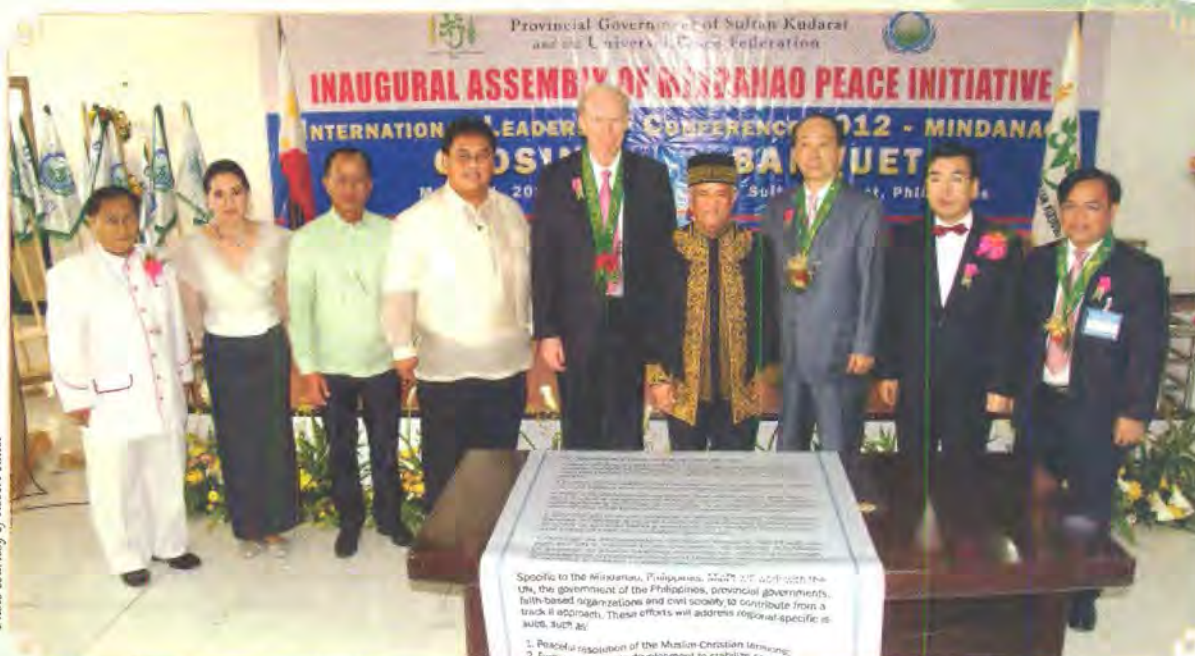
A UPF International Leadership Conference (March 29–30) in Davao on the island of Mindanao in the Philippines concluded with the launch of thirty-seven UPF chapters on Mindanao and of the Mindanao Peace Initiative (pictured here). The next day, an estimated 35,000 people took part in the Interfaith Peace Blessing Festival, cosponsored by a provincial government on the island.