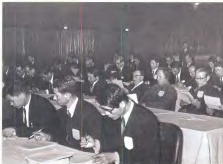
The second public presentation of Divine Principle, February 15–17, 1971