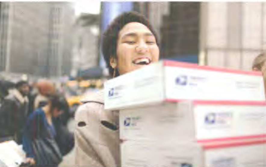
Mailing out the latest Loving Life Ministries approach book and materials to our churches all across America

In many of the growing Christian churches, they actually have more people in the small group ministries than they do in the main ministry. We anticipate that also happening in our case. Some people might only want to come to the midweek services or join the small groups, and we welcome them. But the heart of our ministry is the membership, and the center of our ministry is Sunday service, where we can learn and grow