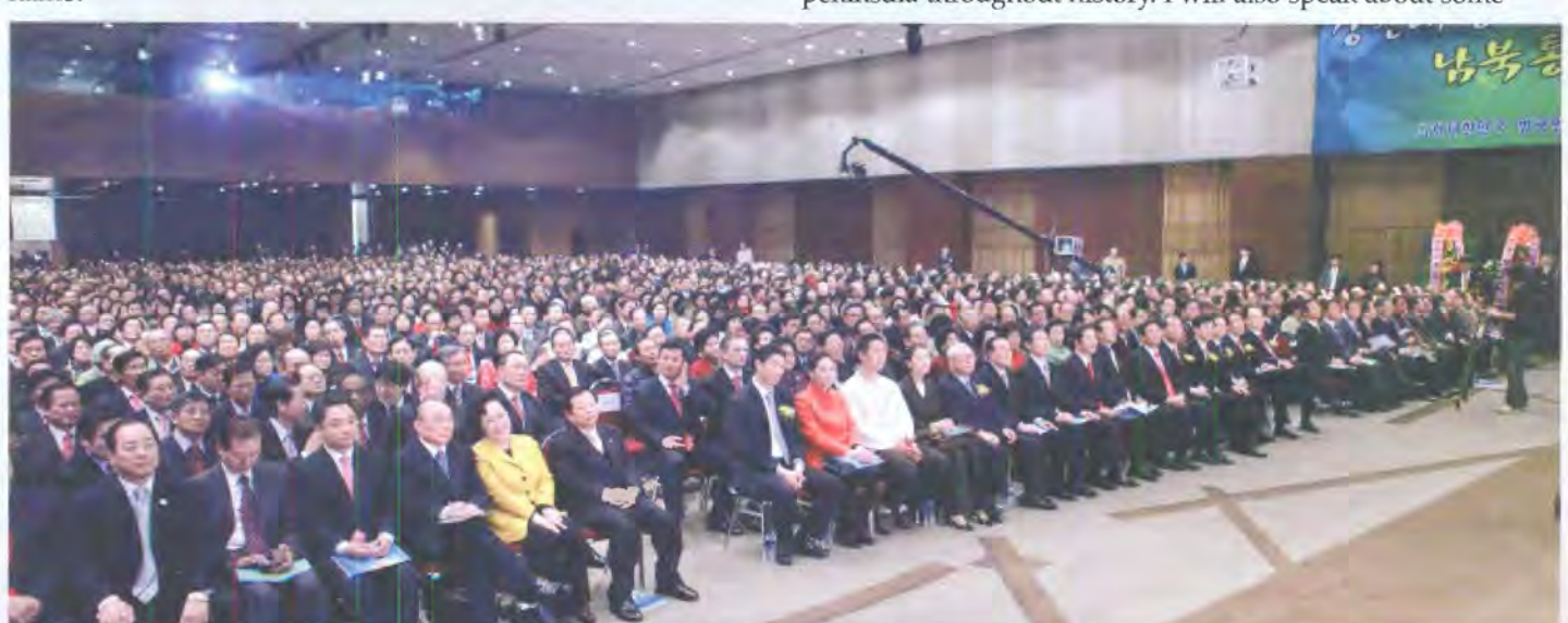
The 63 Building Convention Center hosted a crowd of 2,300 for the launch of the National Campaign for a Strong Korea.

Ladies and Gentlemen: I am well aware that this rally today is a launch ceremony paving the way for the Strong Korea movement to actively carry out its campaign throughout Korea. Therefore, on this occasion I will explain something of the profound providential plan God has had for the Korean peninsula throughout history. I will also speak about some