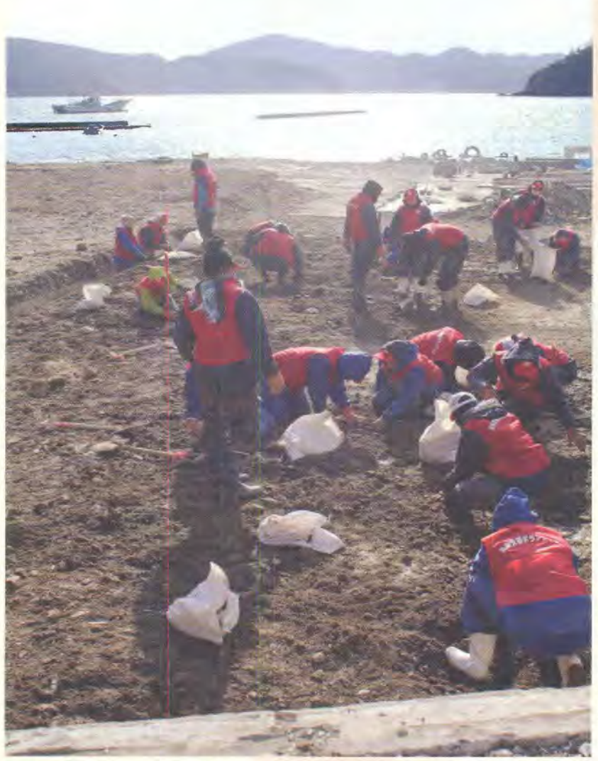
GPA volunteers pick up debris left by the tsunami a year before.

community. It's a great experience, especially for Americans second-generation members to see how privileged they are. They don't realize how fortunate they are until they develop relationships with people in other countries, many of them third-world countries, and actually stay there, working side-by-side with people from the local community. We do this for three weeks, and find out what it is like to not have running water, air conditioning, and other luxuries that we take for granted at home.