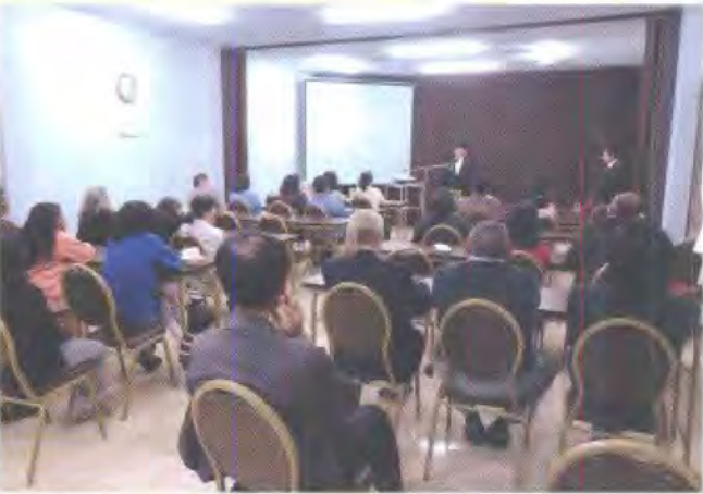
We held meetings for tribal messiahs on the Sunday afternoons, December 3 and January 15, at our headquarters church in Quito. The first part was a joyful lunch together, where members expressed the feeling that if we could gather even a little more power, we could achieve better results. Afterward, members shared testimonies and guidelines about how to teach an outline of the Divine Principle in a short time. We held a two-day Divine Principle seminar on January 15 and 16 for new guests. Twelve guests attended. We will hold a workshop of this type each month.