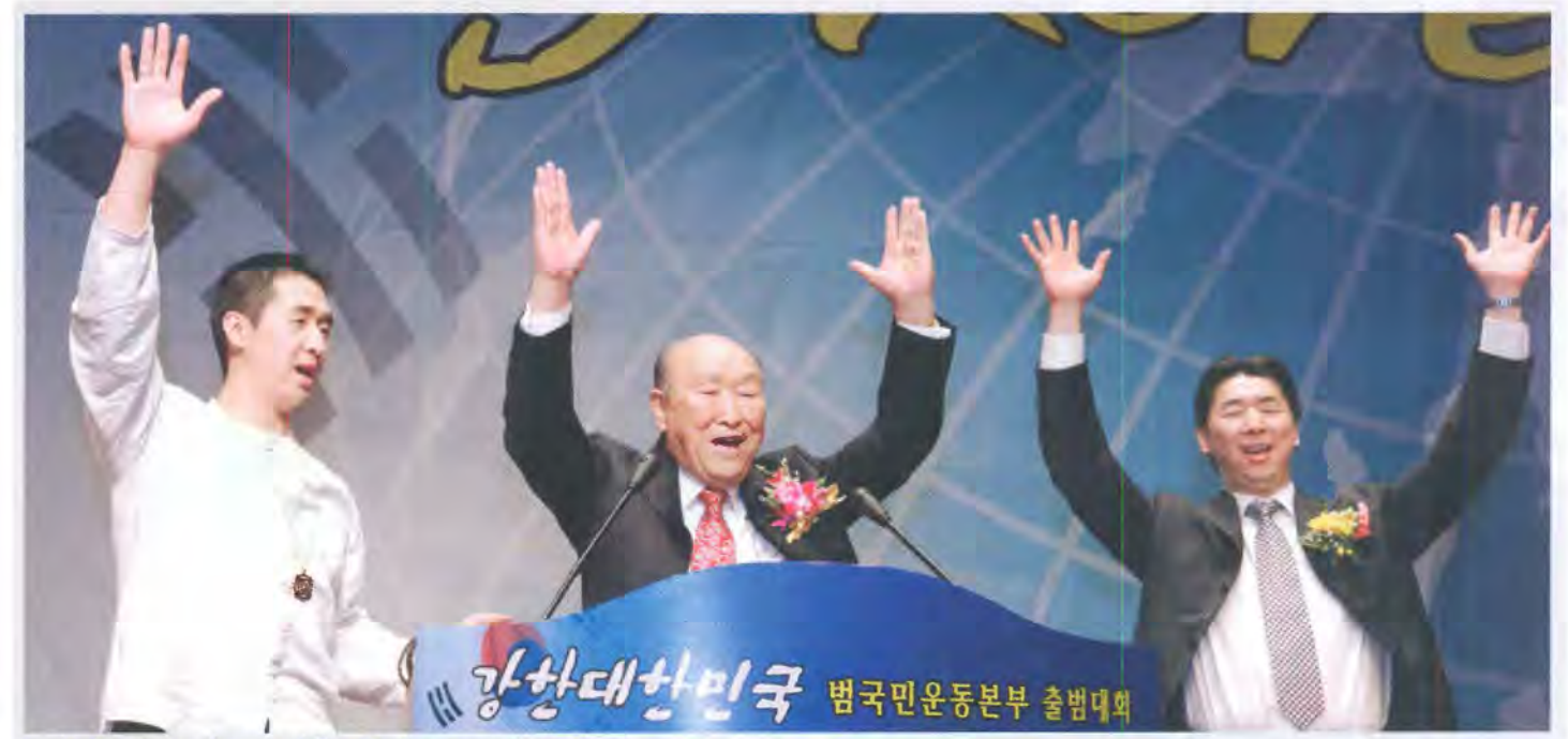
United voices of mansei for God's strong homeland

aspects of God's providence dealing with the Pacific Rim Era that I have announced.