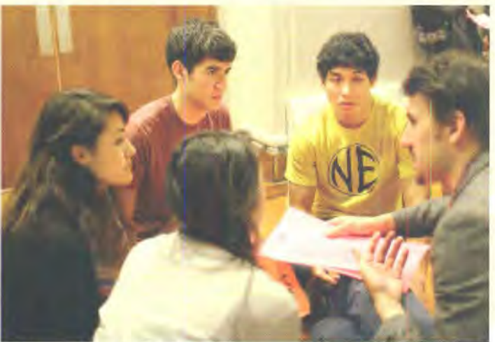
GPA members discussing "love languages" at the Lovin' Life youth group, Junction, as part of their Leadership Module