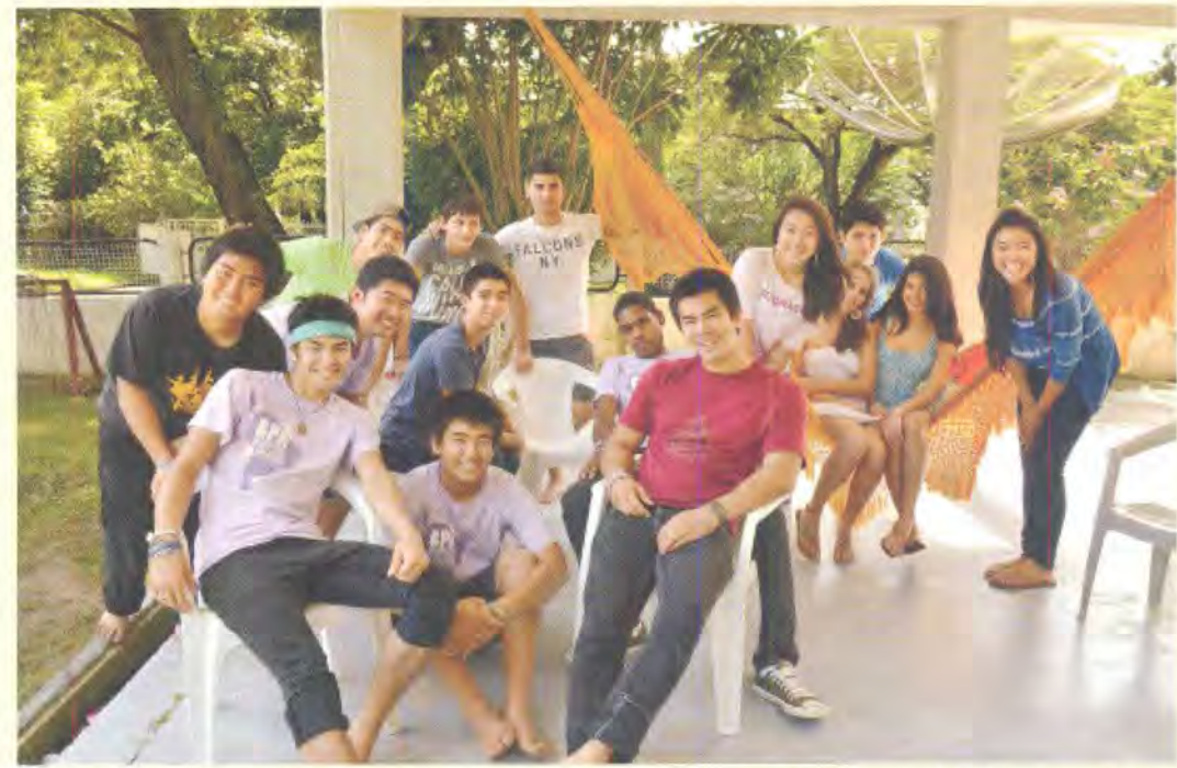
GPA members participating in an international service module in Guyana take a moment to send smiles around the world.

Second-generation members have an incredible spirit. I was a mobile fund-raising team (MFT) captain, and had the opportunity to guide many teams of firstgeneration members. We had members from Russia, the Philippines and Mongolia, but the very year we began with second-generation members, it was completely different. The bond they have between them is amazing. First-generation members are following their own course of restoration, and it's a little more individualistic, even competitive. The care and bonding among those in the second generation, on the other hand, is just amazing; it's beautiful to see.