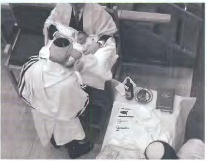
Generally performed on the eighth day after birth, circumcision, for Jews, is a religious rite.

Circumcision<sup>9</sup> was never a custom in Korea in times past, but it became a cultural norm beginning around the 1950s with the influx of United States' military personnel and American Christian missionaries, who brought their own moral interpretations regarding the practice.<sup>10</sup> As time passed, although the practice of circumcision has diminished drastically in the United States