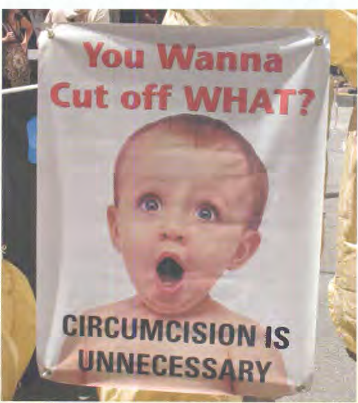
An anti-circumcision protest march in San Francisco, California

After a long, hellish, serpentine route that had been the indemnity history of immeasurable loss and suffering, we are finally on the threshold of the settlement era of Cheon II Guk, where the promise and the healing embrace of our Heavenly Parent await us all, to be cherished in joyous gratitude. However, as our Heavenly Parent is the parent of all people, not only should we work to restore ourselves as individuals but we should also work collectively with our siblings, that is all humankind, to grow together and to go arm in arm to the promised land, the kingdom of heaven, Cheon II Guk, at the center of which is the Heavenly Parent's absolute heart, love and truth. As we embark on our road back to healing and peaceful settlement in the heart of our Heavenly Parent, we must necessarily sepa-