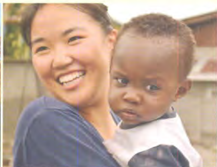
Left: GPA members on a leadership module workshop with the theme "Creating a Life You Love," at the Morning Garden estate in Gloucester, Massachusetts. Right: A GPA member serves in Guyana