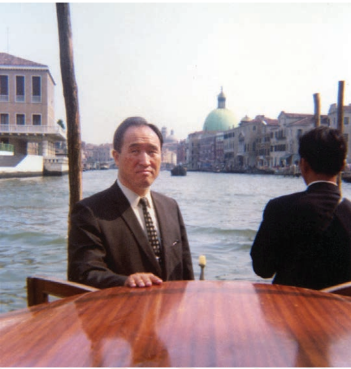
In Venice, Italy; Father created holy grounds in Rome and in the Vatican.

heard that you can get sick if you do that, I didn't get sick at all. You feel better after taking a nap with the fan on.... Would anyone here volunteer to go there?