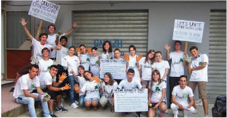
The cleanup project participants ready to go

take place are God's work, not his own. He responds by asking for God's guidance and offering the service to Heaven.