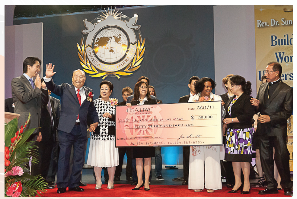
True Parents at the event in Las Vegas on May 21, presenting a $50,000 donation to the Salvation Army

Now, however, True Parents have completed, perfected and concluded their ultimate unity and fulfilled all of their responsibilities and missions on earth. On the foundation of having achieved everything, they have been firmly established with authority and prestige as the King of Kings and the True Parents of Heaven, Earth and Humankind. As the substantial embodiments of God, they are personally governing us and speaking to us. The final and ultimate declaration that can complete their great and noble work and conclude the history of the providence of restoration and establish the Cheon II Guk ideal is the Cosmic Assembly for the Settlement