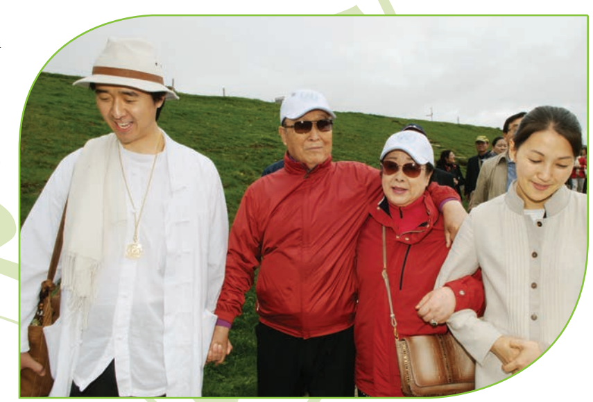
Closely linked in Switzerland during the speaking tour in mid-May

If we truly love True Father, we should surely value and love True Mother, because according to Heaven's providential program, the two are one as the True Parents. True Mother is the mother of heaven and earth; she is also our mother—my mother, who has enabled all of us to be reborn through the Holy Spirit. Since we are all True Mother's children, anything that pains her heart and hurts her would cause even greater pain in our hearts. We must love, value and respect our mother. We should not forget that True Mother is the mother of heaven and earth and at the same time our own mother from whom we were born.