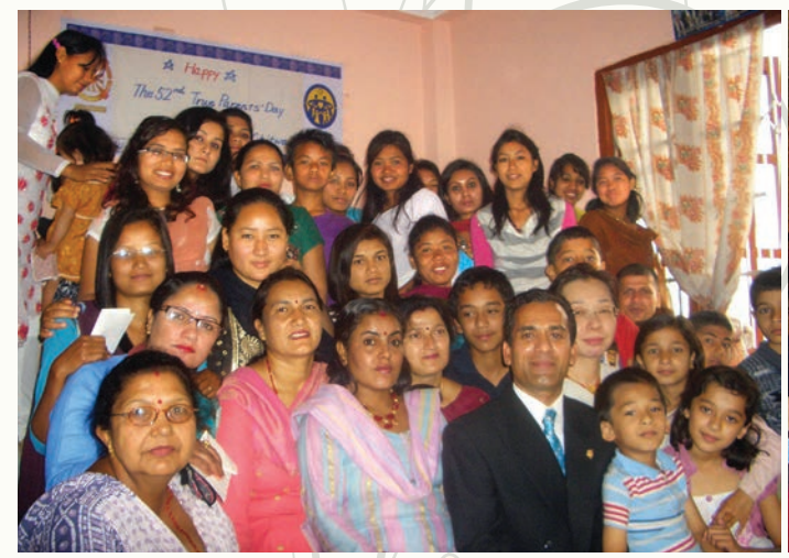
The author, in a suit, at this year's celebration of True Parents Day. His wife is visible just over his left shoulder.

1 For more on this, see "Live National Telecast of Original Divine Principle," in our January 2011 issue.