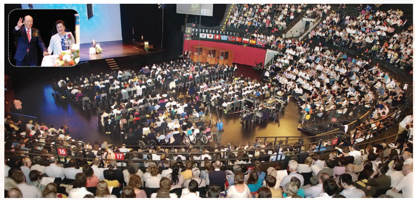
The amphitheater on May 19, when Father spoke; the Little Angels had performed at the same venue the day before.

The biggest challenge for us was to fill the hall, which holds three thousand seats, on two consecutive days. We announced CONTINUED ON PAGE 22