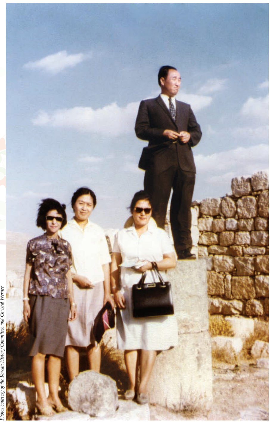
After creating the holy ground on Mount Nebo in Jordan; As did Moses of old, Father is looking toward the biblical land of Canaan. In the 46 years since that day, True Parents have opened the way to the Promised Land for all humankind.

the stone represents the bone. (The rock is also the symbol of Jesus.) They symbolize heaven and earth.