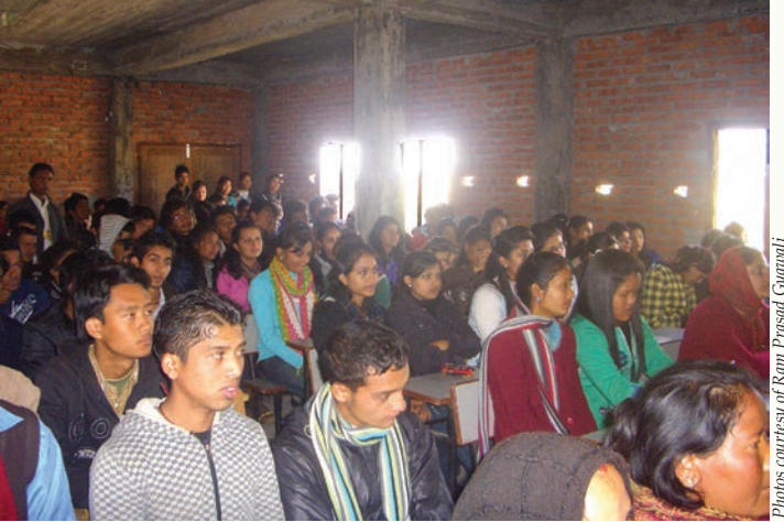
Healthy attendance at workshops in Nepal owes much to the members' hard work and perseverance.