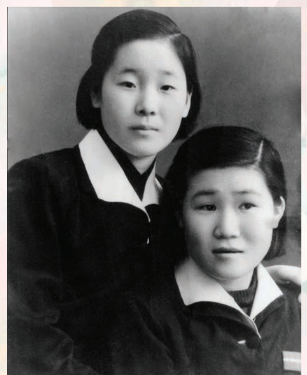
True Mother (top) as a young schoolgirl

even the plainest woman would suit me. That is how I ended up marrying the most wonderful person. [Applause and cheers] Mother says she married me without knowing what was happening to her. She couldn't have avoided it even if she had wanted to; it was almost as if she had been bewitched by something.