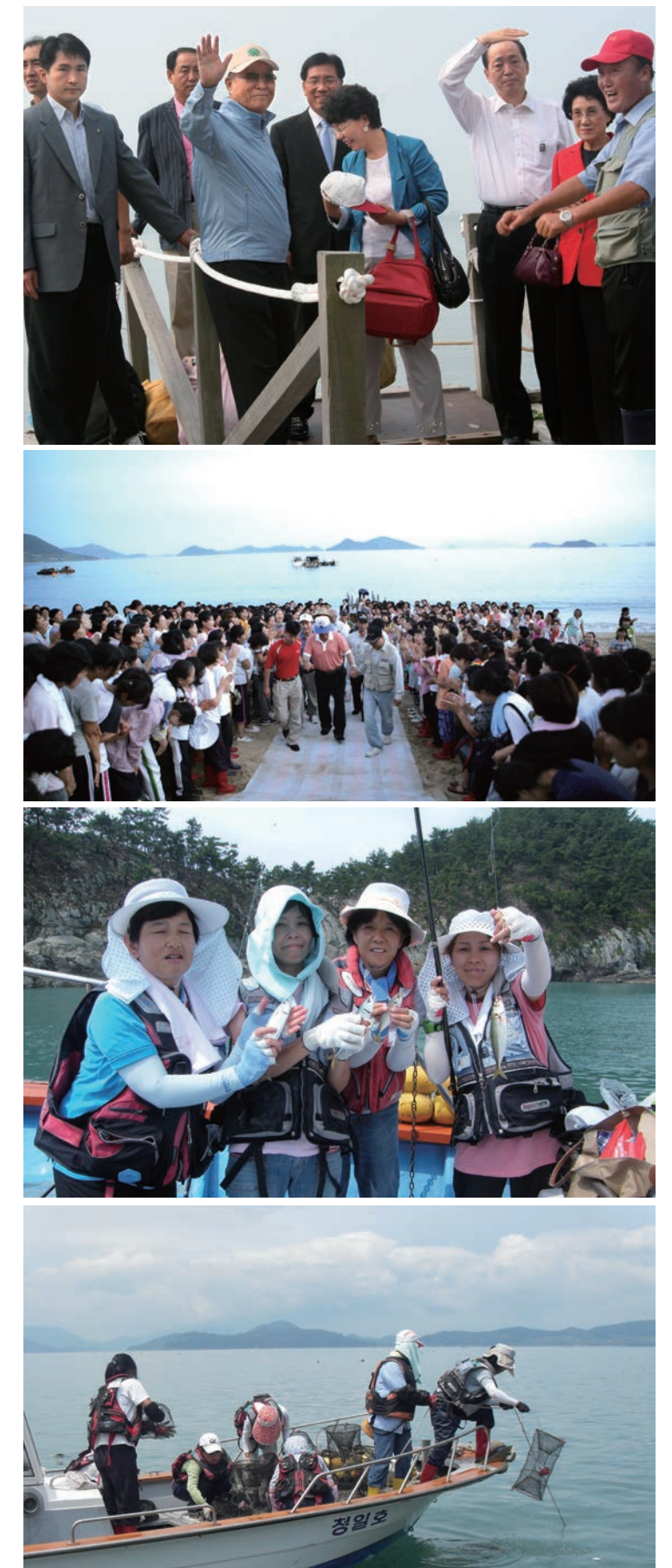
In Yeosu, Father continues to set serious conditions through fishing (top and facing page), and thousands of Japanese sisters have come for special ocean-related workshops.