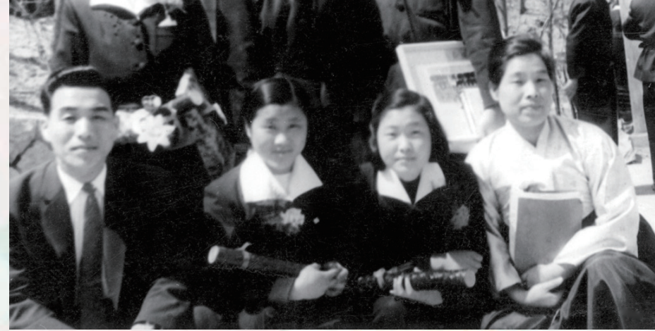
Mother (center, standing) with her teachers and a group of fellow students on graduation day at Seonjeong Middle School in Seoul, early in 1959

When you see her, you see that Mother is quite a decorous woman. When she is sitting quietly and docilely, she exudes an internal character that calls for respect more than that accorded anyone else. She has a gentle character. After she met me, she was trained to observe her surroundings carefully, which is why