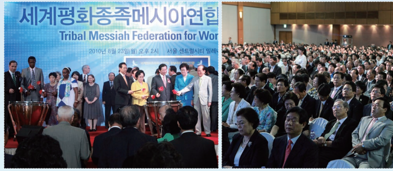
Left: Foreign members denoting world regions join Korean leaders onstage in heralding the inauguration of the Tribal Messiah Federation for World Peace; Right: Members of the federation come from both the "Abel" and "Cain" realms.

This brief appraisal was prepared by the Today's World staff.