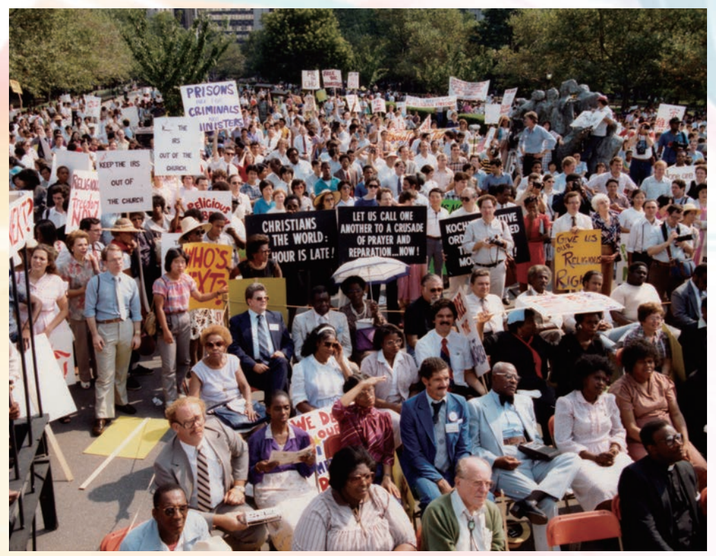
Mainstream Christians, who saw in Father's unjust prosecution a broader threat to the free exercise of religion in America, joined forces with our members in protests such as this.