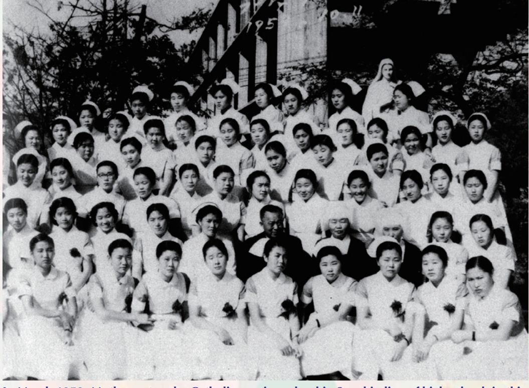
In March 1959, Mother entered a Catholic nursing school in Seoul in lieu of high school; in this picture, she is sitting in the front row, fourth from the left.

Am I not twenty-three years older than Mother? I am old enough to be her father. Who on earth marries a woman young