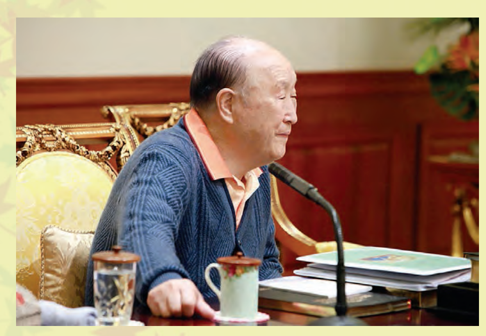
These excerpts are from True Father's remarks during hoondokhae on October 29, 2009, at the Cheon Jeong Peace Palace