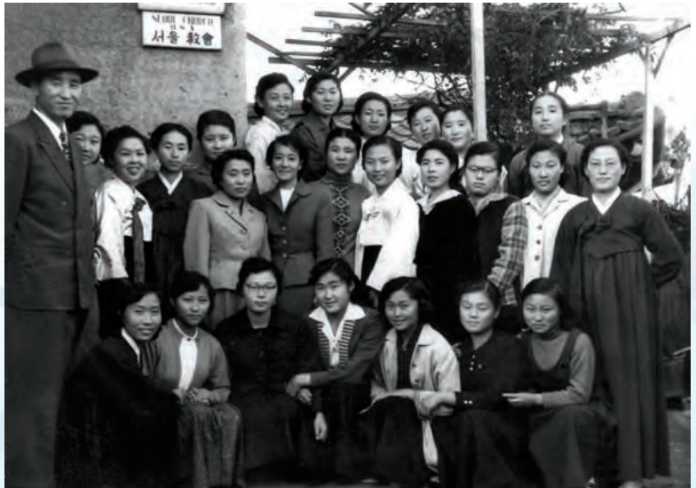
Father in front of the church with some of the professors who resigned and students who had been dismissed from Ewha University

would also have ended up being led by me. There was a big fuss. So the expulsions went ahead.