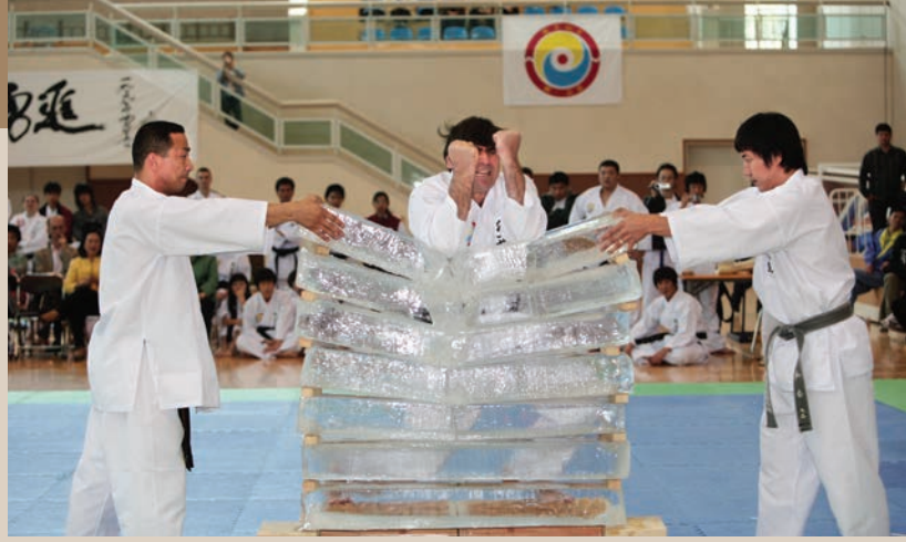
In front of True Parents, the author smashed all seven layers

Since 2001, we have been continuously expanding a renewed Tongil Moodo. I am responsible for South America and the Caribbean. Our international instructors have been