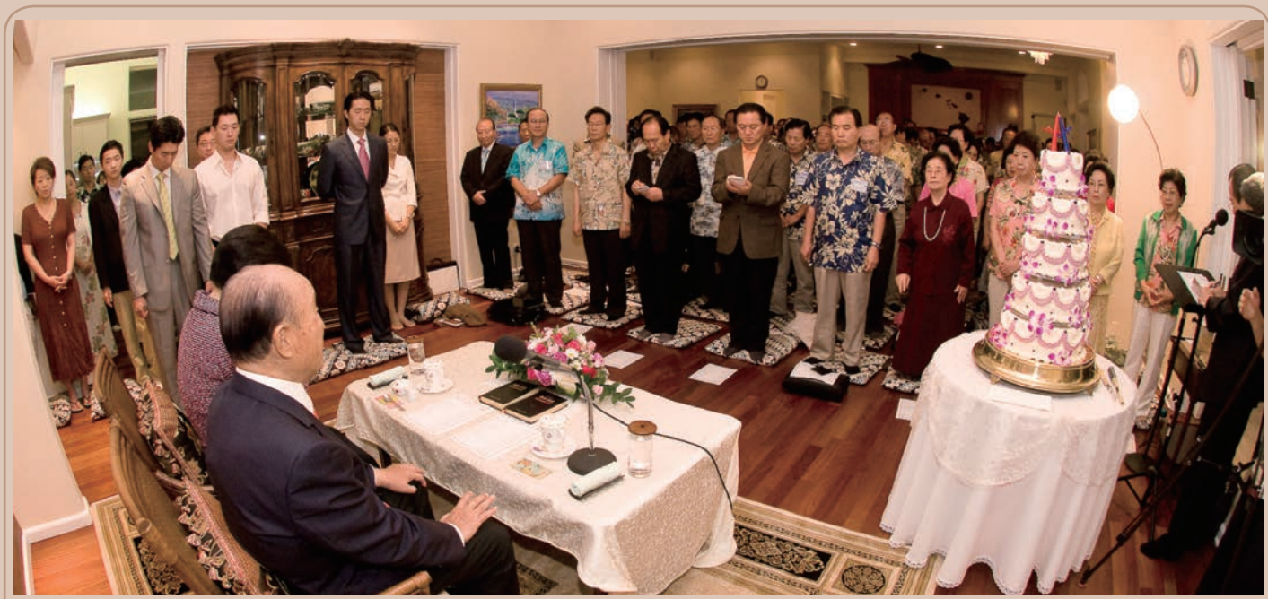
True Family members stood, as did the congregation, throughout Father's speech in Hawaii King Garden.

understand? This is a time of transition.