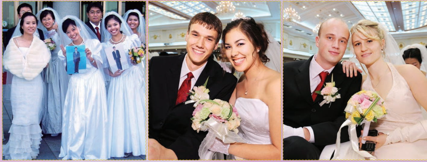
Some spouses were unable to attend, but radiant joy may well have reached them; for everyone there, memories of the Marriage Blessing for the Godly Civilization under the Sacred Reign of Peace will linger in their memory forever.

Praying that the eternal blessing of God will, in future days, be with the brides and grooms beginning their lives anew on this day, I conclude my Blessing Ceremony remarks. Thank you. TW