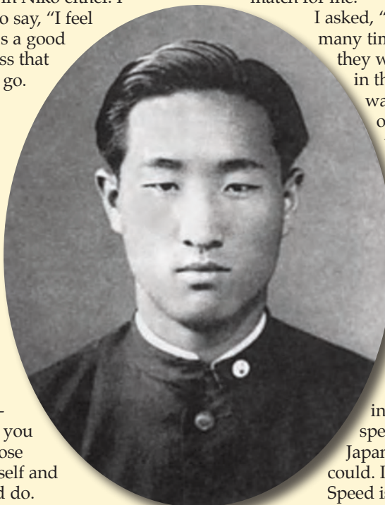
Father as a student in Japan

I was the champion wrestler in high school. I was good at running and jumping. I even boxed. I could hit a bad person—Pow!—and he would go flying. Why did I do this? It was not in order to fight. In order to realize a great revolution, in order to put this world back on the right path according to heavenly law, in order to make a peaceful world, I needed a strong, healthy body.