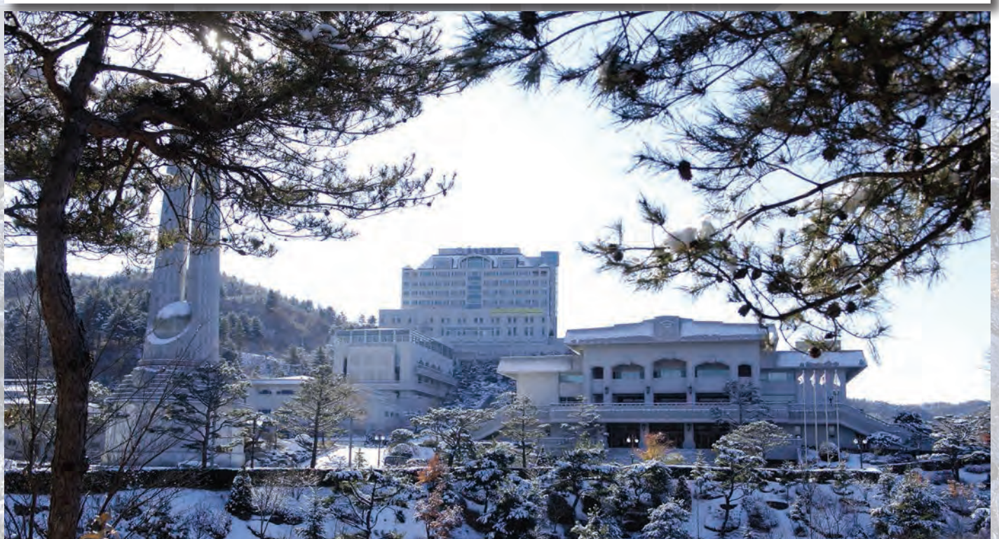
The Cheongpyeong Heaven and Earth Training Center with Cheongshim Tower in the left foreground, the main hall on the right, minor halls on the left and Cheongshim Hospital in the background

2 Father coined this phrase to mean the achievement of spiritual uprightness such that your life casts no shadow.