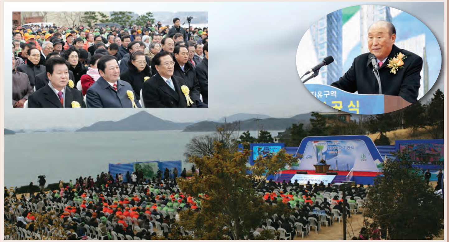
Father spoke at the January 29 Groundbreaking Ceremony for the Hwayang Free Economic Zone (FEZ); Korea is developing FEZ to increase both manufacturing and trade. The Hwayang FEZ in Gwangyang Bay is being developed as a global marine leisure complex and was a key component in nearby Yeosu's successful bid to host Expo 2012.

work on furthering my understanding of the Principle. Yet, in the early days we failed to link the ideals expounded in the Principle with the blessing ideal. In the beginning, we did not think Father would bless thirty-six couples. The first thing we expected Father to do was select his twelve disciples. I personally did not even dream I would be included; I'd gone there thinking it would be interesting to watch my elder brothers being matched but I ended up receiving that grace myself.