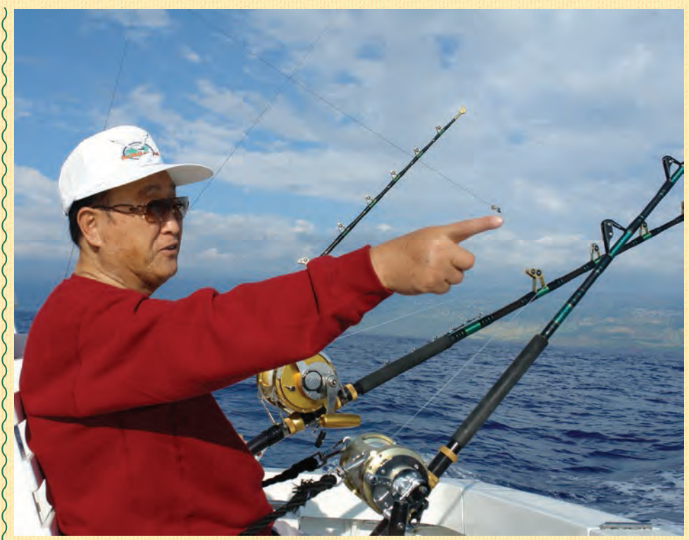
At 88 years of age, Father still regularly goes to sea

ents' Day? True Husbands' Day? True Wives' Day? True Married Couples' Day? Unification Church blessed families know about those. People who have not received the blessing would not know, but people who received the blessing know those things.