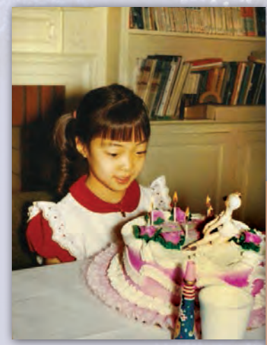
Above: Six years old, with a ballerina on her birthday cake; right: As a member of the Little Angels, around age 10

I started lessons, with my younger sister, at McLean School of Arts. It was in one of those old, little wooden churches where the pews were taken out to make a dance studio. The fact that my first ballet school was in a church is quite meaningful because through all the difficult moments in my dance career it was my faith that sustained me.