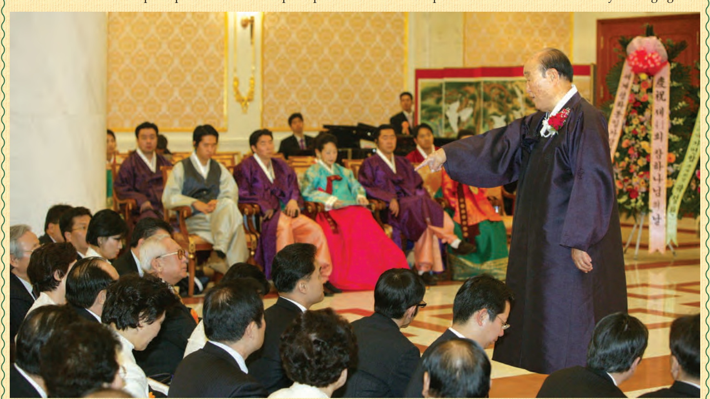
True Children, ambassadors for peace (seated on the floor) and members start the new year off by listening to Father's speech.

True Parents by themselves are all that's needed, so why are there so many other terms attached? What's the relationship between the True Parent and the Savior, or Messiah? Jesus died two thousand years ago, so what connection do I have with him that I am called the returning Lord? He is the Lord who had to accomplish what he had set out to do by coming again.