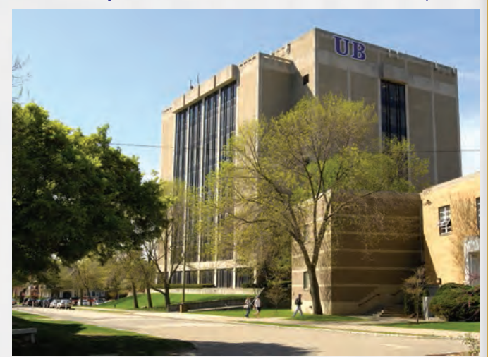
The Magnus Wahlstrom Library; its book collection comprises more than 270,000 titles.