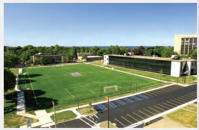
The UB campus is 60 miles northeast of New York City.

I am a proud 2006 graduate of the University of Bridgeport's International Political Economy and Diplomacy program and an active member of the Unificationist community. I am especially grateful for the university's personal approach to my studies, as well as the numerous leadership opportunities presented to me. I am currently working for the university in the public relations office and plan to study on the graduate level in the near future.