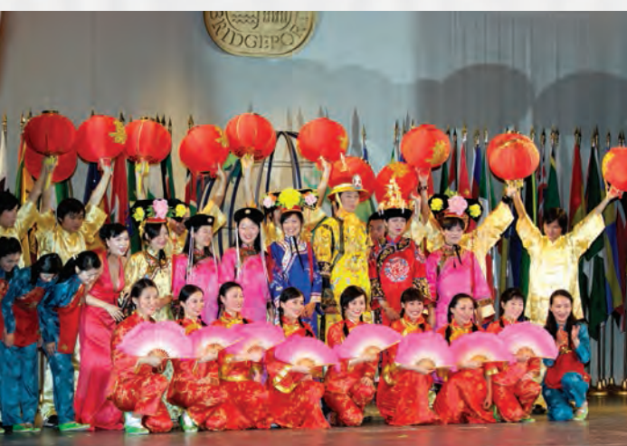
Right: Happy University of Bridgeport graduates Left: The April 15<sup>th</sup> International Festival featured 14 performances and 26 food booths