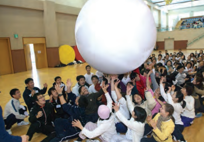
On January 13, participants of the 121st forty-day Cheongpyeong workshop enjoyed a sports day at the Youth Center.