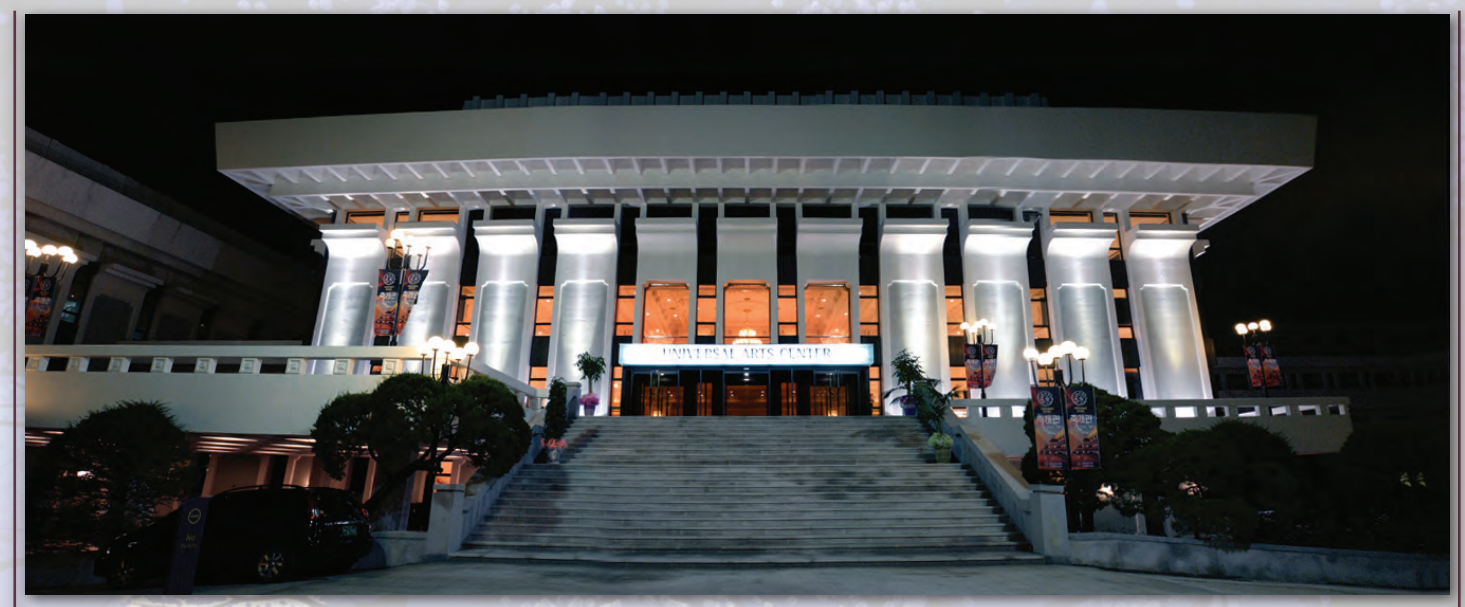
Universal Arts Center was built as The Little Angels Performing Arts Center in 1982 and renamed after renovations in 2007

create a trilogy of Korean ballets that express values that True Parents uphold and teach. Shim Chung expresses filial piety, the story of Chunhyang is about chastity, loyalty and true love; and Heungbu–Nolbu is about brotherly love.