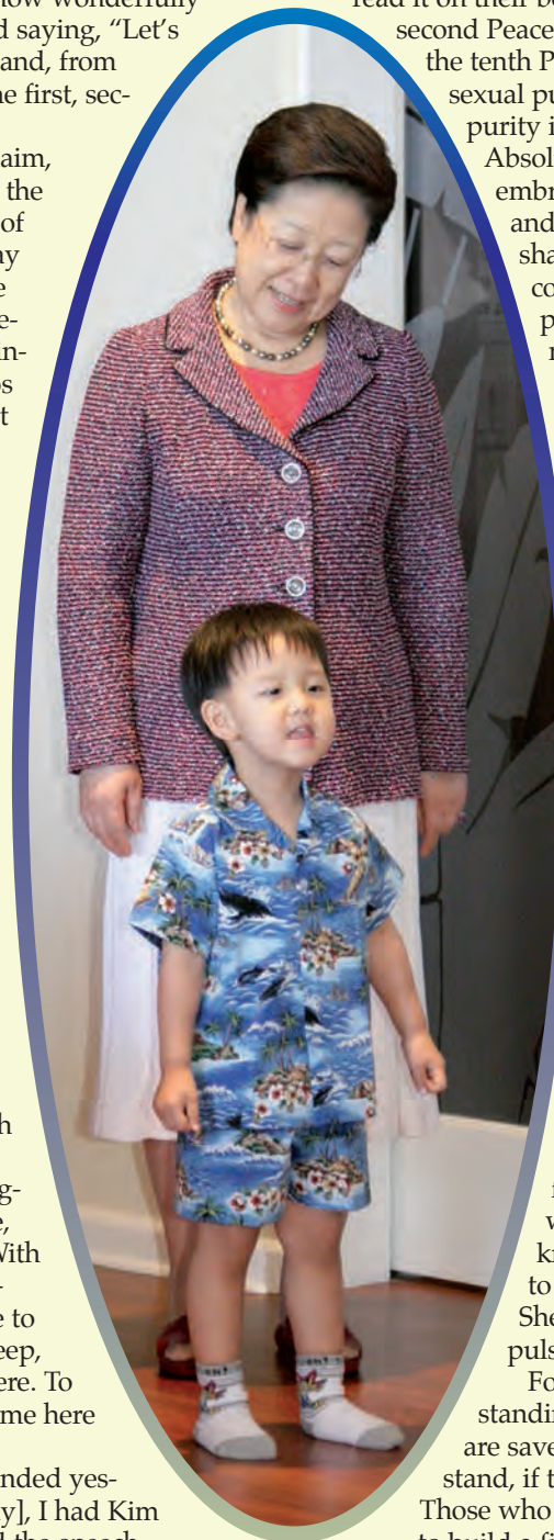
Shin-joon nim sings at Hawaii King Garden, during hoondokhwae on March 17

Therefore, it is Mother's task; so yesterday Hyo-