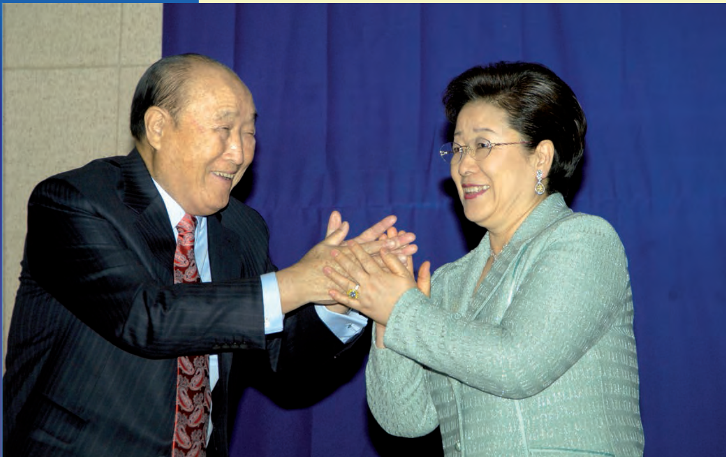
Father gave the following speech at the opening of the Cheon Il Guk Leaders Assembly (photo: True Parents during the speech)