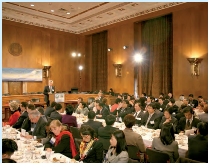
A banquet speech at the International Leadership Conference

The ILC, through its series of conferences, leadership consultations and issues development, functions as a think tank