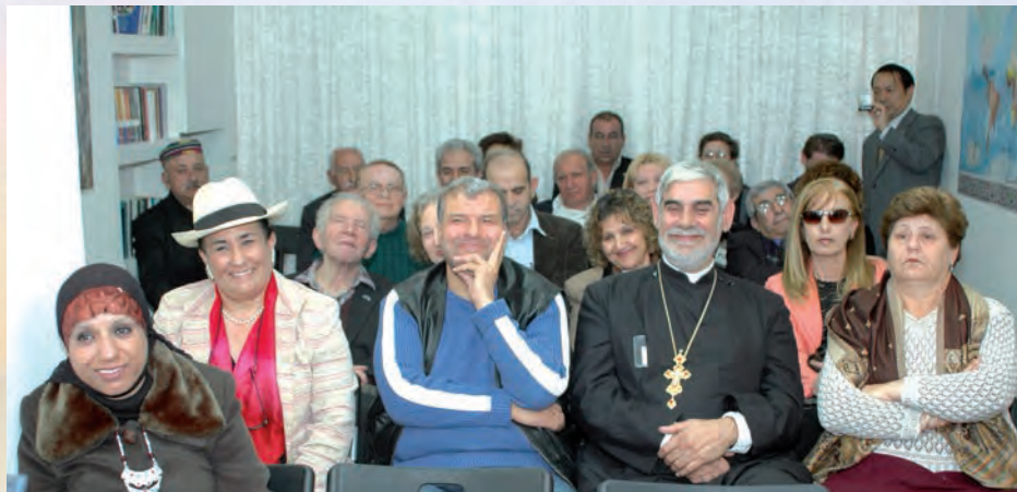
An array of Ambassadors for Peace and guests contributed to the graceful opening of the Peace Embassy in Jerusalem.

The facility thus has several functions. The offices include one for the Women's Federation. We have received requests from other NGOs (not affiliated with our movement) that want to