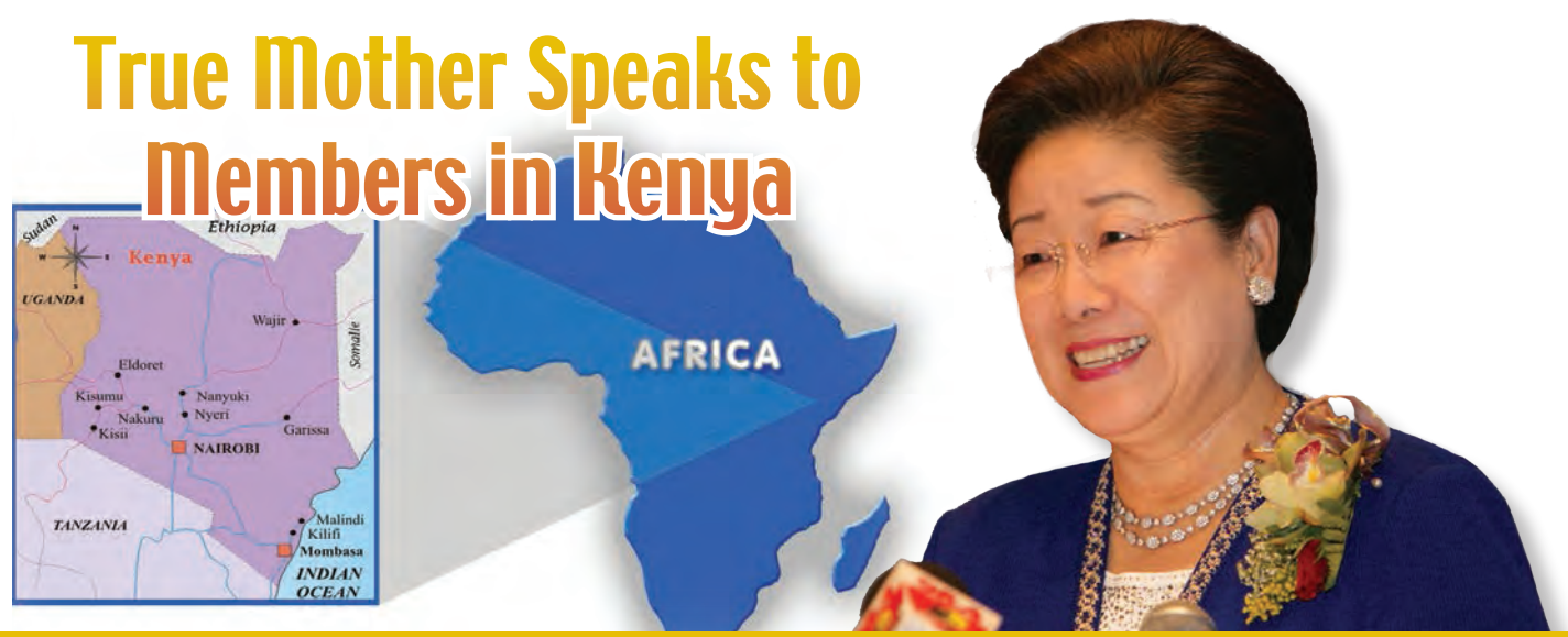
Mother's Message to Members in Nairobi, Kenya, at Hoondokhwae on July 19

ave you all been fulfilling your mission as tribal messiahs? You should not lose this tremendous opportunity for blessing from Heaven. If even one person in your tribe is unable to hear the message during this time in Africa, it will be difficult for you in the spirit world.