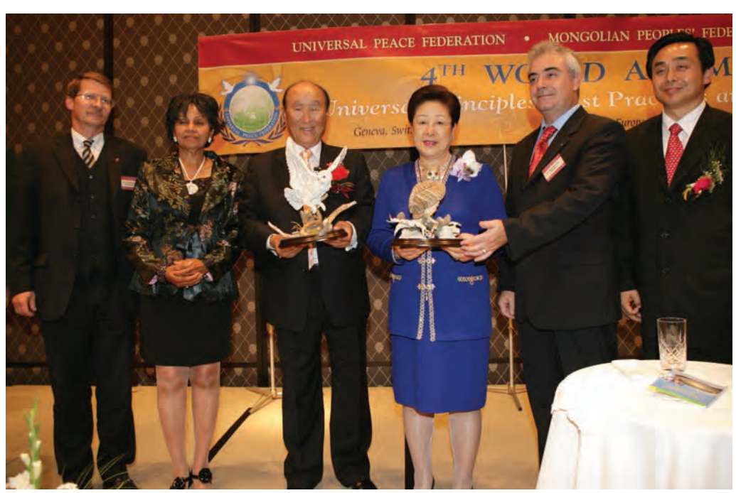
True Parents received gifts at the conclusion of the fourth World Assembly of the Mongolian Peoples' Federation for World Peace, in Geneva, Switzerland, on July 14

Once people give birth to their first son or daughter, the eldest son or eldest daughter, they will receive their parents' love and