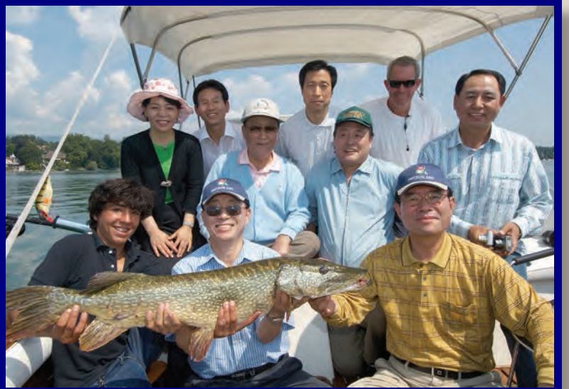
Local fishermen suggested it wasn't a good day to go out, but Father's boat caught fish of a size rarely taken from Lake Geneva

At the next morning hoondokhwae, True Father "anointed" one representative from each of the twenty-six cantons in Switzerland to work with peace ambassadors and build up the foundation in their area. During hoondokhwae the following morning in the high mountains of the Alps, True Parents announced the opening of a new providence, identifying twelve continents and opening the age for the world to become twelve tribes, which we would join by lottery. Switzerland and adjoining nations, as well as Canada would become the two new continents to reach twelve. Rev. Pak Joonghyun, Korean national messiah of Switzerland will become the new continental (regional territory) director for this new Central European continent. With so much more that could be said, True Parents could spend their final day in Switzerland in what we all hoped they would feel was a "honeymoon" (albeit brief and not very private) in the mountains near the Matterhorn.