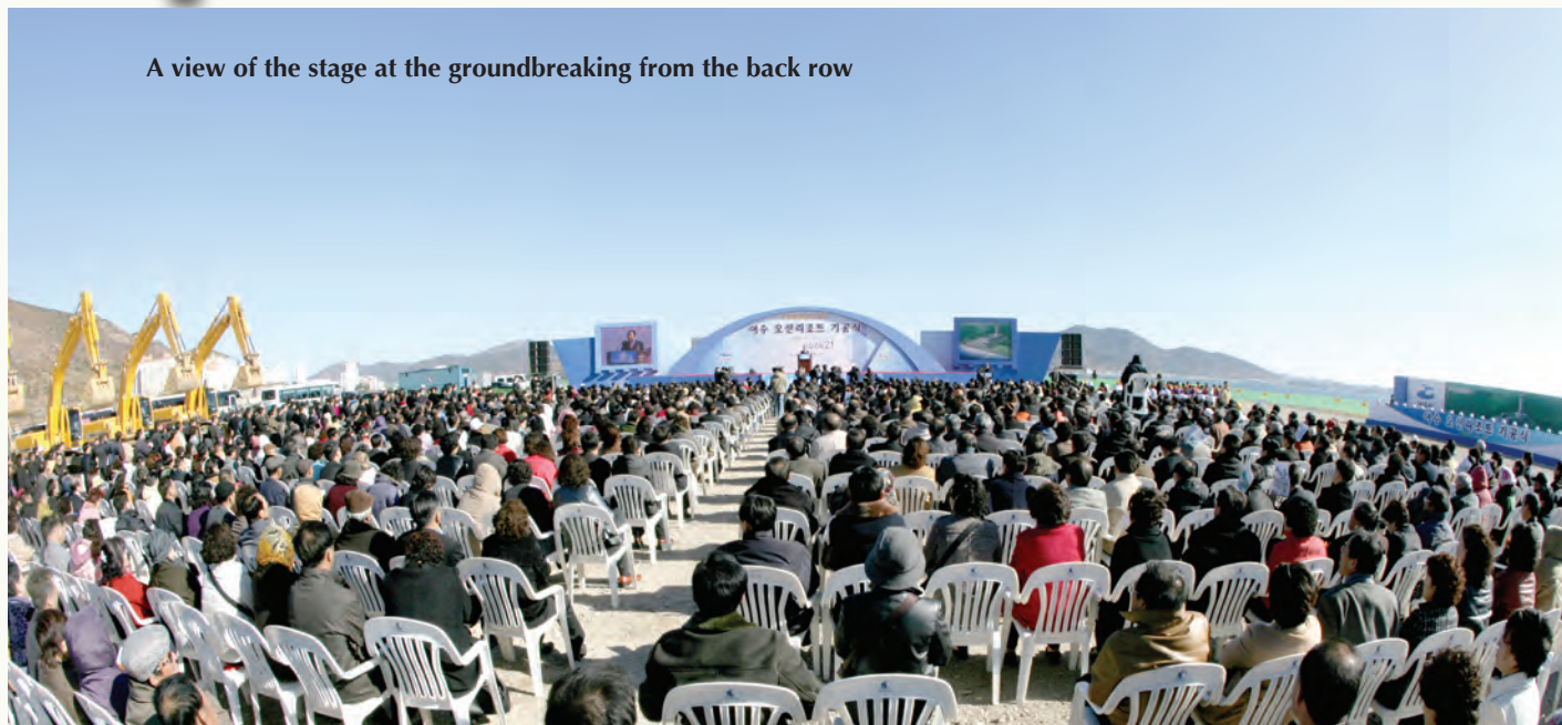
A view of the stage at the groundbreaking from the back row

The ceremony proceeded as scheduled. Prior to the main ceremony, we held a reception that lasted half an hour, for it was, after all, a groundbreaking ceremony. This event was very well prepared, with the idea that the guests would be welcoming True Parents. The cost was split fifty-fifty between us and the city authorities. When participants, including the main officials, came in and found me at the event, they asked me, "Where is President Moon?" It was something like a greeting, putting me at a loss as to how to reply, as Father's coming had already been advertised widely. But the mayor of Yeosu answered on my behalf to such inquisitive greetings, saying "Sun Myung Moon is still in the middle of his speaking tour to countries all over the world; he is unable to make it here today."