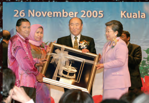
November 26: In Kuala Lumpur, Malaysia, there was gratifying response from the Muslim majority