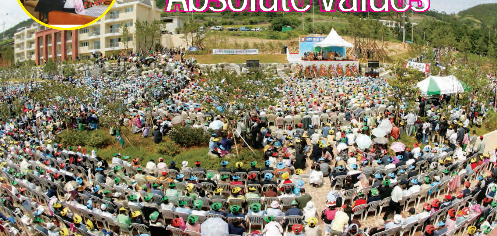
Rally for the Declaration of Absolute Values for the Sake of Harmony and Unification, May 21, 2004, at Blue Sea Garden

On the third Ahn Shi Il, May 21, 2004, True Parents gathered members from all over Korea at Blue Sea Garden residence near Yeosu for a special speech and declaration (see previous issue page 14). This is the prepared speech Father delivered on that occasion.