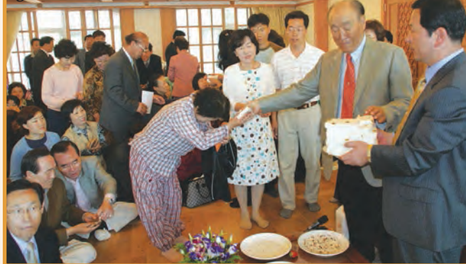
Following the declaration, Father gives gifts to members