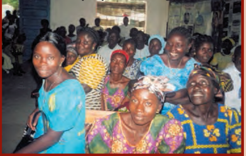
An event for people from August...

They built a tent, put up a tarpaulin. But this time it was very strange; the mortar shells landed in that place and killed people. People were really disillusioned. Every time a shell was dropped and a person died, they just carried the dead bodies in front of the U.S. embassy and piled them up. This was shown on CNN and through other media, so it was embarrassing for the international community and the U.S. government in particular. They saw that and they came in. The U.S. ambassador talked to the rebels and told them to stop and then to retreat. He asked them to retreat beyond the Po River, which is about fifteen miles from Monrovia, and from there they could begin negotiating.