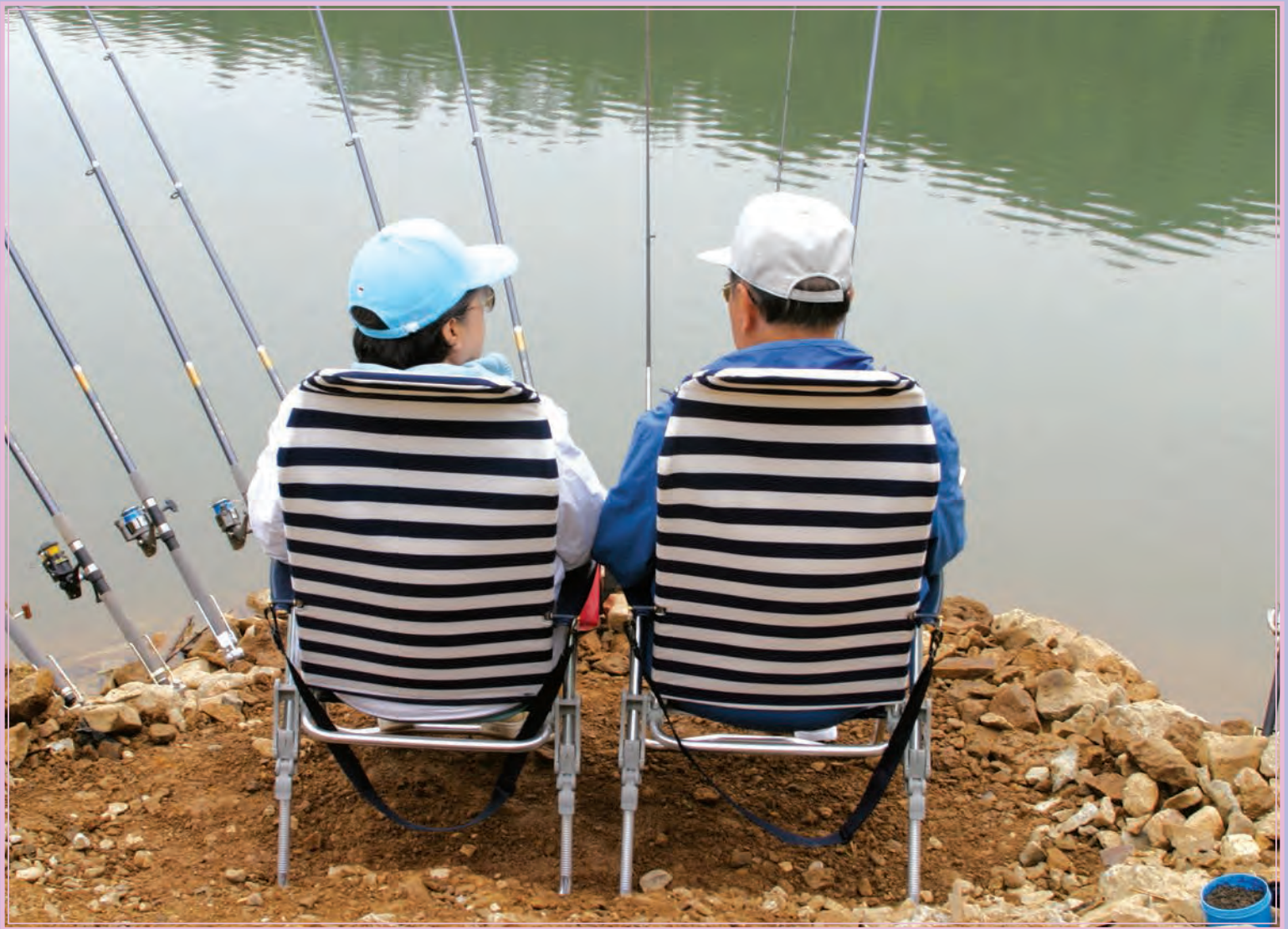
Father and Mother fishing near Yeosu, May 19, 2004

No matter how strong the desires of the body, if you can willfully place greater force behind your conscience in accordance with the teachings of the Principle, your body will end up following your mind. If you cannot, you must strike your body through fasts and self-denial. If clear water continues to flow into a muddy pond, someday that pond will be clear again. You must not let your mind grieve anymore. Disobeying the call of your conscience and bringing sorrow to your heart will result in bringing sorrow to not only your parents but also your teacher and even God.