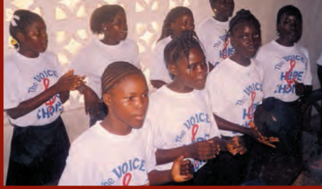
A choir of students from the school sing at a blessing ceremony