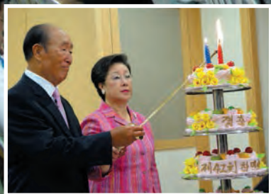
A celebration of the Creation