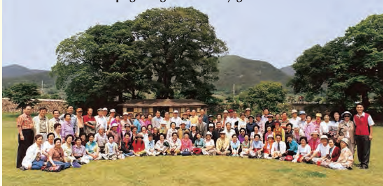
In commemoration of the 50th anniversary, a group of senior members went on a pilgrimage of the holy grounds

the Completed Testament era by True Parents. After passing through the three eras—the formation level Old Testament era, growth level New Testament era and perfection level Completed Testament era—the world under God's sovereignty, the era of Cheon Il Guk, began. This was in 2001. And on the occasion of True Parents' Day on April 19 this year, the fourth year of Cheon Il Guk, True Parents designated the Holy Scripture of Heaven the