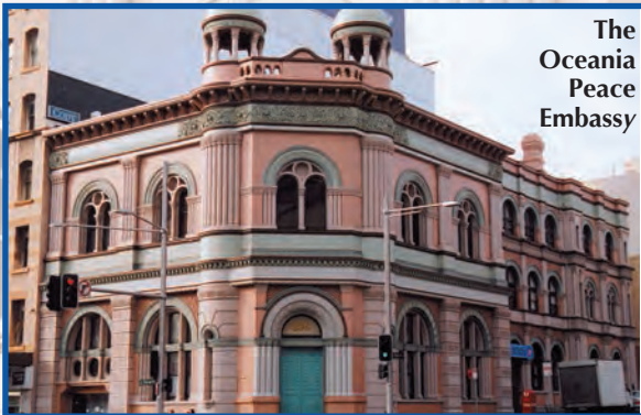
The Oceania Peace Embassy