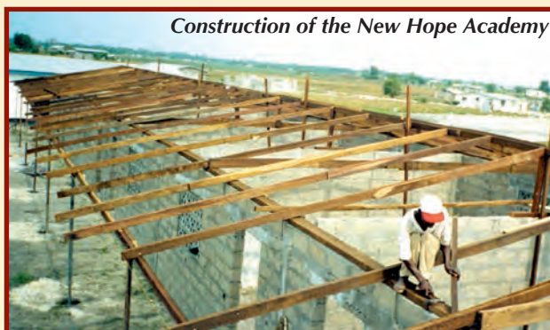
Construction of the New Hope Academy

...the arrival of these missionaries while others were fleeing from the country came to be clearly understood as a divine gesture and sacrifice for the Liberian people. People naturally started to come to us, as it became known that we were a genuine friend of the president.