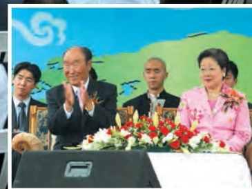
The True Family sitting together

to shed tears of sorrow. Thus, children without parents are called orphans, and orphans are treated with pity.