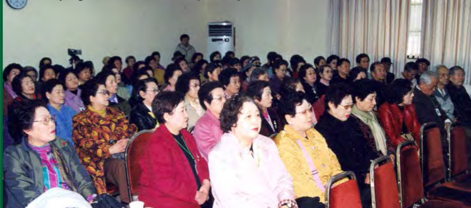
A class in progress at the True Family Principle School

I told them to eat with their guests, and if their guests are ever absent, to call them and ask them why they couldn't