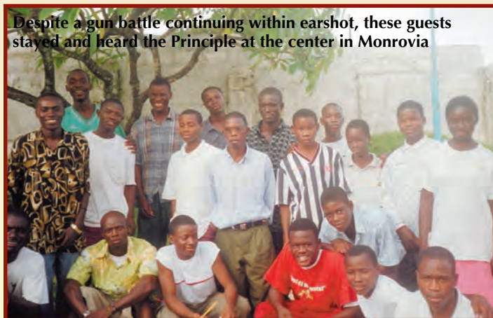
Despite a gun battle continuing within earshot, these guests stayed and heard the Principle at the center in Monrovia