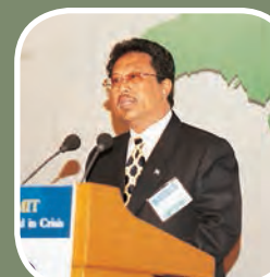
Tommy E. Remengesau President, Palau