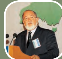
James Mancham Founding President Seychelles