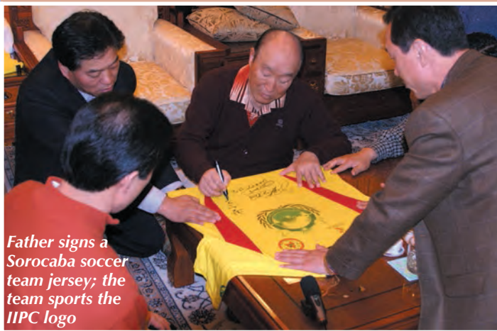
Father signs a Sorocaba soccer team jersey; the team sports the IIPC logo

You can become citizens of the kingdom of heaven only when you become representative sons and daughters of God, in the position of the Cosmic Parent, the Parents of Heaven and Earth and the Parents of Heaven, Earth and Humankind, because only then can God come to you personally and discuss things with you. If there are many people in the royal family, if there are many brothers and sisters in the family, once the central sibling inherits the kingship, the others can form a protec-