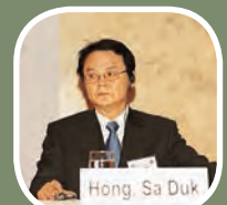
Hong Sa-duk Congressman Rep. of Korea