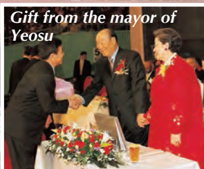
Gift from the mayor of Yeosu