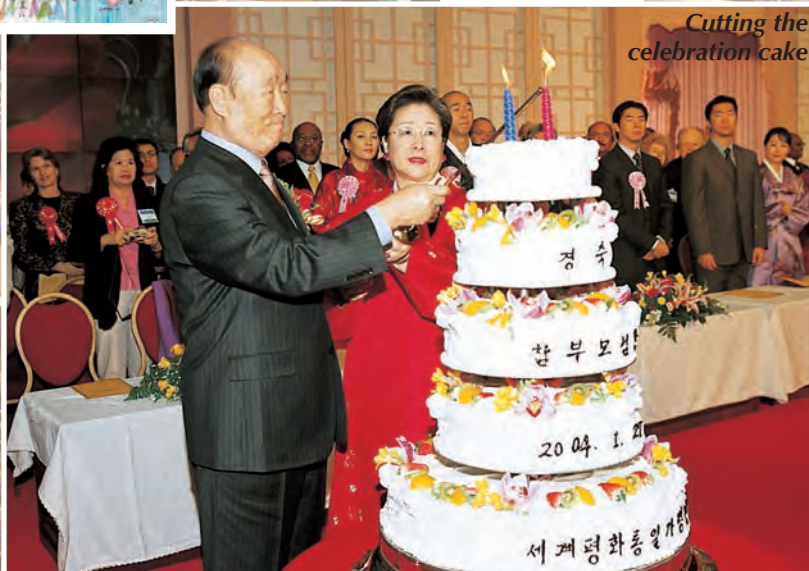
Cutting the celebration cake

True Parents' Birthday was celebrated at the Jamshil Indoor Stadium in Seoul on January 27, 2004 in the presence of dignitaries from Korea and overseas, together with thousands of members. Amongst the presentations made were a congratulatory message from the President of Korea and an award for peace conferred by the President of the Philippines (photo).