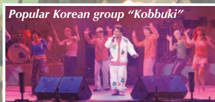
Popular Korean group "Kobbuki"