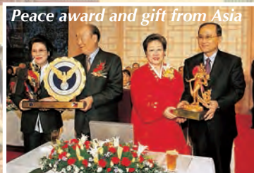
Peace award and gift from Asia