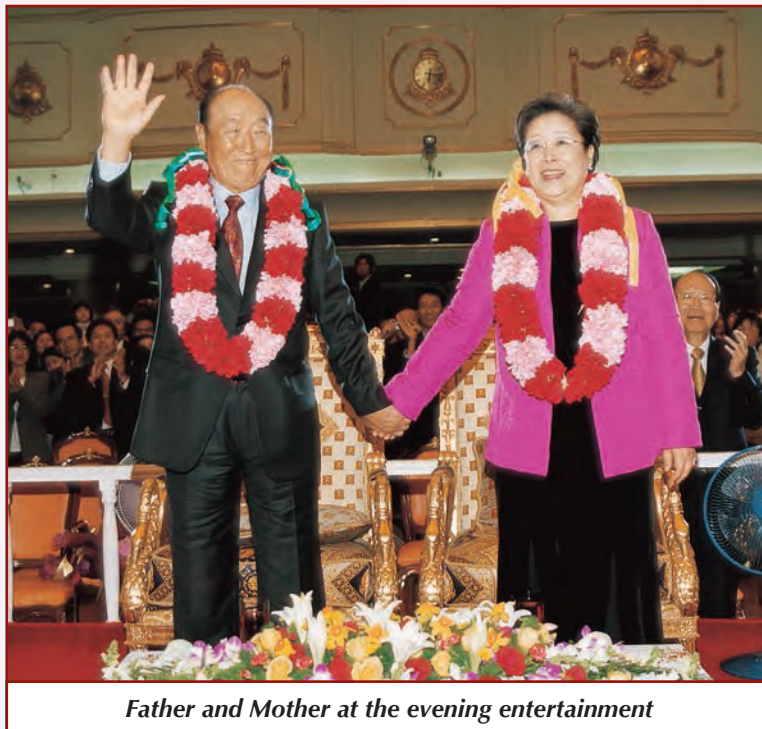
Father and Mother at the evening entertainment

You have received the blessing a second time, haven't you? What was the name of the blessing? It was the Transition of the Three Ages Four-Position Foundation Registration Unification Blessing. It is the era of the family. In other words, it blessed not only the couple but the whole family. After that comes the preparations for the complete settlement of the heavenly nation, so that we secure enough evidence in regard to God's fatherland that it cannot be