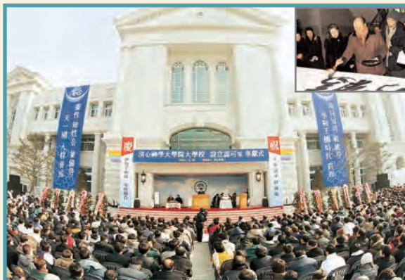
True Parents open the Cheongshim Graduate School of Theology at Cheong Pyeong January 28

A retired director of the Korea Broadcasting System (KBS)