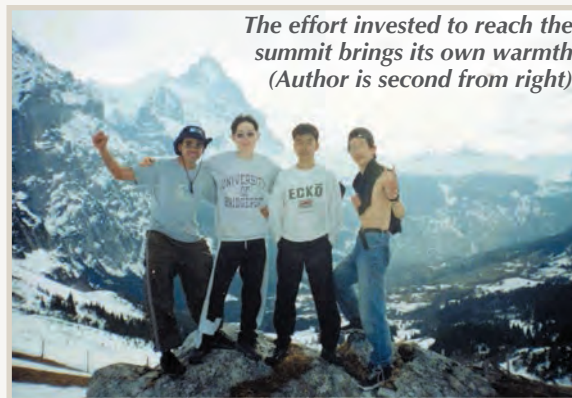
The effort invested to reach the summit brings its own warmth (Author is second from right)