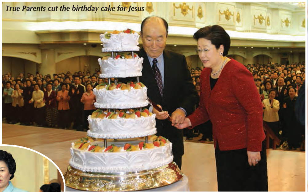
True Parents cut the birthday cake for Jesus

Jesus truly feels grateful for True Parents' letting people know when his real birthday is. Through the work in Cheong Pyeong, notably