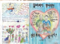
Cards sent to True Parents by their grandchildren