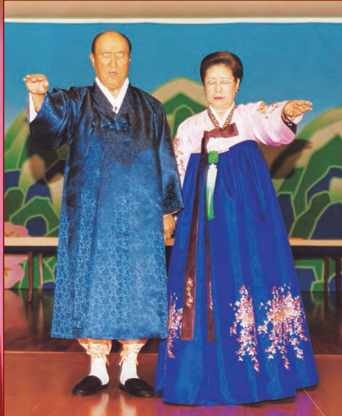
True Parents pray at midnight

Alone, You had first created all things with Your love, based on Your true love. Starting from the microscopic organisms in the mineral kingdom, You created as the direct object of Your love the plant kingdom, the animal kingdom, culminating with the world of humankind. The direct object of Your love became the substantial forms of Adam and Eve, and as You stood in the position of the center of the physical world and the spirit world, You waited with impatience for the day of the blessing of Your children. However, you lost that moment of bringing in the liberation of God's Day on top of the ideal of creation. You were in the position of guiding and educating humanity throughout the numerous paths of historical tribulations. But instead, Satan stands in front of humanity, guiding them, and You stand behind. Looking back on that moment of anguish