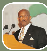
Hamilton Green Former President Guyana