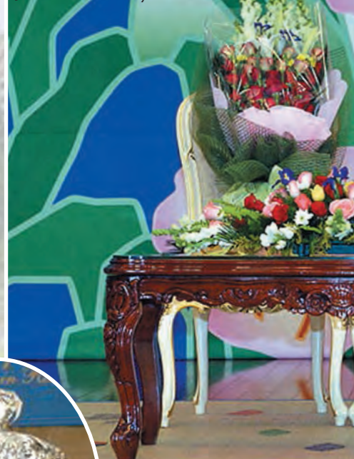
Flowers offered by representatives of Judeo-Christianity

The coronation of the king of the blessed families that True Parents held on February 6 [2003] should have taken place earlier. As it is, they held the ceremony three years earlier than our preparations warranted. We haven't accomplished our responsibility and we have not changed. They proclaimed the nation of the fourth Israel. From their point of view, it is late; but from our point of view, things have advanced a lot. In the case of the Abel-type UN, True Parents' progress can be seen. In the spirit world I saw the world of evil, and I met