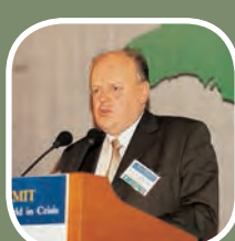
Stanislaw Shushkevich Former President Belarus