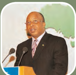
Nevers Sekwila Mumba Vice President, Zambia