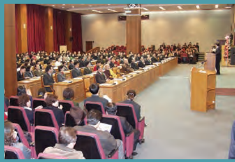
Peace seminars for youth leaders were held (in part to explain the emergence of IIPC) throughout Korea from January 30 to February 5. Here, at City Hall, Pusan

But it doesn't mean that our mission is over just by giving them holy wine. This is just a formal ceremony. We must explain to people that they are in the cultural sphere of Cheon Il Guk. We must explain the culture of purity to them. It doesn't matter if they are Christian or Buddhist, we must enable them to become the people of Cheon Il Guk and have them adopt the culture of the heart. Giving them the holy wine and holy salt is significant, but we are taking this one pure culture, the culture