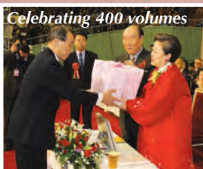
Celebrating 400 volumes