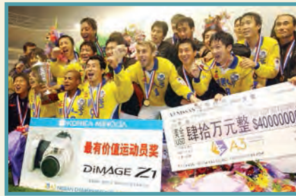
Il Hwa soccer team won the Korean league for the third time in a row in 2003. They then went on to win the Nissan champions cup for Asian league champions, in China (Feb. 28)