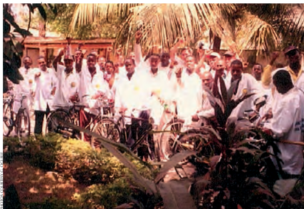
Taking the message about AIDS into rural parts requires innovative means and many volunteers

Studies have shown that there is a fair amount of common knowledge of the disease among Nigerians, especially among urban young people, but there is a critical lack of concern for the real, personal danger the disease poses. Most government sponsored education about AIDS focuses on the disease itself as an iso-