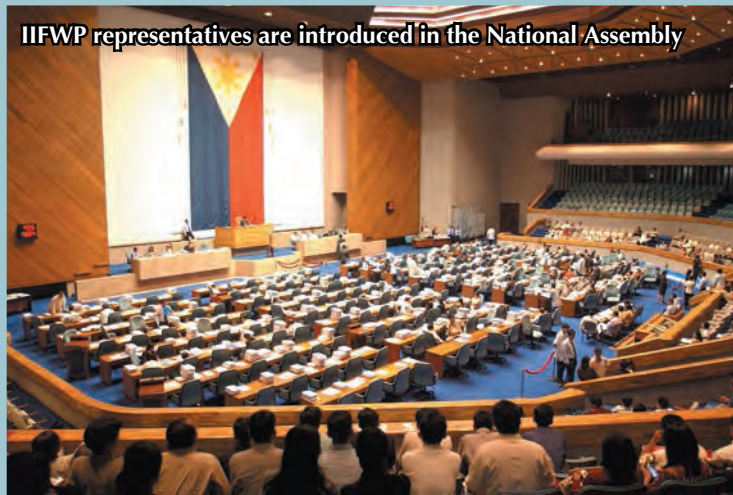
IIFWP representatives are introduced in the National Assembly

the Department of Education, Culture and Sports.