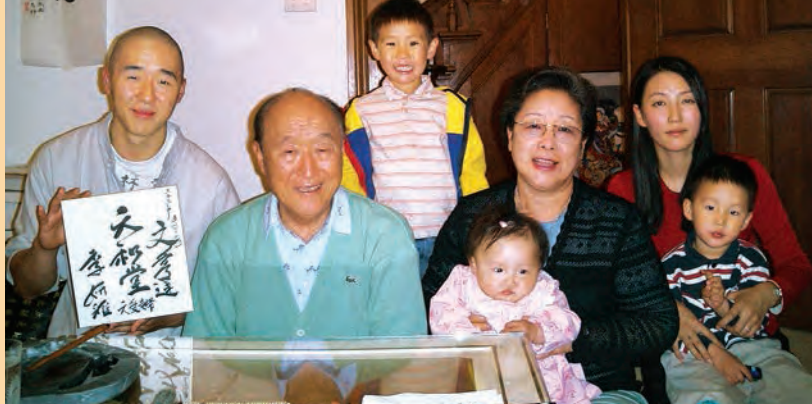
True Parents on a visit to Hyung-jin nim's home; Father wrote calligraphy for them: The couples' names and "Heavenly harmony home"