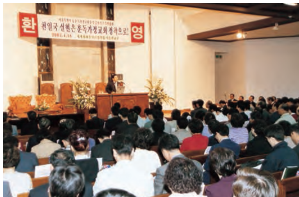
True Parents have asked members to create "hoondok family church" groups in their local areas. Meetings for those actively involved were held throughout the country during April under the theme "Realizing Cheon Il Guk through the establishment of hoondok family churches." (Photo, Seoul meeting at the headquarters church)

Now is the time for us to be owners of the world. The question is "how?"