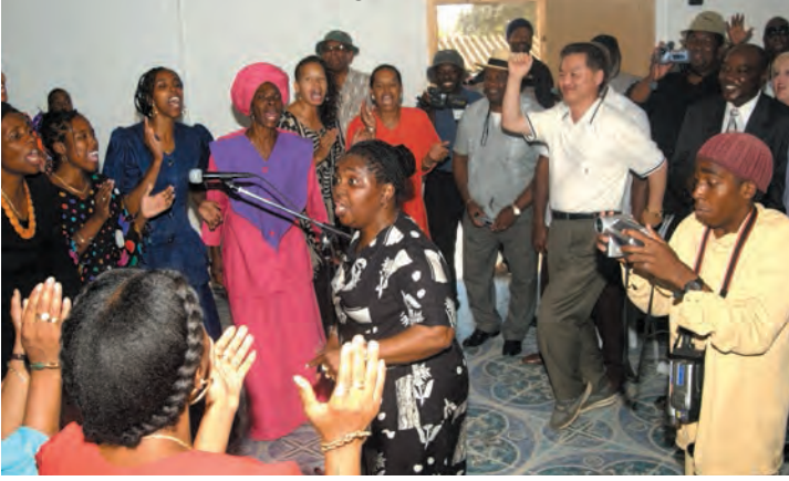
The celebration in the evening of the day of reconciliation

with coffee and cake, embraced one another and exchanged contact information.