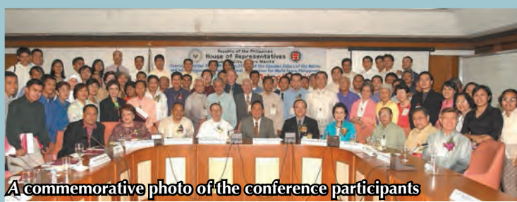
A commemorative photo of the conference participants

Following the Speaker's address, the Declaration of Cooperation for Good Governance, Peace and Security between IIFWP-Philippines, represented by Chairman Abat, and the House of Representatives, represented by Speaker De Venecia, was signed. The declaration reflects the unanimous agreement among the participants of the conference that the way forward for the nation is to bring the realms of government and religion together in addressing problems of peace and governance, but without abandoning the essential independence of each realm. Closing remarks congratulating the organizers for the important steps taken towards creating the environment for good governance in the country were offered by Andrew Gonzalez, former Secretary of