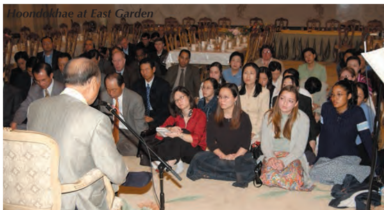
Hoondokhae at East Garden

So now, even parents do not oppose Rev. Moon's mass weddings. Instead, they now call our church and ask us to take care of their children, saying, "Rev. Moon, please match our sons and daughters so that theirs can be ideal couples. We do not mind international weddings at all. The race does not matter. Instead of dividing up and fighting with each other, and creating nations that only bring more conflict into the world, we want our children to make families that will become pioneers of peace and make a world of peace. So please do what you think