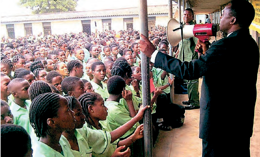
One of hundreds of presentations being conducted in Nigeria's schools

In Ghana, the national government offered our local