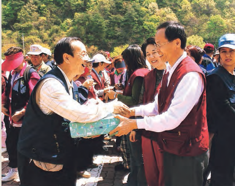
The brotherhood and sisterhood ceremony matched pairs of Ambassadors for Peace from different parts of Korea, fostering the growth of a nationwide network of the peace ambassadors

Democratic Socialist Party, had an advertisement with the title, "It's time to have a general election between South and North Korea." What do you think would happen if we had a general election between South and North Korea now? There would be only one candidate for the presidency from the North but several candidates from the South. At least ten people would come out as candidates from the South. The candidates from the South would lose the election for sure under those circumstances. Our reality is that we have not prepared in any way whatsoever to have a general election between South and North Korea.