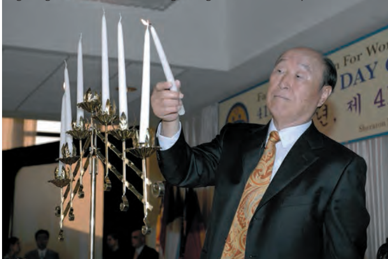
Lighting the candles at the beginning of the ceremony

Do you understand? Can love be attained alone? [No.] It's an amazing fact. No matter how great a person is, he cannot attain love alone. Rev. Moon here may be this and that, and his invisible mind and visible body may be united, but can he attain love alone without an object? [No.] Answer, all of you. [No!] No. There are more than five hundred people here; you should be five hundred times louder than I, but I am answering louder than all of you. Can one attain love alone, or not? [No!] He cannot, not even in his dreams, not during the day or the night. A person may feel happy for a short period of time, but that is a fleeting impression of joy and not actual happiness. For someone to feel true happiness and joy, that person should focus on an object and have a relationship of true love. Only then can happiness be with that person always and take root, grow, flourish and bear fruit that God would want to harvest.