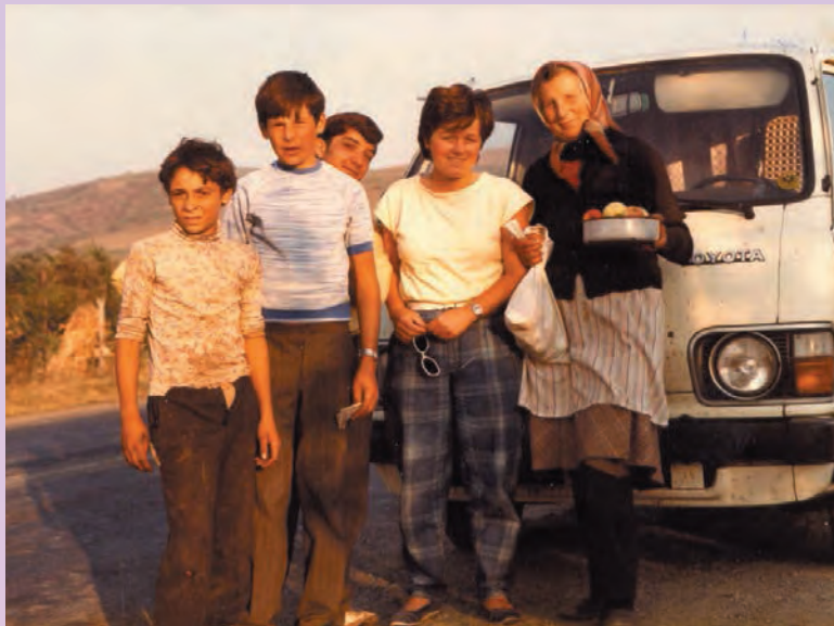
Meeting with locals in Russia during the trip