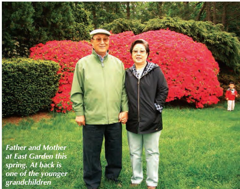
Father and Mother at East Garden this spring. At back is one of the younger grandchildren

Just wait until you go to the spirit world. See if Rev. Moon is lying to you or not. You should know that what I am telling you right now was given to me after suffering through many hardships, difficulties and great persecution—being jailed several times and going through just about every hardship there is on earth—and so what I'm saying cannot be lies. You should also know that heaven and the spirit world look exactly as I describe them. Rev. Moon couldn't be the Savior, the Messiah, the Lord of