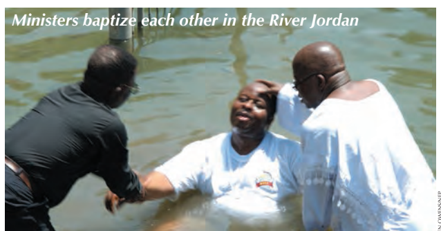
Ministers baptize each other in the River Jordan