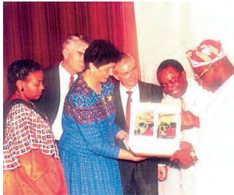
FFWPU representatives explaining the program to President Obasanjo of Nigeria

school year. Funding that will allow us to mobilize more volunteers has been made available by several national and international institutions. At the same time, we have made progress in learning from our past experiences and from the work of other NGOs in the field who are networking through WANGO and through our interfaith foundation, which has been established through