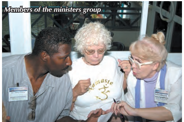
Members of the ministers group