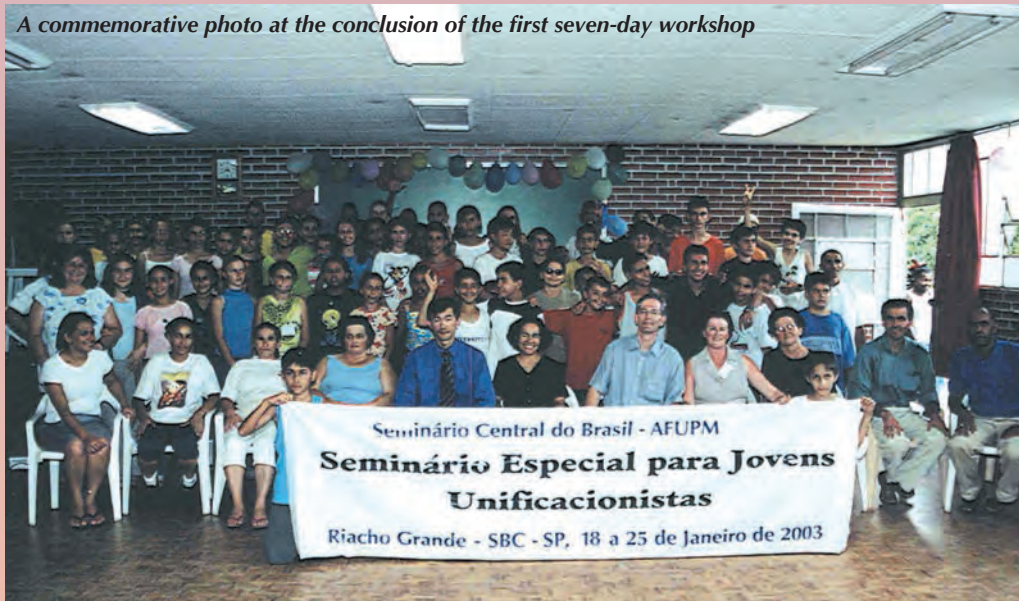
A commemorative photo at the conclusion of the first seven-day workshop

Brazil has a lot of potential and I can see a clear reason why True Father has chosen this nation to be one of the central nations in God's providence.◆