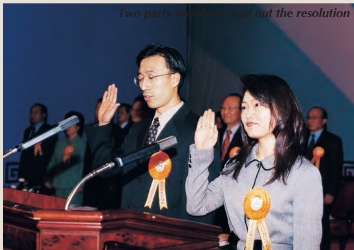
Two party members read out the resolution