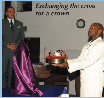
Exchanging the cross for a crown