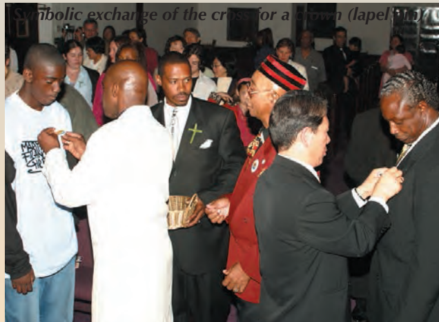
Symbolic exchange of the cross for a crown (lapel pin)

The one who has overcome is here. Let us be bold and confident to proclaim the good news. ♦