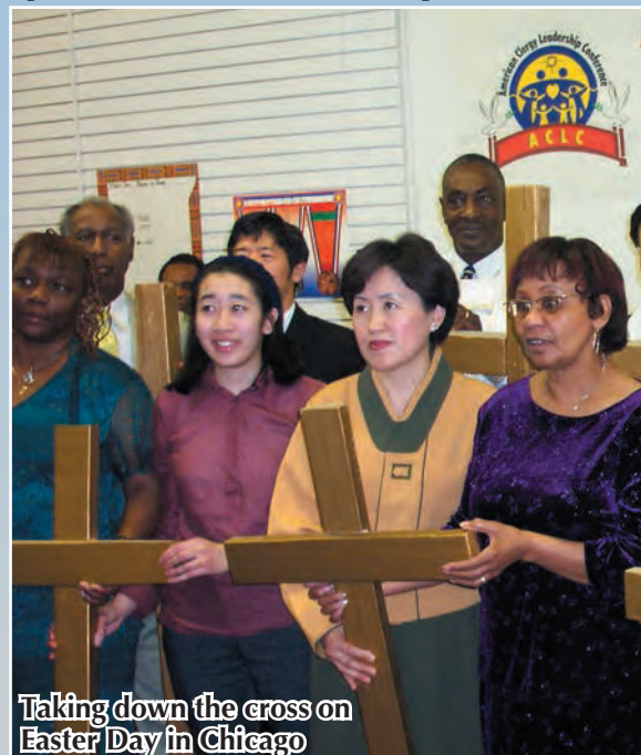
Taking down the cross on Easter Day in Chicago