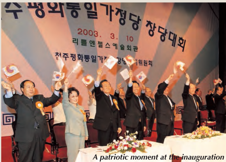
A patriotic moment at the inauguration