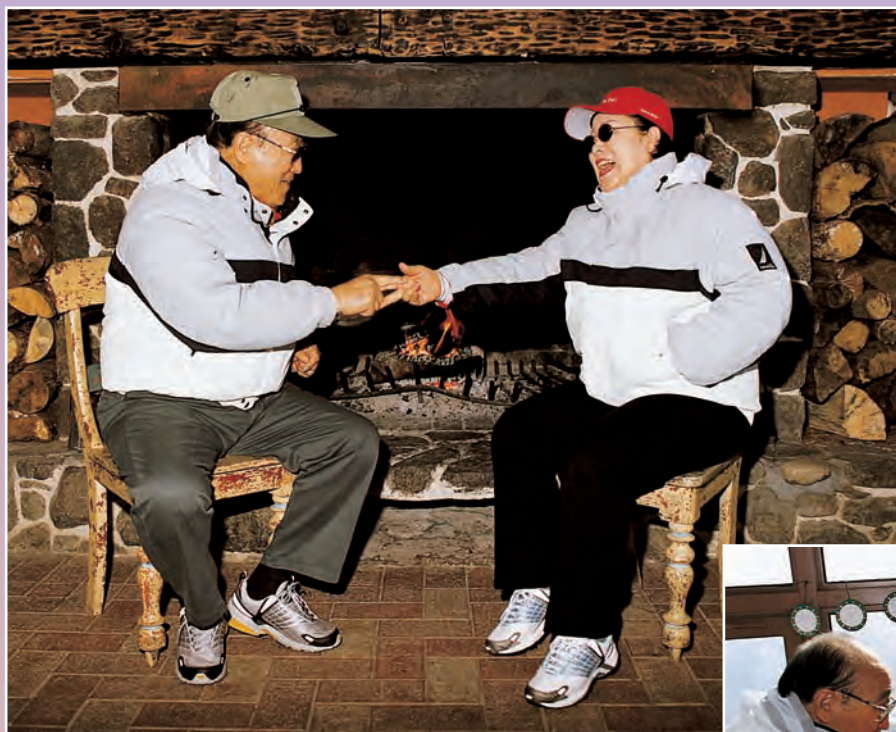
Father and Mother at Yong Pyong Ski Resort in March. They held a meeting at the hotel there with the leaders of providential organizations