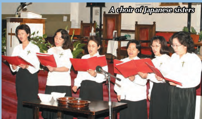
A choir of Japanese sisters