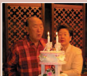
True Parents' Day: left, Father and Mother cut the celebration cake. below, leaders celebrate the holy day with True Parents at East Garden