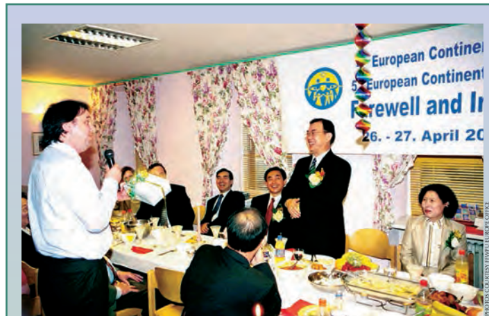
Farewell and Inauguration Ceremony 26. - 27. April 2003, Schmitten, Germany

We must renew ourselves and have conviction that matches the providence. We are the ones who are daring and adventurous. We are a unified people with the same belief. I sincerely pray that we will become a community that will take responsibility for the new providence in this new era. ♦