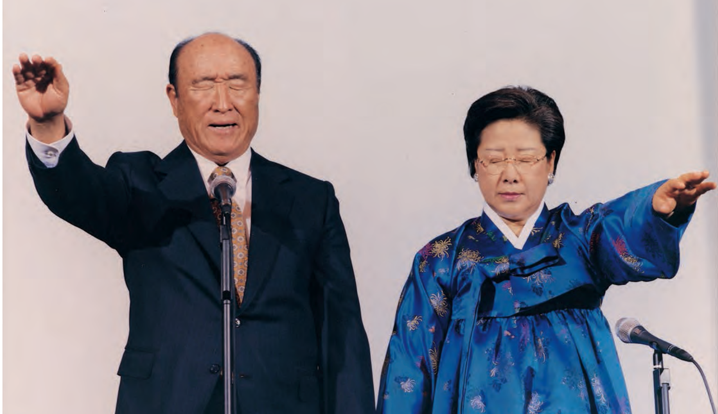
Translated from the original transcripts

Reverend Sun Myung Moon January 1, 2000 Hammerstein Ballroom, Manhattan Center, New york