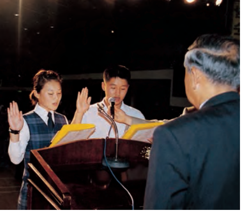
sports. More internally, in order to help the fostering of self-control, our nation should invest in supplying good movies and books for youth. Education is our only way.

Furthermore, we should clearly teach what a terrible thing sexual violence is. Then, even though someone might experience sexual desire, he would not easily act in that way and commit such crimes. We must teach them that we can only create a true family by controlling sexual desire and having a pure heart.