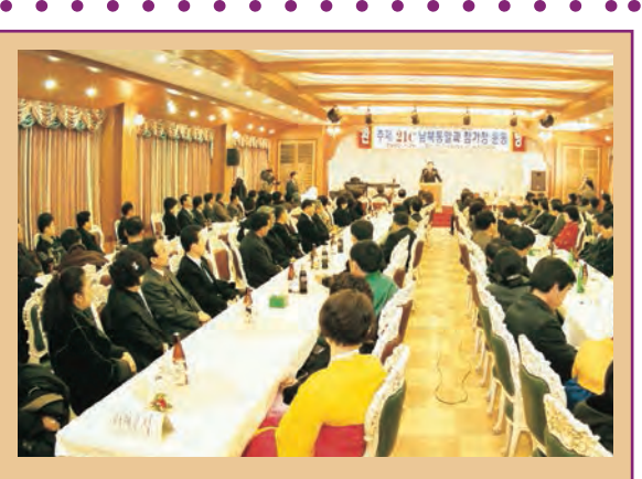
A presentation on "North-South Unification and True Family Movement for the 21st Century" at Yosu in the far south of the peninsula, Jan. 28