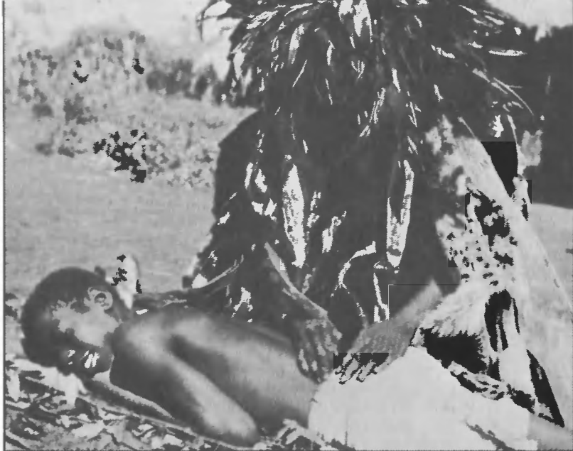
Old and new treatments co-exist in Africa. Very often patients are brought for modern medical care only after native remedies have failed; sometimes it's too late.

One of our “brothers” went last week to see “The Godfather,” because he had heard it was about American society (Yech!). Anyway, he was sort of witnessing to another “brother” when the short feature film went on the screen, and there was Reverend Moon!