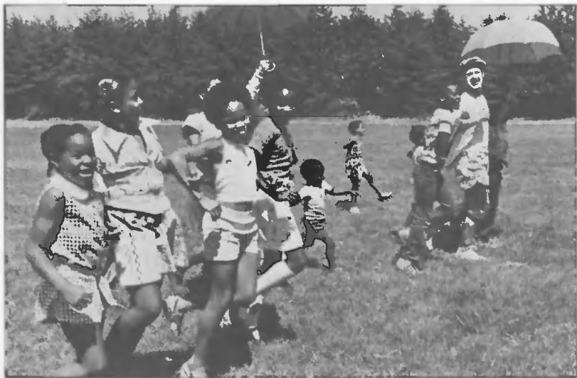
Unification Church members have been organizing a variety of programs for youngsters in the Washington, D.C. area to stimulate community service projects.

to folk-dancing and guitar classes billed as part of an "Unselfish Way of Life Program," to clean-up contests for neighborhood youngsters.