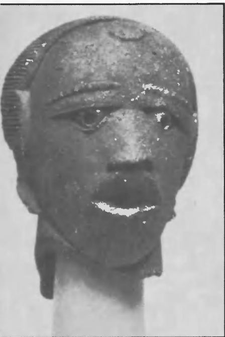
The religious sense of awe is expressed in this 2,000-year-old terra cotta head from Nigeria.

Christianity can play a large role in dispelling the fear that accompanies the belief in dynamism—the sense of dark powers at work—by substituting trust in “a living, present, loving God who is stronger than any evil power.”