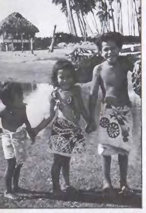
Life is carefree for these South Sea Islander children, and for their parents too. In the rear is a typical thatched home.

satisfied here. Breakown of the family unit is just beginning.