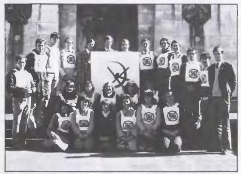
Unification Church members in New Zealand stage four-day National Prayer and Fast to protest government's dealings with communist nations.

many of our country's sixty million sheep seem to have given birth. Not to be outdone of course our family here has been working very hard with the reward of three new brothers and sisters coming to join us.