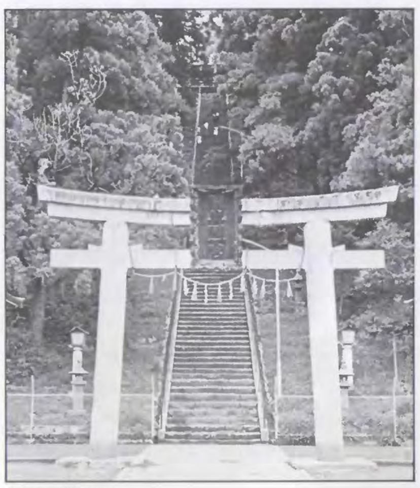
Shrine in Shiogama.

As I have just mentioned the importance of honor and loyalty to the emperor, let me elaborate on the position of the emperor and the attitude of the Japanese people to him. It may be difficult for democratic-thinking people to understand, but to the Japanese