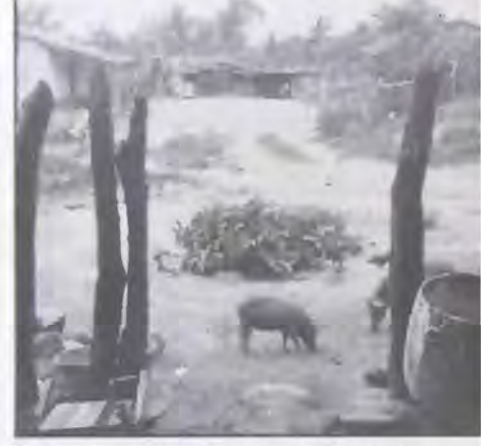
Typical village scene in Central America.

Every day we get up early and pray at 5:00 a.m. in a nearby park, which is very beautiful. Because of this prayer condition we met a young law student, a strong Christian who has now heard the entire Divine Principle and studies with us two hours every day. He goes to the park early in the morning to exercise.