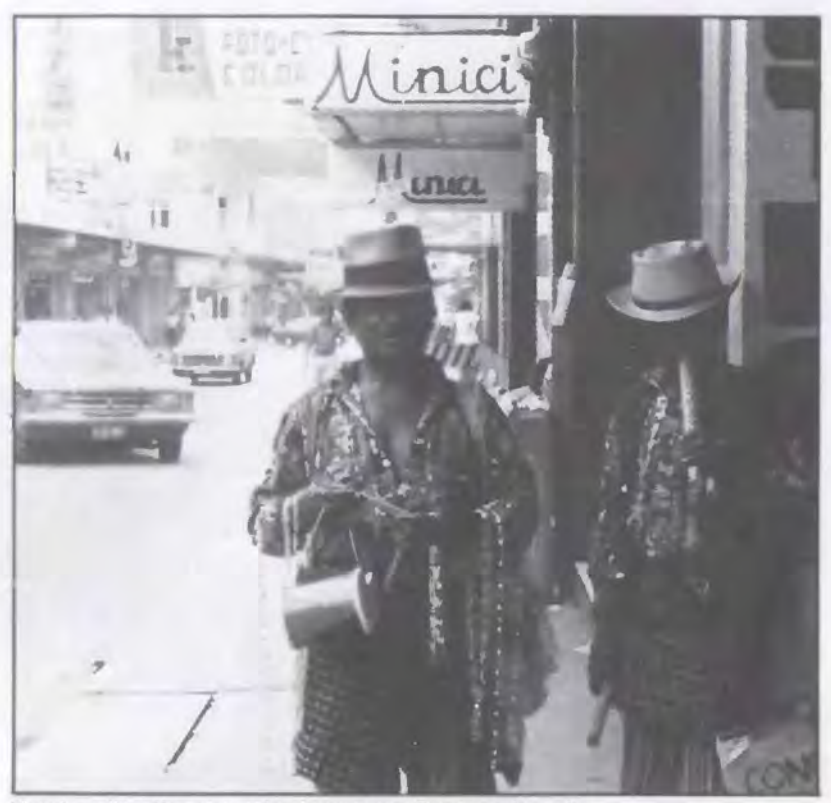
Vendors line the street in downtown Guatemalan city.

she is quite interested in hearing more about Divine Principle, but more interested in English.