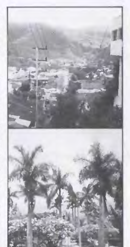
Above, view of Tegucigalpa, capital of Honduras. Below, Parque La Leona where missionaries pray every morning.

We will, of course, be very cautious. It is sometimes difficult to know the meaning of events in the news because the newspapers sometimes seem unreliable. Sometimes they print rumors in order to have more colorful stories. Also, everyone has different views on what is true or what is right. So my assessment is based on what I read and hear, to the best of my ability—but I still have much to learn about Honduras.