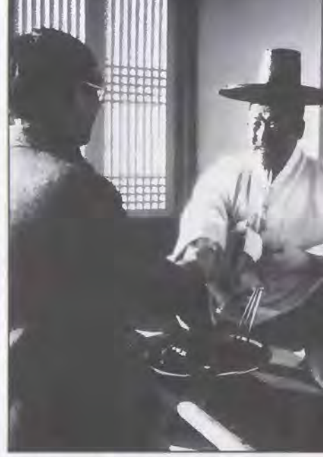
Instead of clashing, Western technology and the spiritual values of the East are meant to complement each other to lay the foundation for establishing the earthly Kingdom of God.

In his writings Hearn once used the following quotes. I would like to use them again since they reflect the essence of our beliefs and our present day situation. From Ferdinand Bruntiere: "All our educational measures will prove vain, if there be no effect to force into the mind and to deeply impress upon it, the sense of those fine words of Lamenais: 'Human