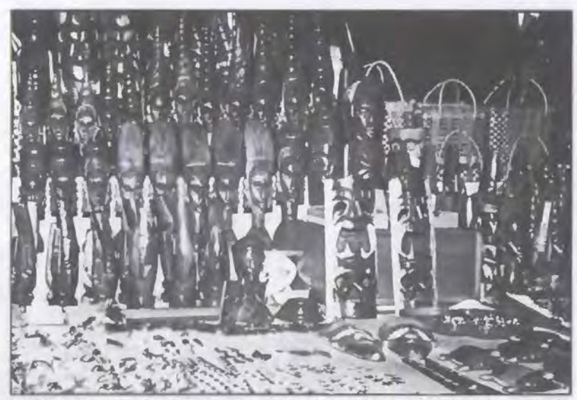
Market stall in Fiji features wood carvings, jewelry made of local sea shells, and hand-woven baskets.

in such an open, responsive country. None of us have worked anywhere where the people have been so genuinely helpful and curious about our work.