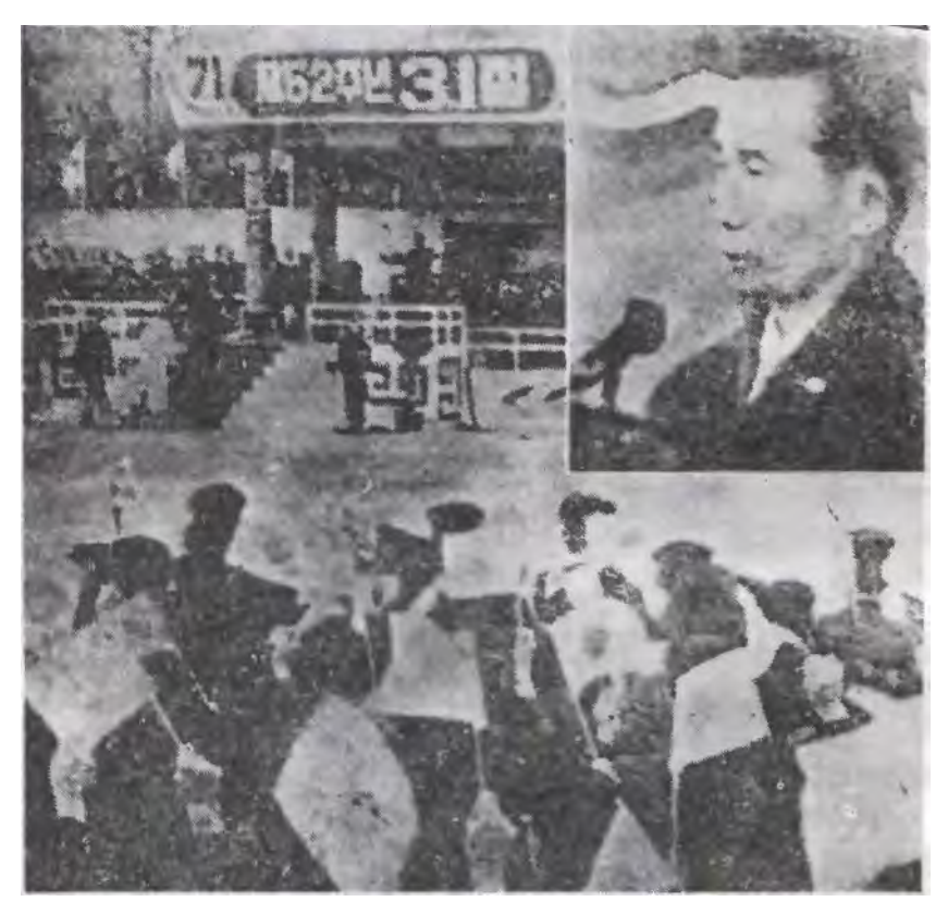
President Park Chung Hee delivers a Commemorative address during a ceremony held at the Capitol plaza.

The celebrating ceremony of the 52nd anniversary of the Sarnil (March 1) Independence Movement was held at the Capitol plaza March 1st, 1971. Over 10,000 people took part in