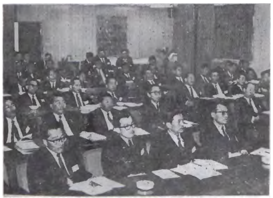
. Professors hearing the lecture of Principle

World. This has to also overcome Nihilism that is not solved by Existentialism in this age. Therefore, we need a new styled religion and I believe that this could be done by the Principle of Creation in the Divine Principles, doctrine of the Holy Spirt Association for the Unification of World Christianity.