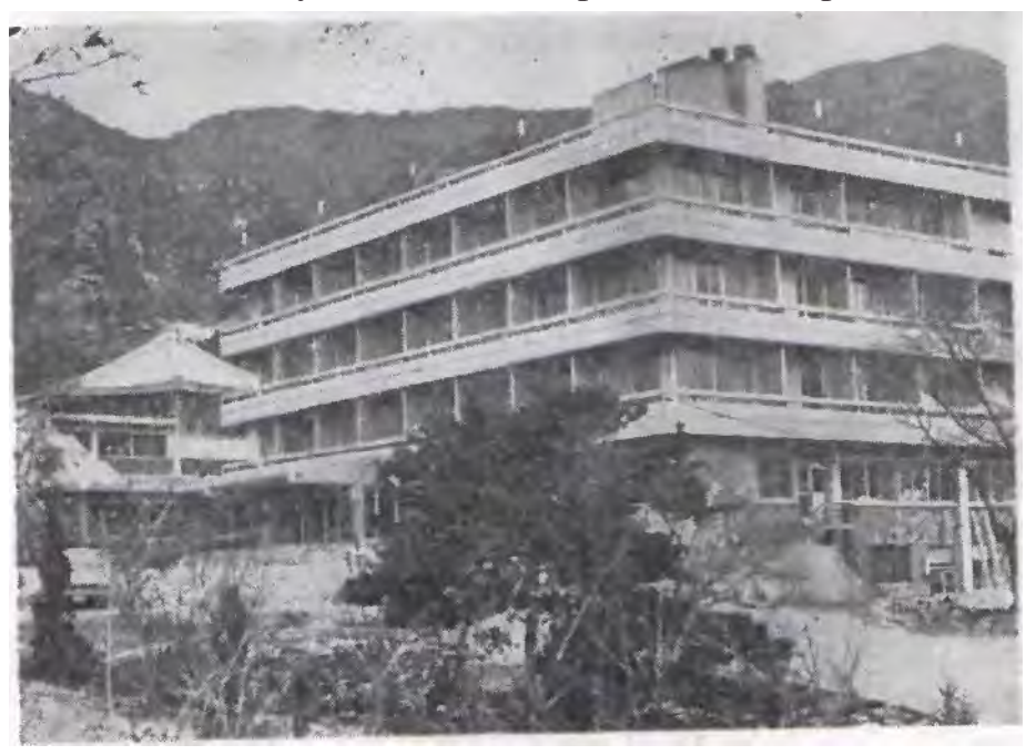
Christian Academy House

Under the auspices of the Collegiate Association for Research of Principles, the 2nd Principle Seminar for professors opened at Christian Academy House with the presence of 88 professors