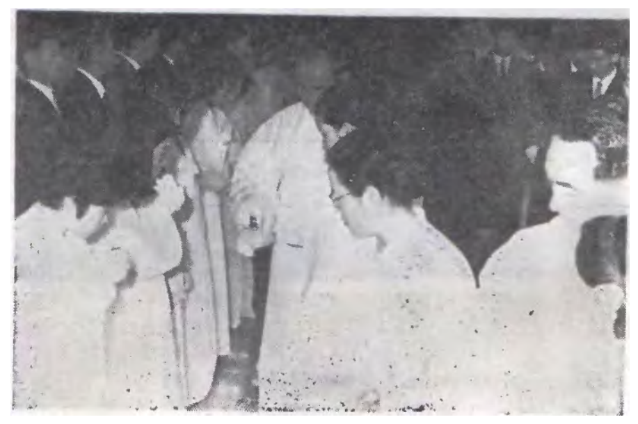
A Scene of Holy Wine Ceremony

On Sunday, October 18, ! we had [barely gotten to sleep when at 12:45 a.m. we were awakened with the news that the Master was on his way from Seoul and that he wanted to perform the Sacred Wine Ceremony when he arrived. Everyone