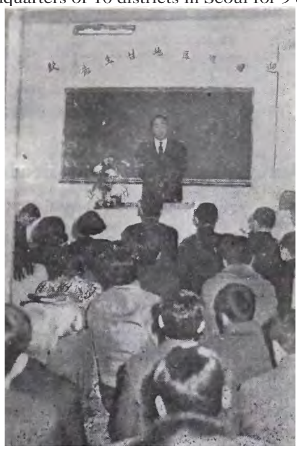
Master addresses at Yongdungpo District

Shortly after Master finished his round visit to 24 local districts for twelve days last January, he again paid a round visit to all headquarters of 10 districts in Seoul for 9 days from