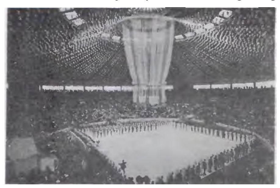
A panoramic view of 777 Couples Wedding ceremony

This was the dat we were all waiting for. We got up and dressed in our wedding suits and ate breakfast about 8:40 a.m. boarded the bus for the journey to the Seoul Chang Chung