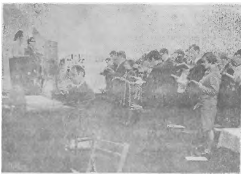
Second Annual European Conference, Essen, Germany In the Meeting Hall

more and more aware of the "signs of the time" so that from this point of view I have good possibilities to start a discussion. I could talk with many young girls and boys either on the street or in groups or at home, and feel happy about every positive conversation and every sign of confidence, because confidence is most important for winning people. There are especially three