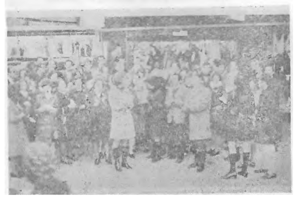
International Witnessing Ketwigstrasse "A Cloud of Witnessers"