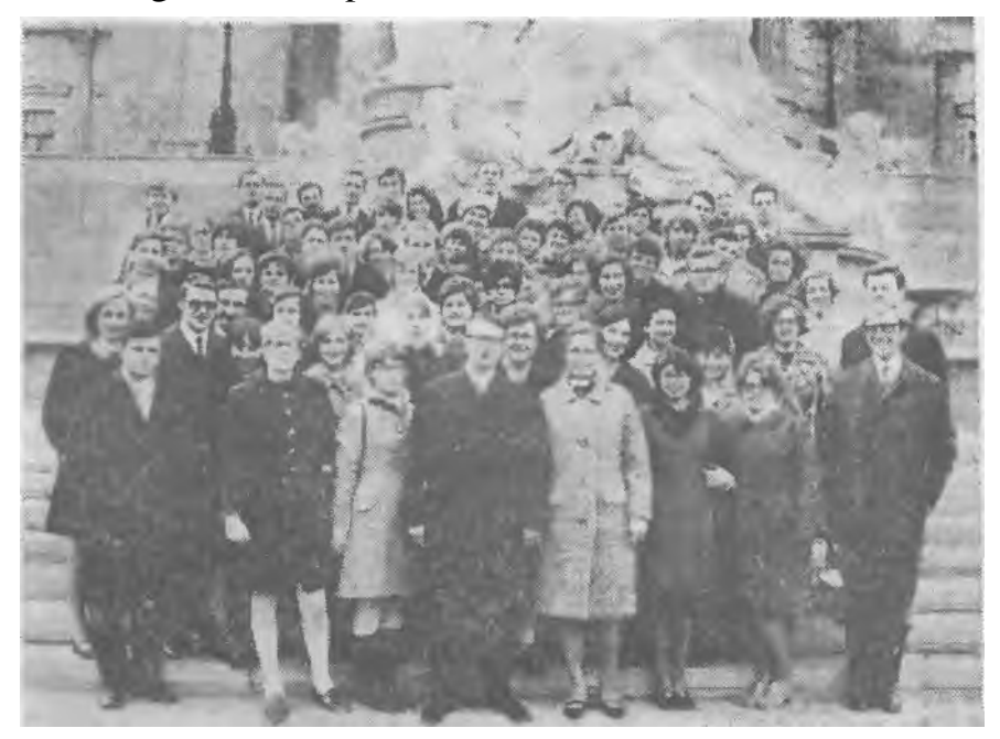
Children's Day 1970. Austrian Family

The most significant event in this month's act:vities of the Austrian family has been a radical change of policy regarding our university work. Our limitation to the religious approach and our ignorance in political matters had adverse effects on