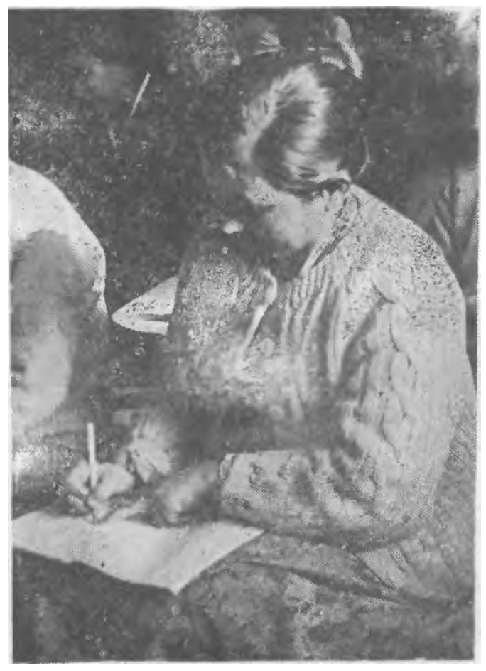
A mobilized woman member of blessed family

During the period between December 20th, 1970 and January 30th, 1971, All other family members, than blessed family members already mobilized for propagation till the end of 1970 started for propagation into the country, at all hazards.