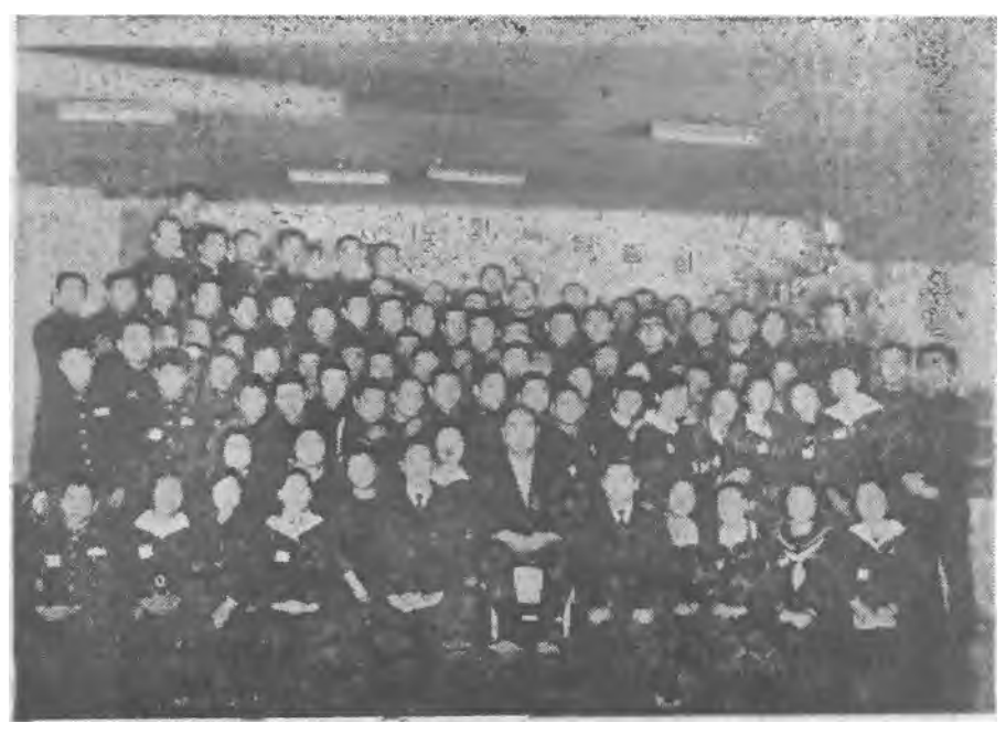
16th Sung Who Student members

They had all night recreation after the ceremony.