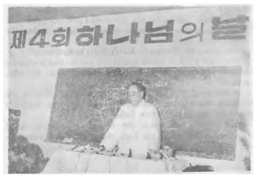
Master's prayer for The God's Day at Seoul Church

At the beginning of the New Year, I sincerely hope and advise you to do your best in following the way to loyalty and filial piety to God and God be with you.