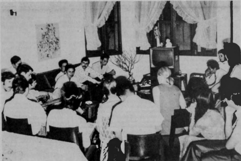
American youth leaders meet with recent Vietcong defectors.