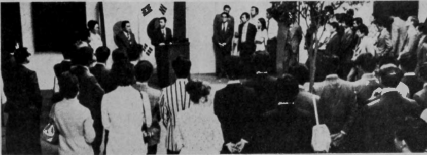
Recent FLF-sponsored reception for young Korean residents of Japan who participated in a summer International Leadership Seminar was held at the Kennedy Center in Washington, D.C.

The agents of the Kim regime, because they do have a comprehensive ideology, have been able to win support for what is undoubtedly the most repressive society in the world. Unless we have a more powerful ideology of freedom, oppressive tyrannies like that in North Korea will continue to multiply.