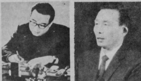
North Korean dictator Kim Il-sung (left) and South Korean ruler Chung Hee Park.

For the time being, the primary question is regarding the future of South Korea's crucial relationship with Japan. A realization of the threatened break with Japan would be devastating. Hopefully, the situation will be eased by more energetic cooperation by Japanese authorities in prosecuting the assassin's accomplices.