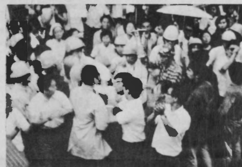
Federation members face violent attack from Marxist extremists in preparation for 1970 World Anti-Communist League Conference.

In January 1972 FLF arranged a meeting between IFVC and eight congressional