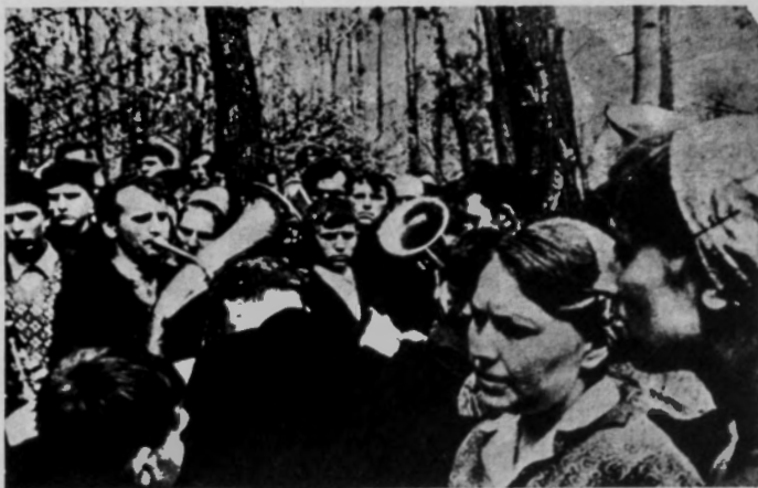
Underground Christian meeting