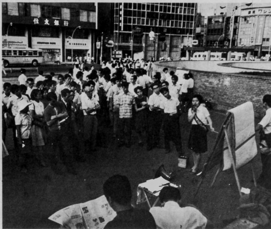
IFVC members teach counterproposal to Communist ideology on streets of Tokyo.

The IFVC in Korea has given lectures to nearly 11 million students, workers, professors, soldiers, and clergymen, usually at their place of work or schools. IFVC also conducts week-long training at its 400-capacity training center outside of Seoul. Over 53,000 have graduated from