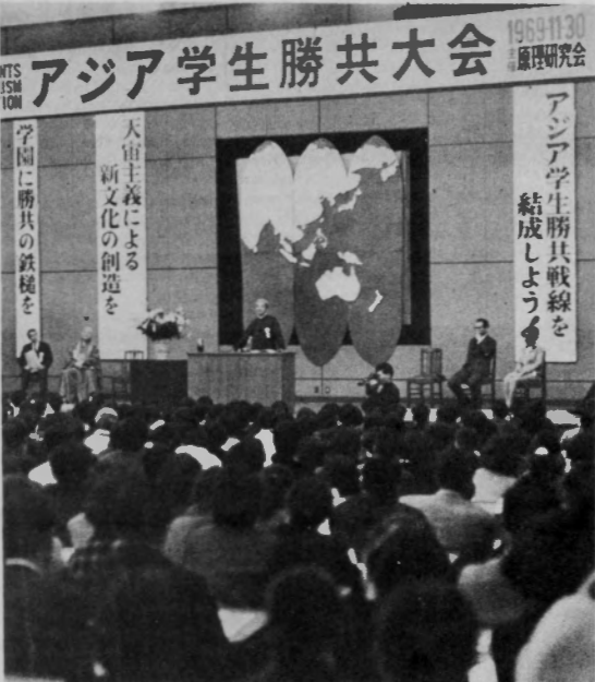
The Asian Students Anti-Communist Convention was first organized by IFVC in 1969.

IFVC's greatest achievement has been its successful appeal to youth. The key to this success is in the fact that IFVC takes an ideological approach. The VOC theory teaches that Marxism's greatest error is its belief that the material world and material relationships alone determine human consciousness, religion, and culture. Herein lies the root of Communism's anti-human nature and the seed of its own ultimate destruction.