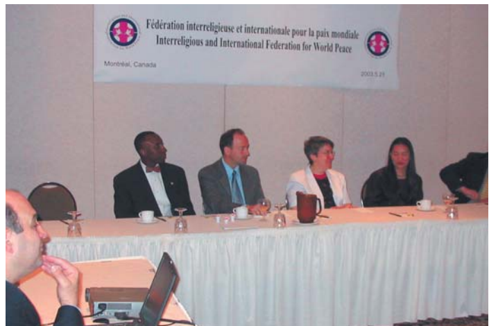
Guests included Muslims, Christians, a Sikh, a Hindu, and Unificationists at the interreligious meetings in Ontario.