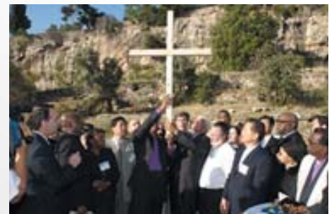
Participants carrying cross to "Potter's Field."

The concluding banquet had an overwhelming feeling of victory and joy. Christians and Jews became united completely. They toasted to the reconciliation with Holy Wine. One of the main guests brought a family from his synagogue who had recently lost their 19-year-old son in a suicide bombing. The father told us that