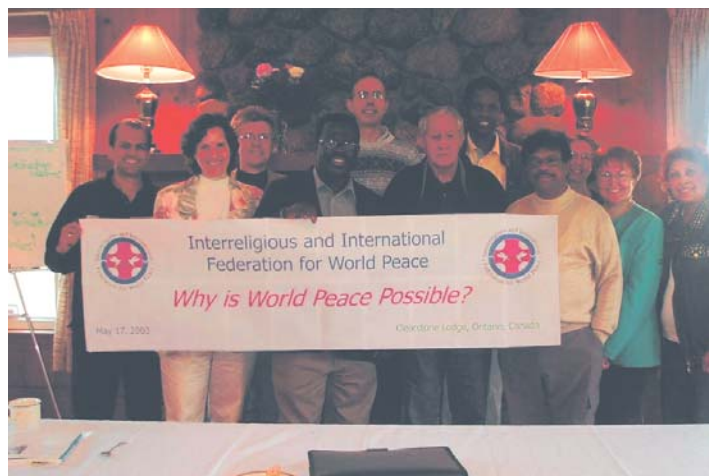
Representatives from various faiths are meeting regularly in Montreal under the auspices of the IIFWP-Canada.