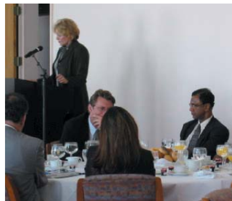
The ambassador's luncheon at the UN promotes interreligious cooperation.