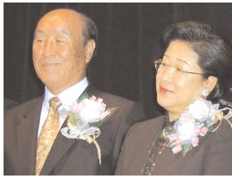
Rev. Dr. & Mrs. Sun Myung Moon.

The earth is our common unified nation of