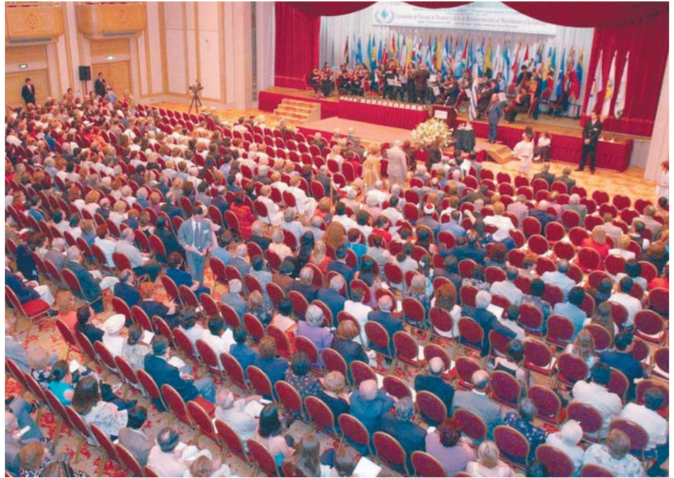
More than 120 guests from 7 cities in Uruguay attended the national seminar on Ambassador for Peace activities.

At the last event which took place in November 2000, 1,500 participated including the Uruguayan Culture and Education Minister, Ambassadors from Costa Rica,