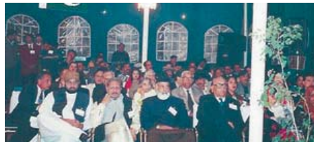
150 guests attended the national seminar in Pakistan