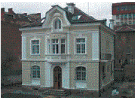
The Peace Embassy in Bulgaria