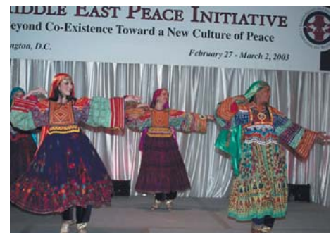
Entertainment at the Middle East conference

Often the proceedings and events of the day can be intense. During the recent Middle East Peace Initiative, there were some very heated moments, where emotions ran high. During the third evening after the first folk-dance, there was a spontaneous joyful outburst by Jews, Christians and Muslims, Israelis and Palestinians alike, coming onto the stage to sing in unison. It was quite beautiful and through that simple act you could feel that peace was indeed possible. There is a catharsis that comes about through singing,