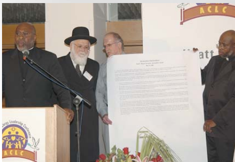
Conference guests holding "Jerusalem Declaration."

Political leaders cannot solve the problems in the Middle East. The solution can come only from the religious side. After the Christian pastors came back to America, Rev. Moon signed on the Jerusalem Declaration, and wrote in Korean, "Victory of Israel." Two more pilgrimages are planned. ✱