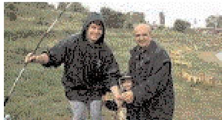
Happy participants in the fishing competition