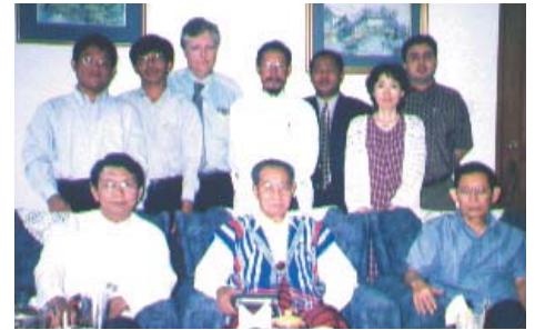
IIFWP meeting in Myanmar

The February meeting was held at Cafe Dibar in a private room. The paper read was, "The Social, Cultural, and Global Significance of the Family," (which was