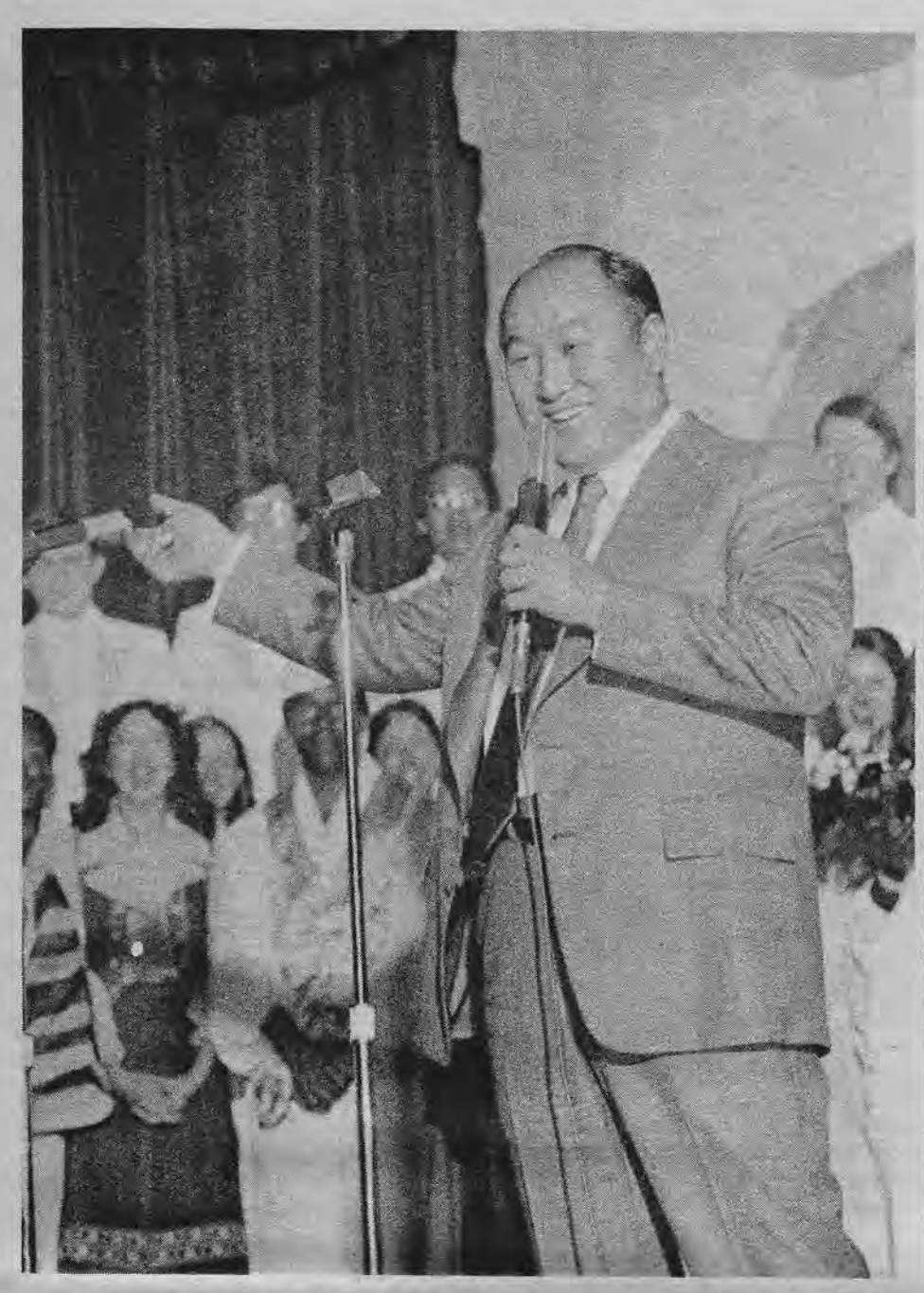
Father and Mother conclude the Parents' Day 1979 celebration in song.