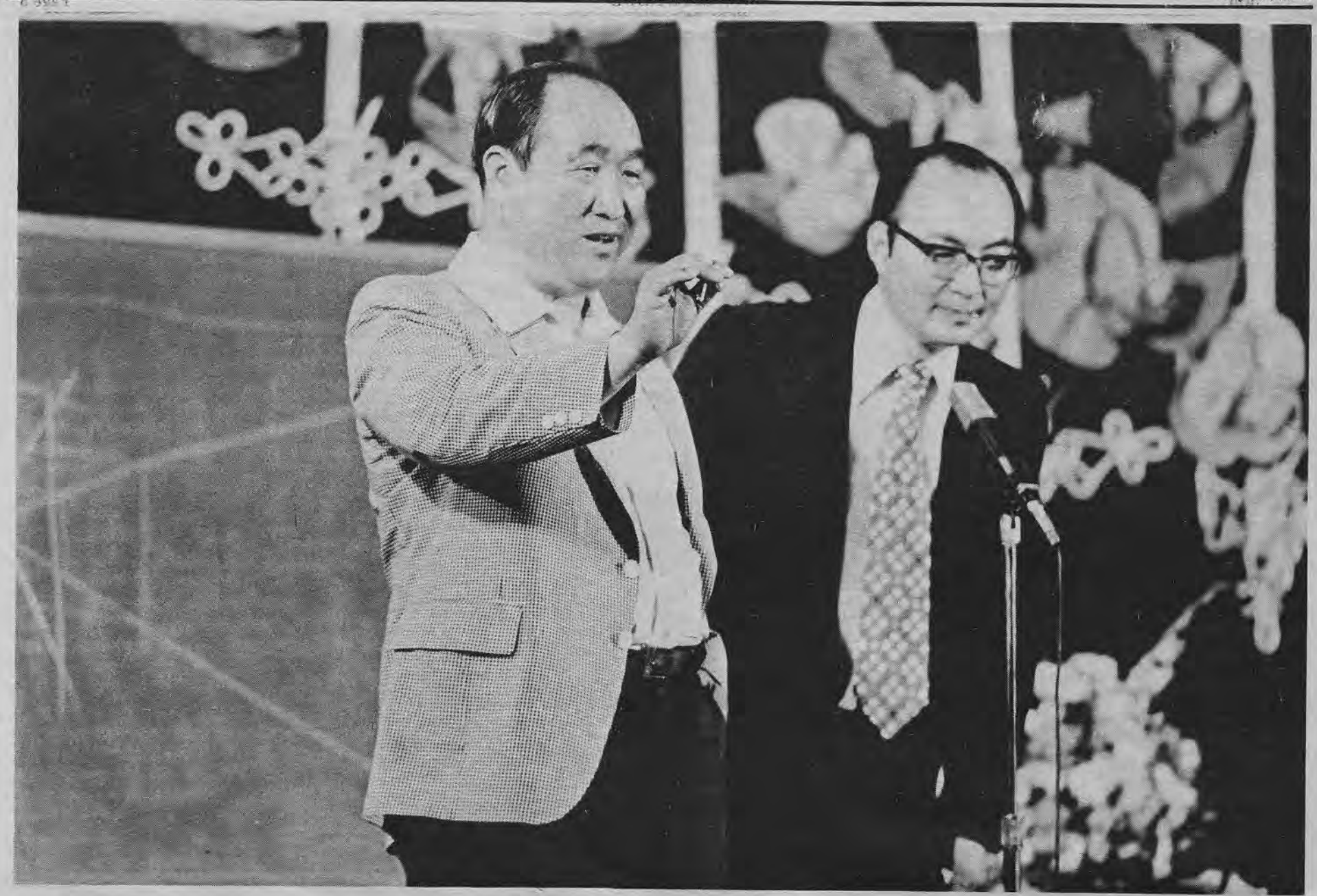
Father speaking to the members on Saturday morning.