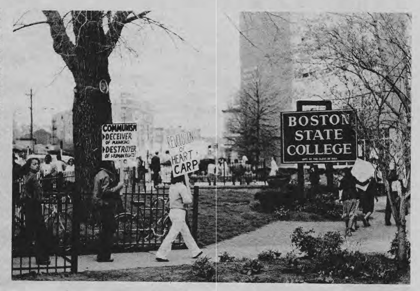
CARP members protesting discrimination at Boston State College.

One of the highlights of the team's stay in Boston was its April 25 "Student Banquet for Professors" held at the Boston Sheraton Hotel, site of the most recent International Conference on the Unity of the Sciences. Forty-seven guests, most of them professors at local colleges,