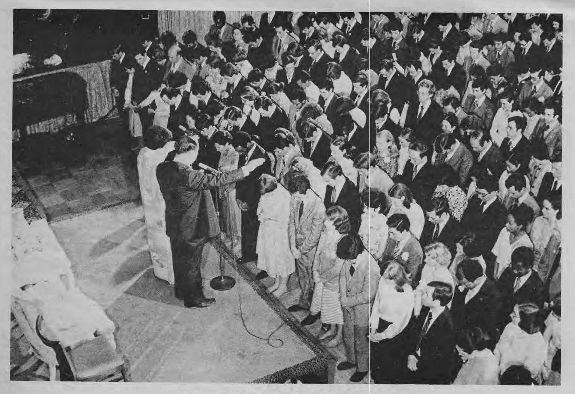
Father and Mother open the Wine Ceremony at 2:40 pm, May 13.

A wedding is perhaps the most important ceremony in life, in which an engaged man and woman stand before God, pledging eternal love as husband and wife, and receiving God's blessing. Because this future wedding will be such a joyful and important moment we will look forward to inviting as many relatives as possible to celebrate this event.