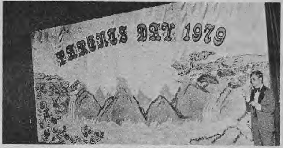
A Korean landscape serves as the entertainment "front-drop"

Parents' Day on a tribal level. If the home church work is successful, he said, our children will not be separated at all from God. If it is not, then our children will have to continue the work. Father concluded: "I would like all of you to be welcomed back to your hometown, and ultimately to live in a happy family. We shall do our utmost with our heart and soul in completion of that goal."