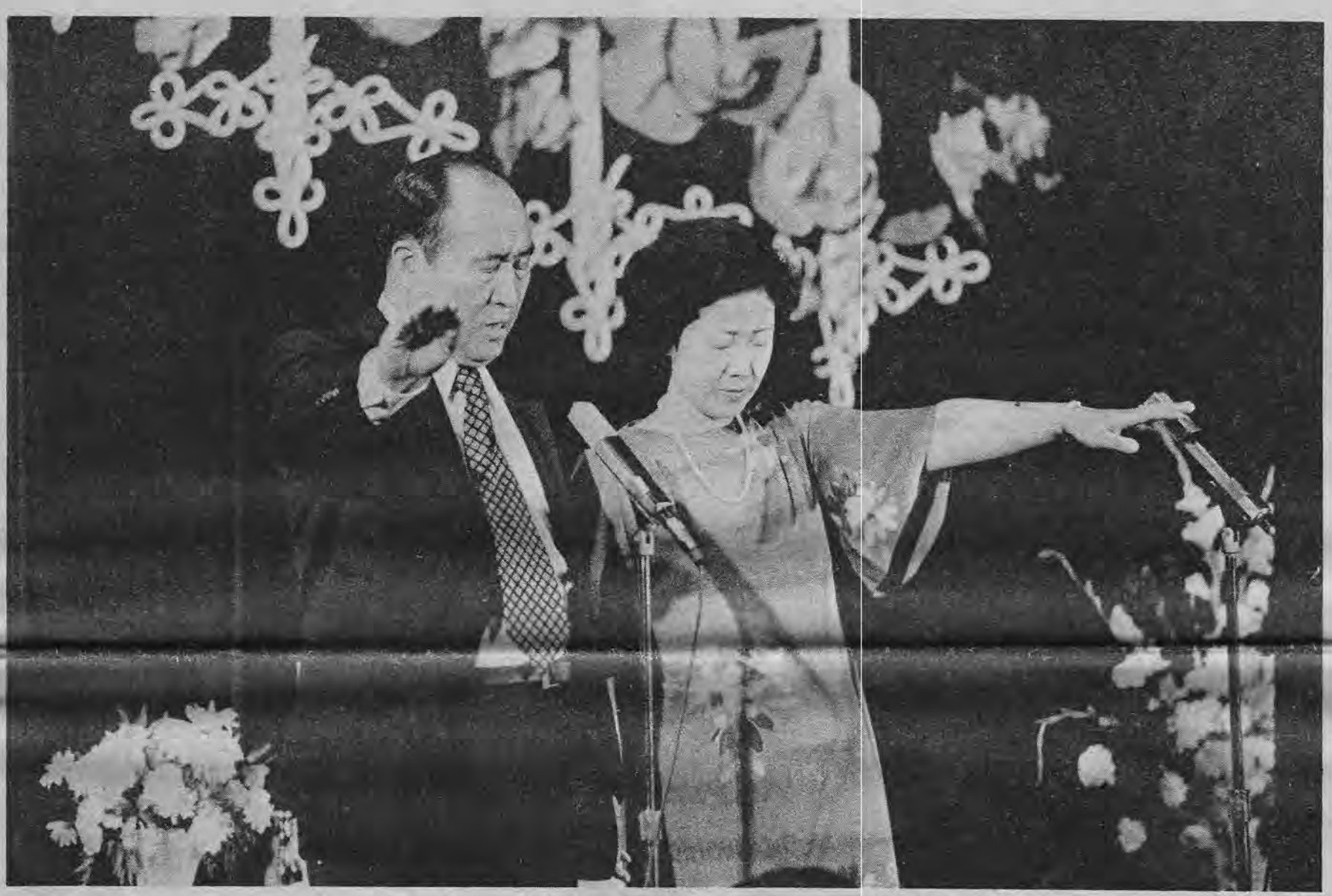
Father and Mother begin the Holy Wine Ceremony on May 13.

May 13th, the day of engagement for 705 Unification Church couples, was the culmination of one of the most exciting events in the history of the Unification Church in America, and was undoubtedly without historical precedent in U.S. history. The couples, gathered in the Grand Ballroom of the World Mission Center, almost as many in number as the 77 couples married nine years previously in Seoul, represented all races and 36 countries. Over fifty of the engagements were between blacks and whites; over 200 were between whites and Orientals, and an additional 100 couples were international. The participants' ages ran from 22 to into the fifties, their missions ran the gamut of possibilities, and length of membership sometimes went as high as ten or more years.