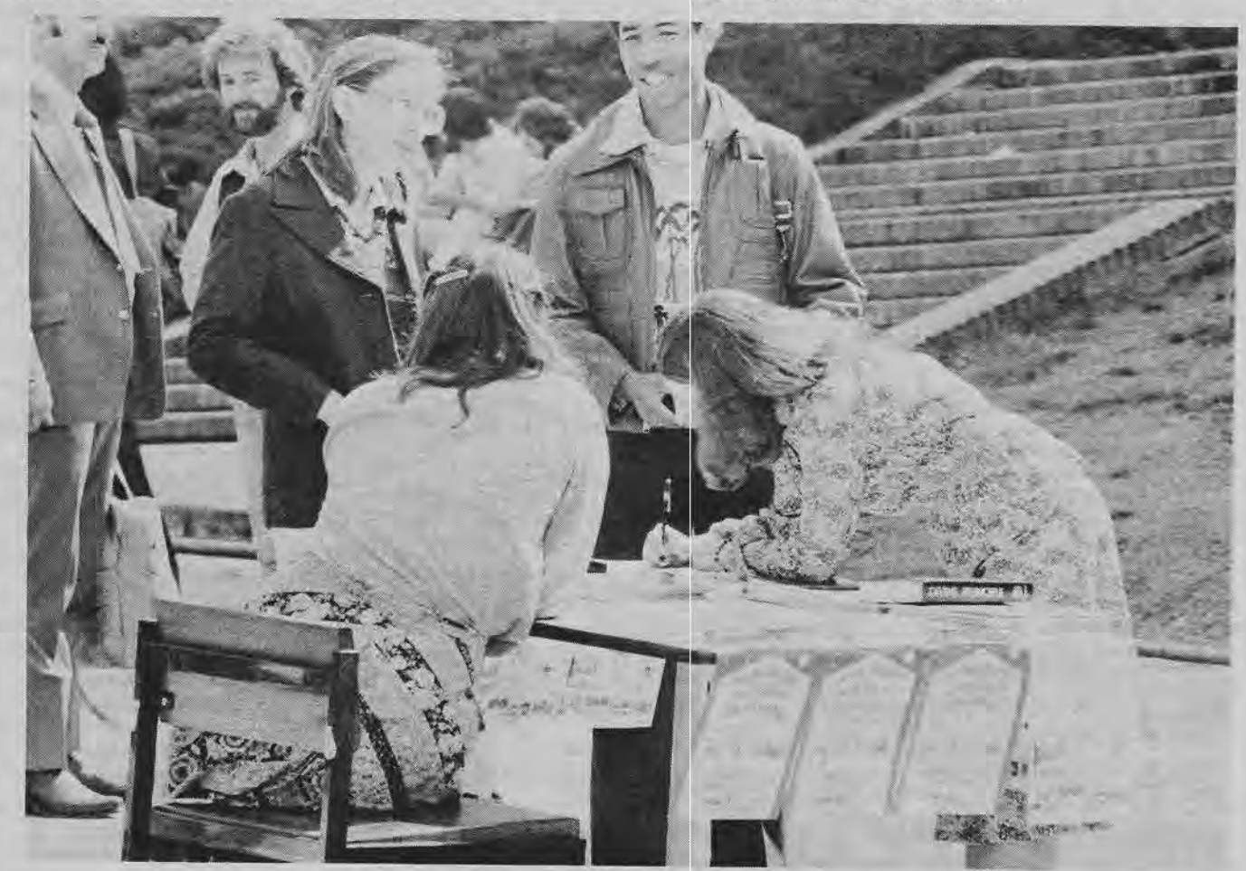
Students congregate at CARP literature table on campus.