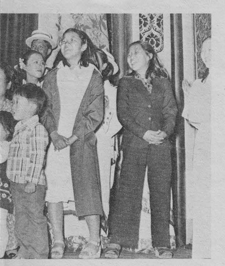
st of the children watch Father dance.