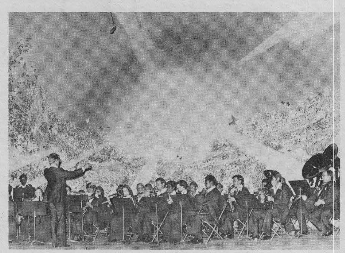
The stage forms a beautiful background for the Go-World Brass Band.