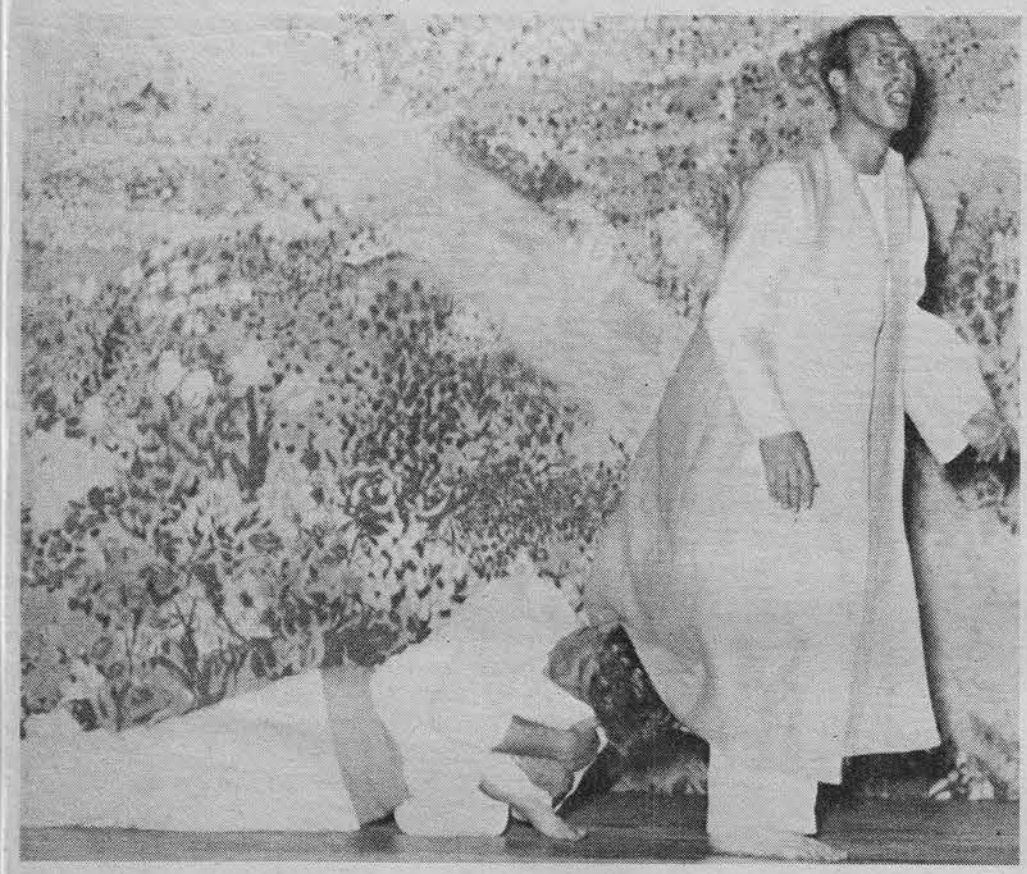
Jacob, although disabled by the angel, defeats him by surprise in "Ring of Brothers."