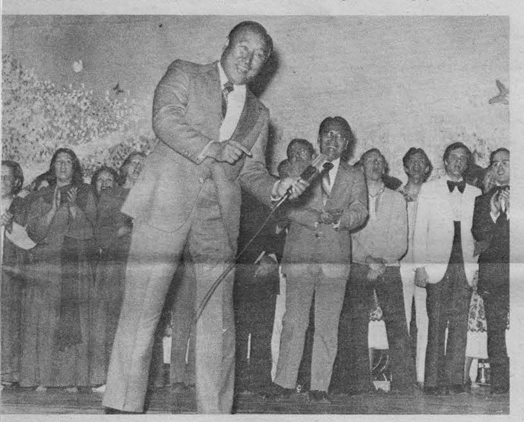
Father and Mother [below right] dance and sing to close the celebration.