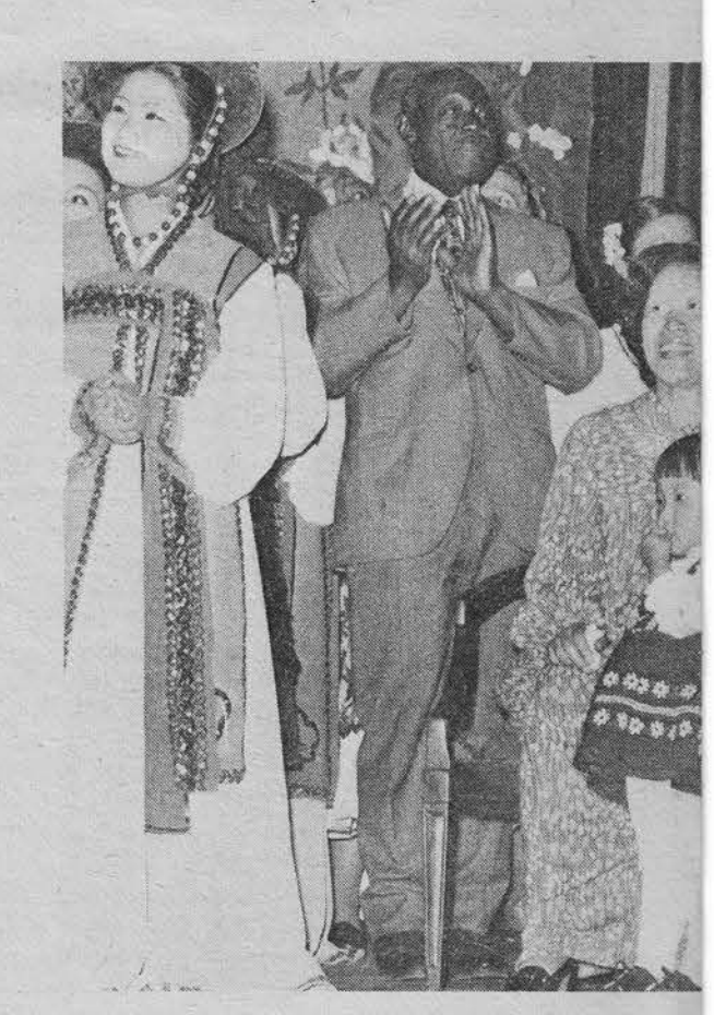
Mother and the re