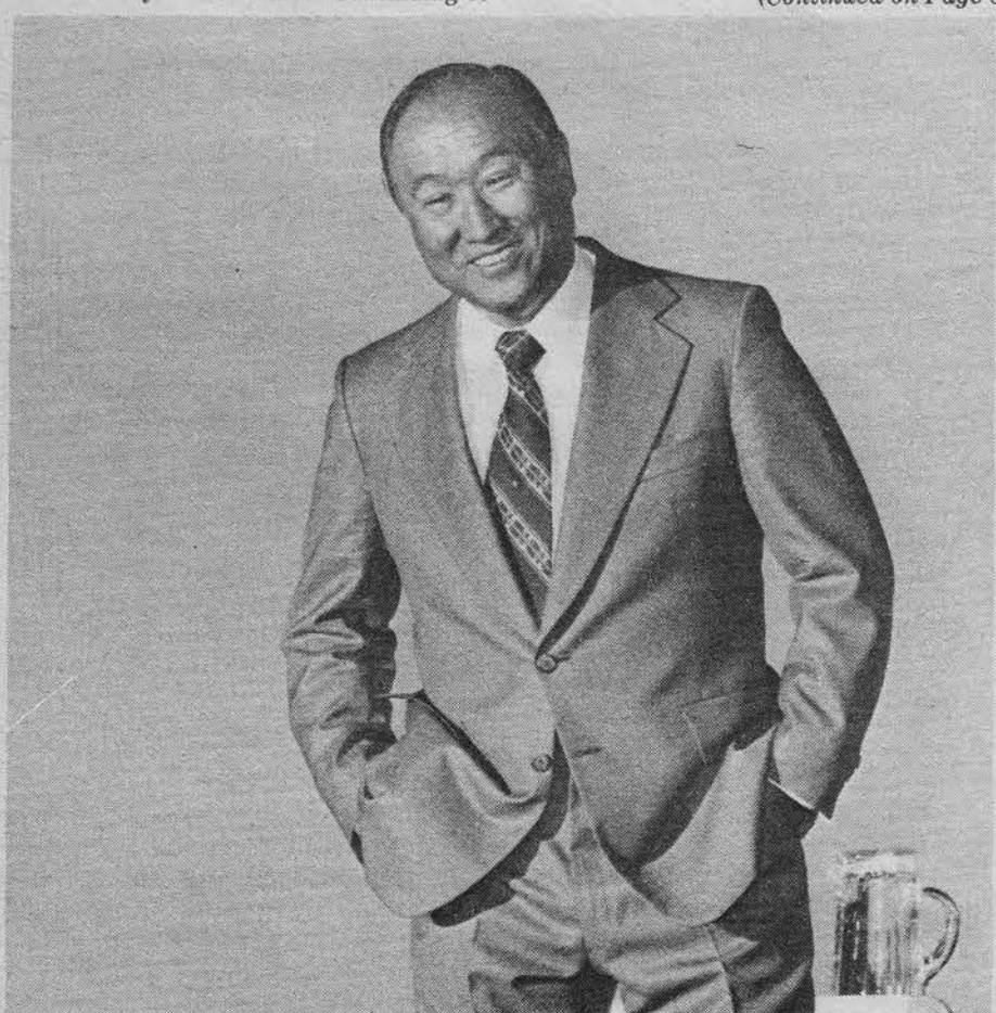
Father on Parents 'Day'. "In our church Celebrations we gain a realization of God's world of love.'

"Today, on the 19th celebration of reflect, he reminded the members that the very fact that we celebrate Parents' Day indicates that there is something wrong in. the world; if there had been no fall, then there would have been no need for Father (Continued on Page 8)