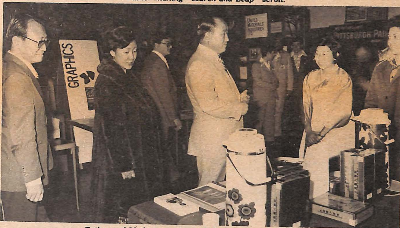
Father and Mother examine exhibits in the Terrace Room.