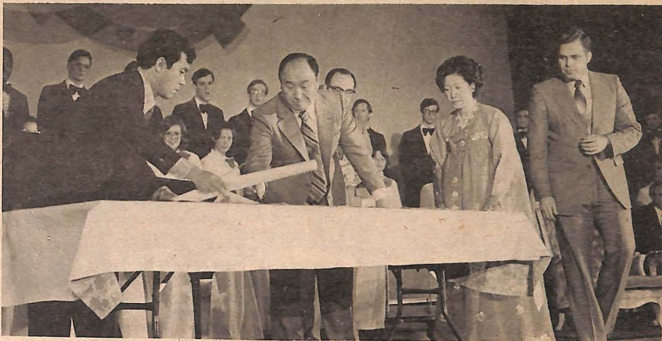
Father making "March and Leap" scroll.

Throughout the day members enjoyed a variety of activities, including examining exhibits of Church related activities, and watching the talent contest, lecture contest or film: "How to Succeed in Business without Really Trying." (See page 4 for photo-summary of activities and evening entertainment.) Then, on January 2, Father treated the visiting state directors to a performance of the Moscow Circus and a marathon "yoot" game, with himself officiating. On January 3, he spoke to the directors for twelve hours giving them substantial direction for fulfilling the goals of 1978. (See article on witnessing for specifics.)