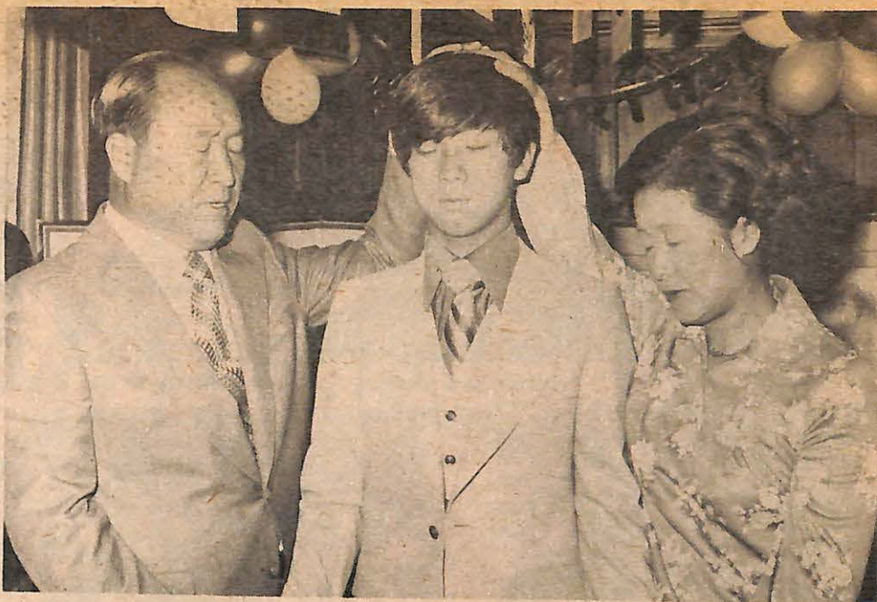
Hyo-jin: December 29, 1977 [Solar]