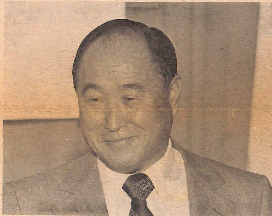
Father on God's Day, 1978.