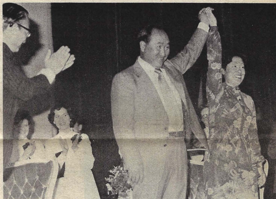
Father and Mother give a cheer for Children's Day, 1977.