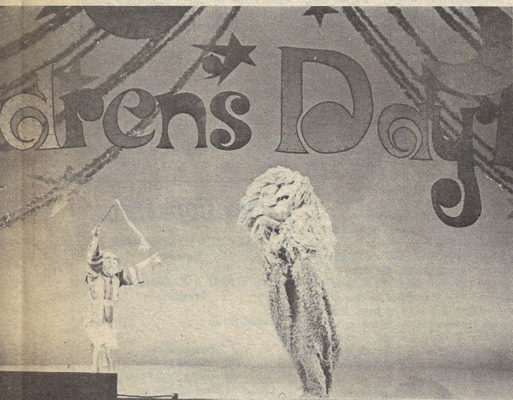
"The Mask Dance," by the Korean Folk Ballet.