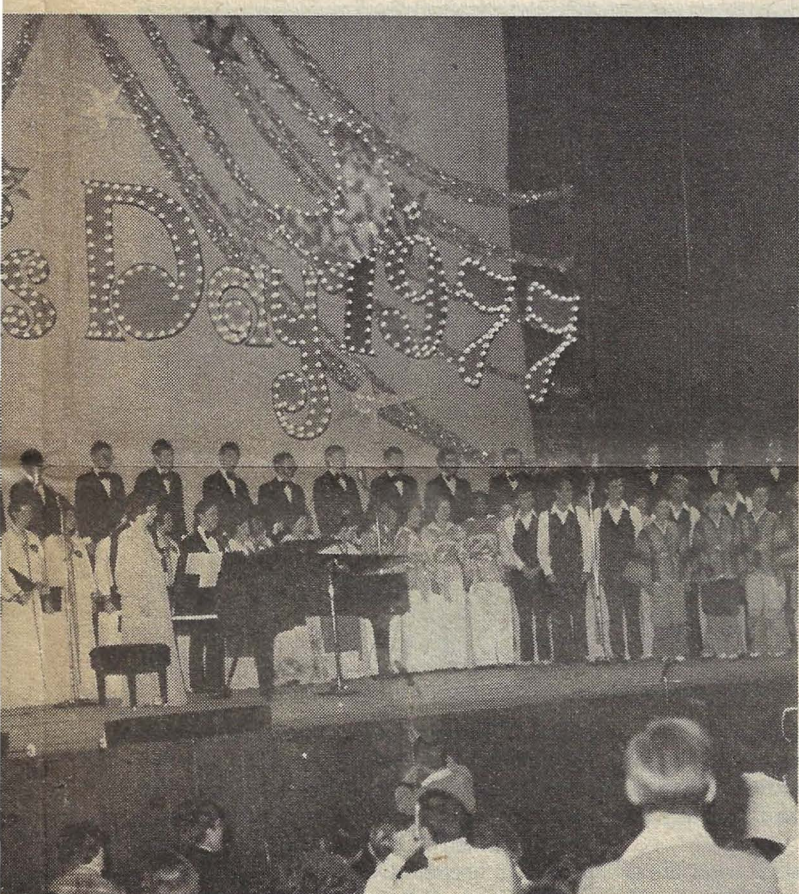
Man Center stage is beautifully decorated.