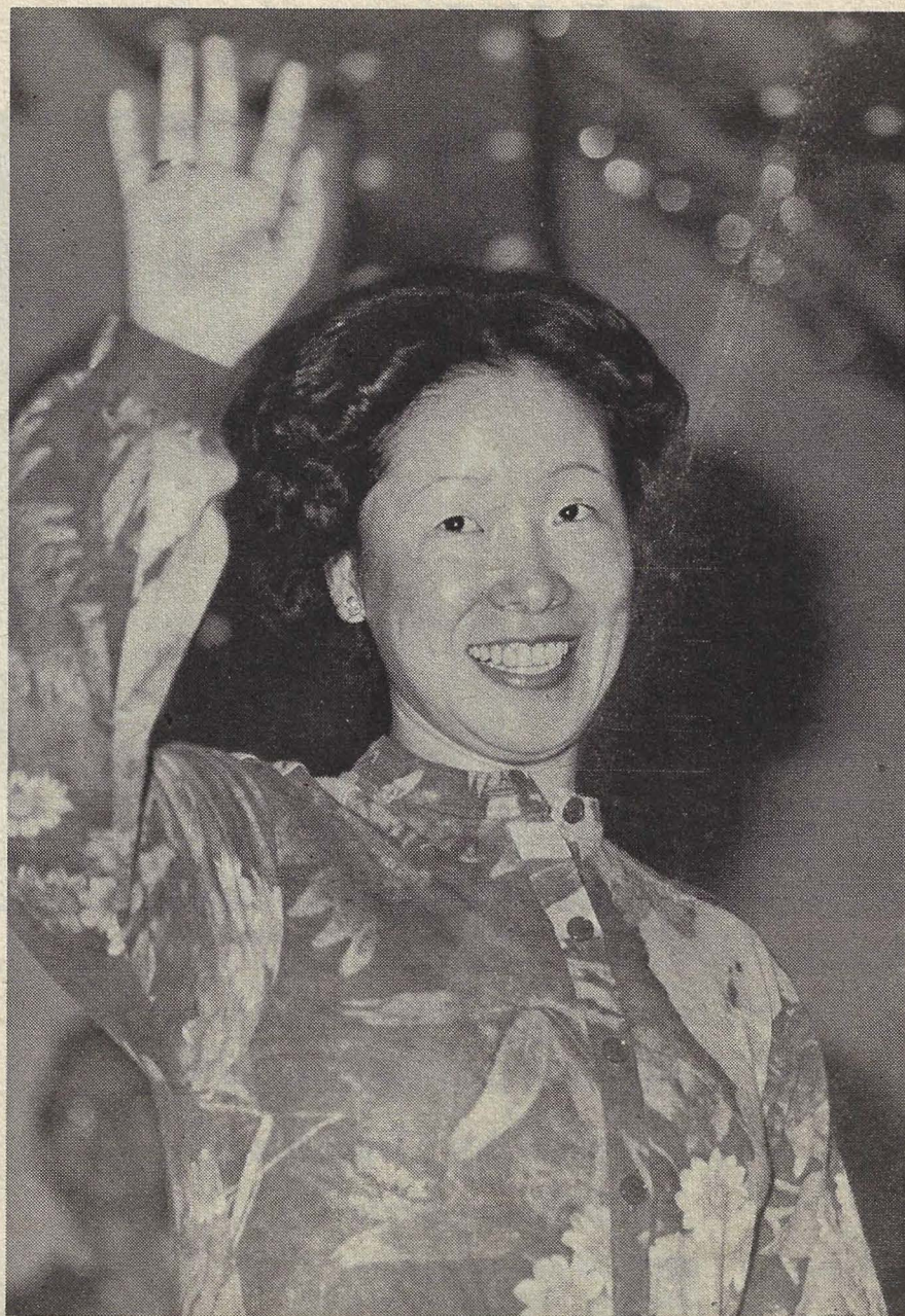
Mother gives a fond farewell.