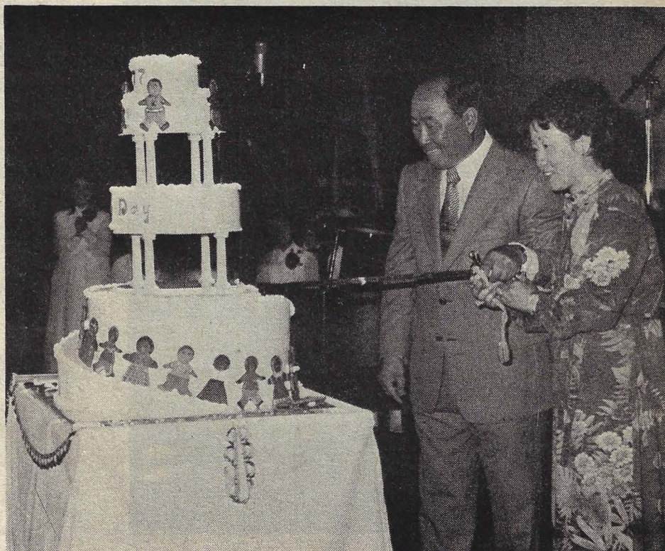
Our Parents cut the special Children's Day cake.