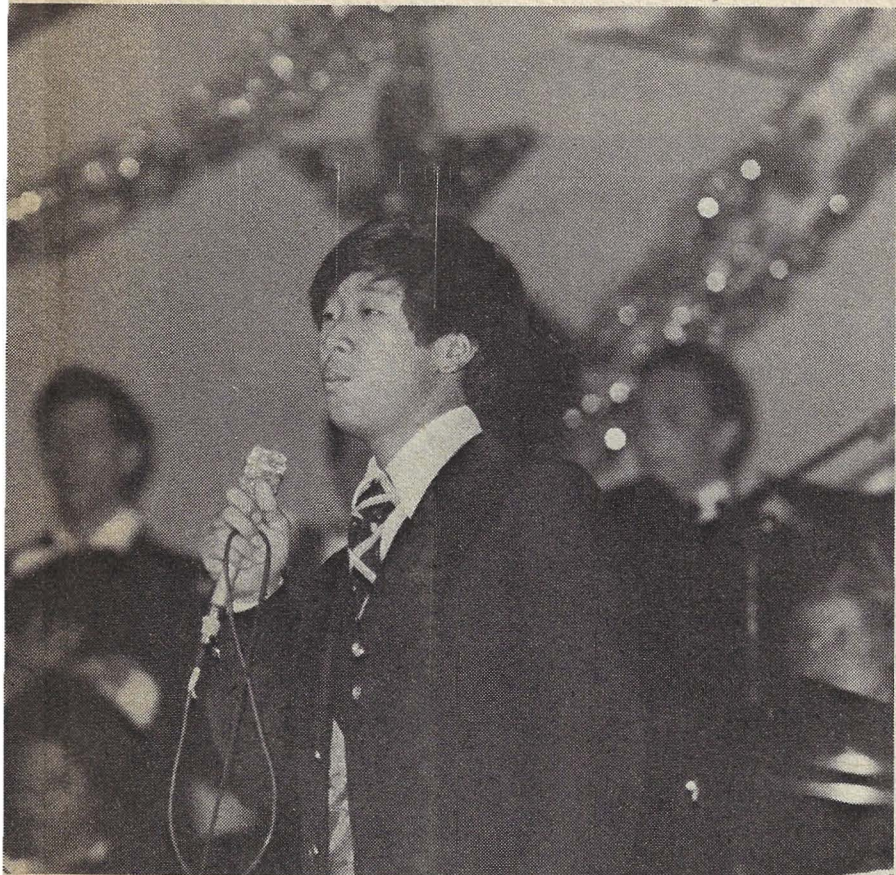
in performs "Try to Remember" with the New Hope Singers International.