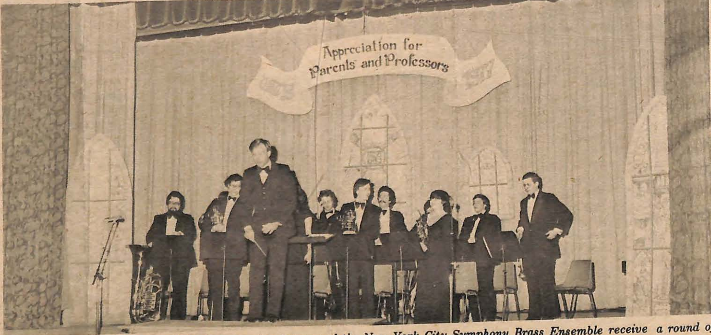
The Manhattan Center was the scene of an evening of entertainment provided to honor with drums and the New York City Symphony Brass Ensemble receive a round of parents and professors of the newly graduated class. Above, Korean Folk Ballet dancer applause.