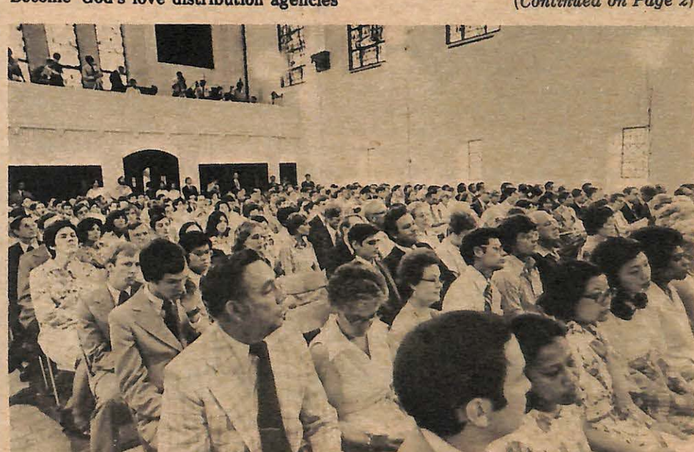
Parents, fellow students and friends came to honor graduating seniors.

After the ceremony, graduates were (Continued on Page 2)