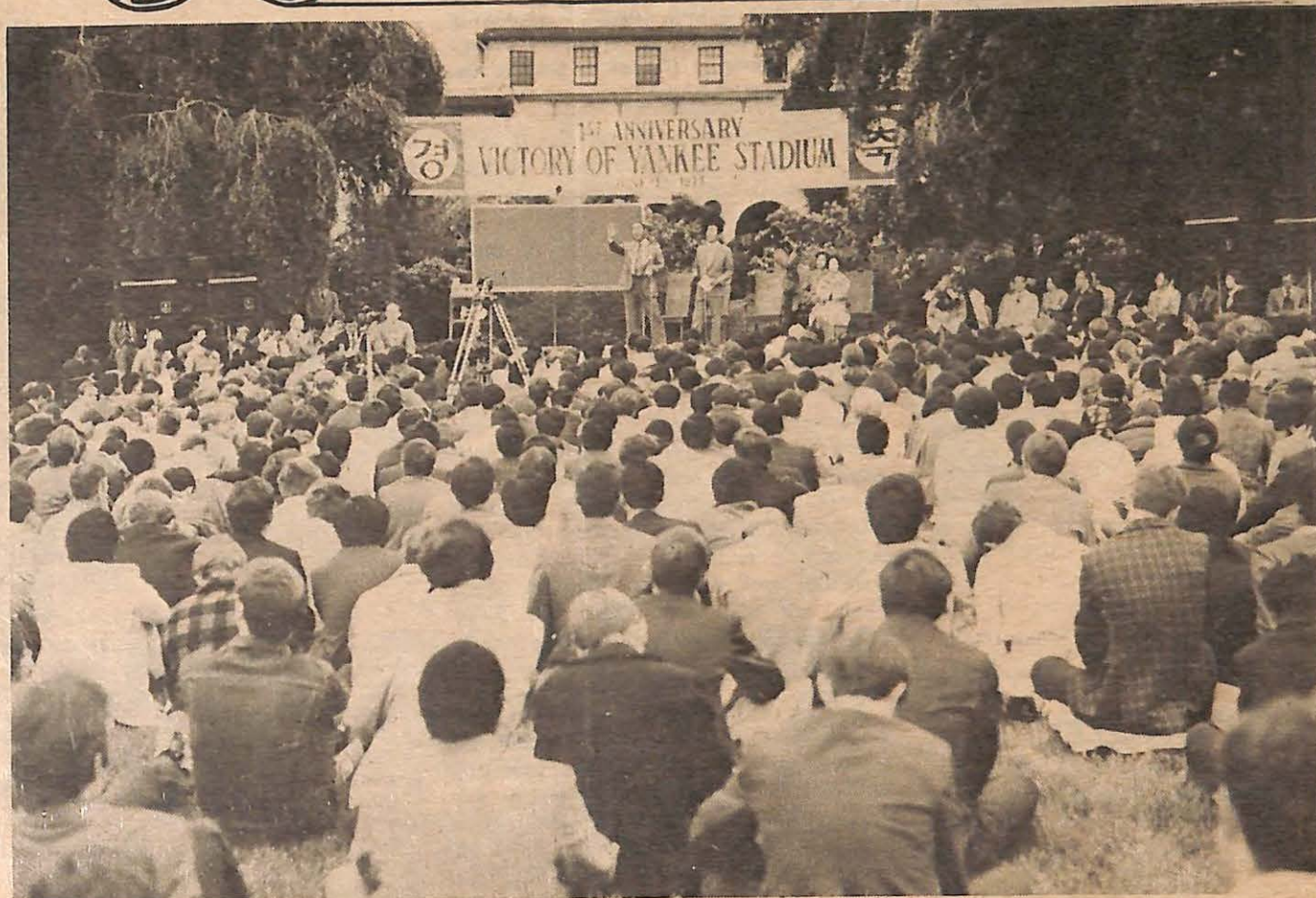
Members gathered outside at Belvedere on June 1st to commemorate the first anniversary of the Yankee Stadium rally.