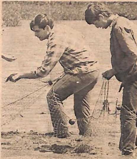
An early crew sets the net at high tide.