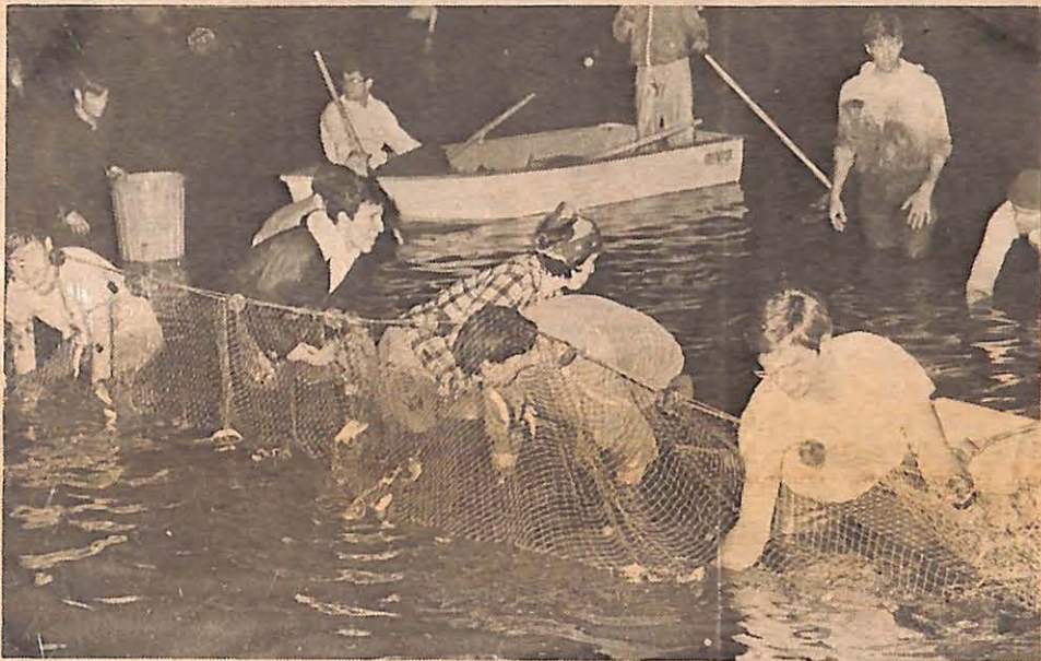
State Directors, seminarians, and some New York members scramble to catch fish in the mud at low tide.