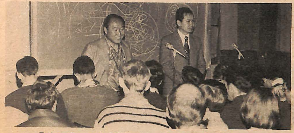
Father talking to the MFT captains at the World Mission Center

said. Hundreds of years ago and thousands of years ago, both evil and good people existed. It is therefore a mistake for us to think that all of our ancestors were good, especially when we consider how many people are in our lineages. "You are the product of the combination of your entire father's side and mother's side. In every cell of your body there is some component of the entire ancestral phenomena and history .... That is 'I' "Between God and our lives at the present time," said Father, "there are so many different types of sin committed. The origin, God, is good, but the extension man, is stained. Not only ourselves but our ancestors have been contaminated with sin." Father continued to explain the difference between good and evil. Our ancestors, he said, thought of themselves as the center of the world. If they had realized that God was the center of the universe, they never would have contaminated themselves. To emphasize the point that man should not consider himself to be the center of the universe, Father explained that nature, although taken for granted by man, was not created (Continued on Page 2)