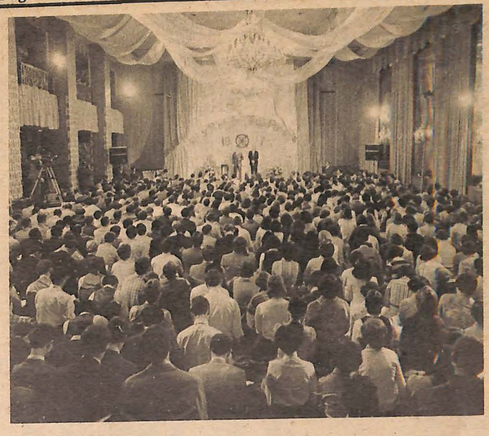
Father giving his morning speech in the Grand Ballroom of the World Mission Center, as hundreds of members listen.