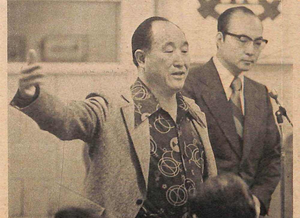
Father at the conference.

At the continuation of the meeting on February 23, Father again emphasized the importance of evangelism. He concluded by giving films, a movie projector and a set of the newly prepared Divine Principle cassette lectures to the state leaders.