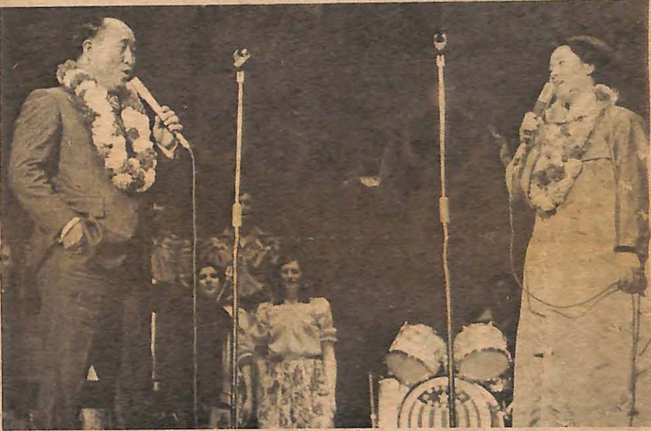
Father and Mother close the evening.