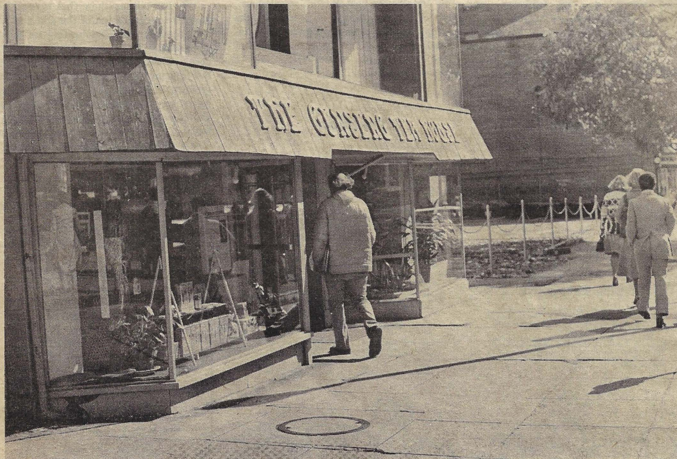
A lunchtime customer strolls into the Ginseng Tea House on its re-opening day.

New manager of the Tea House is (Continued on Page 4)