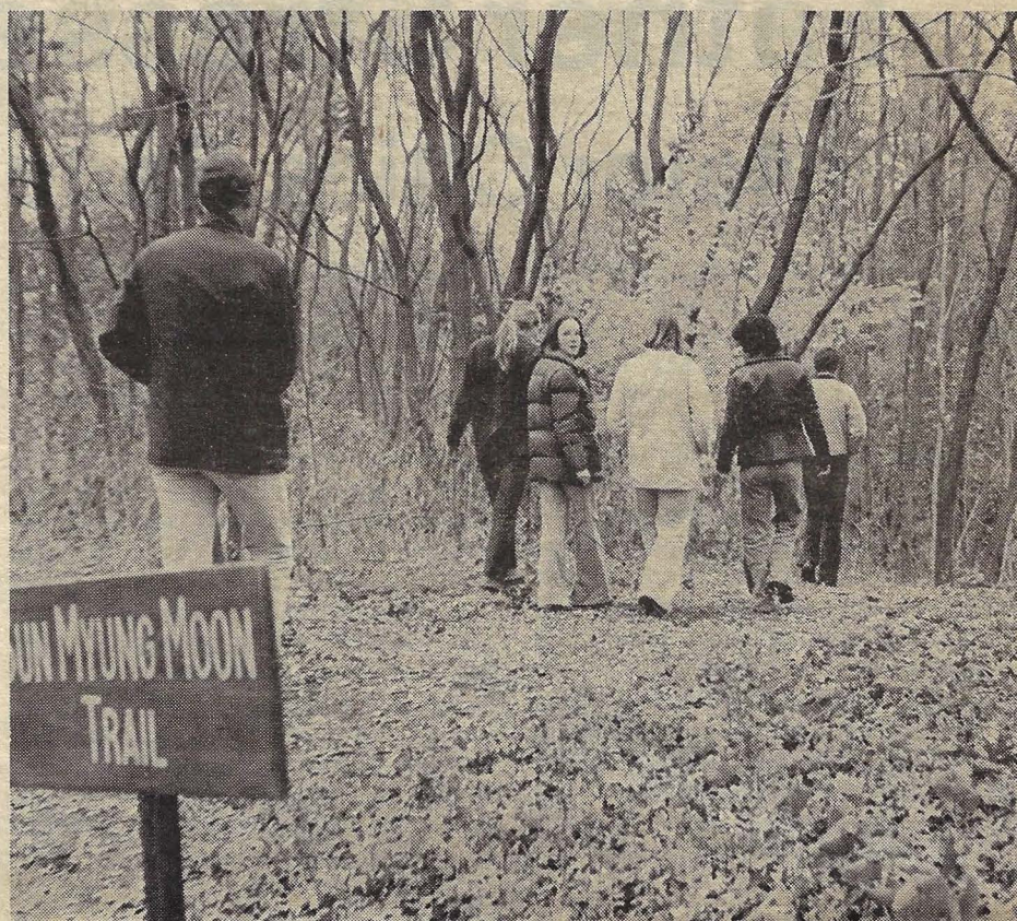
Training at Barrytown offers time for fellowship.....and fun!

"My evaluation of the whole weekend was that it was very inspiring. Many members came to the workshop feeling a letdown after the Washington Monument campaign, they had felt the victory of Washington Monument but lacked the confidence that it could change their lives. The workshop offered hope for their present situation -- a new perspective for their family life. The weekend experience lifted prayer and service to a more joyful level. It also pointed out that there is something to be gained by taking time to serve each other. Based upon the increased communication between state members experienced at the workshop, the states had hope for creating a higher spirit in their centers and felt a renewed desire to witness. When they left, the members felt a strong desire to bring people and a confidence to create the kind of environment in which new members can grow."