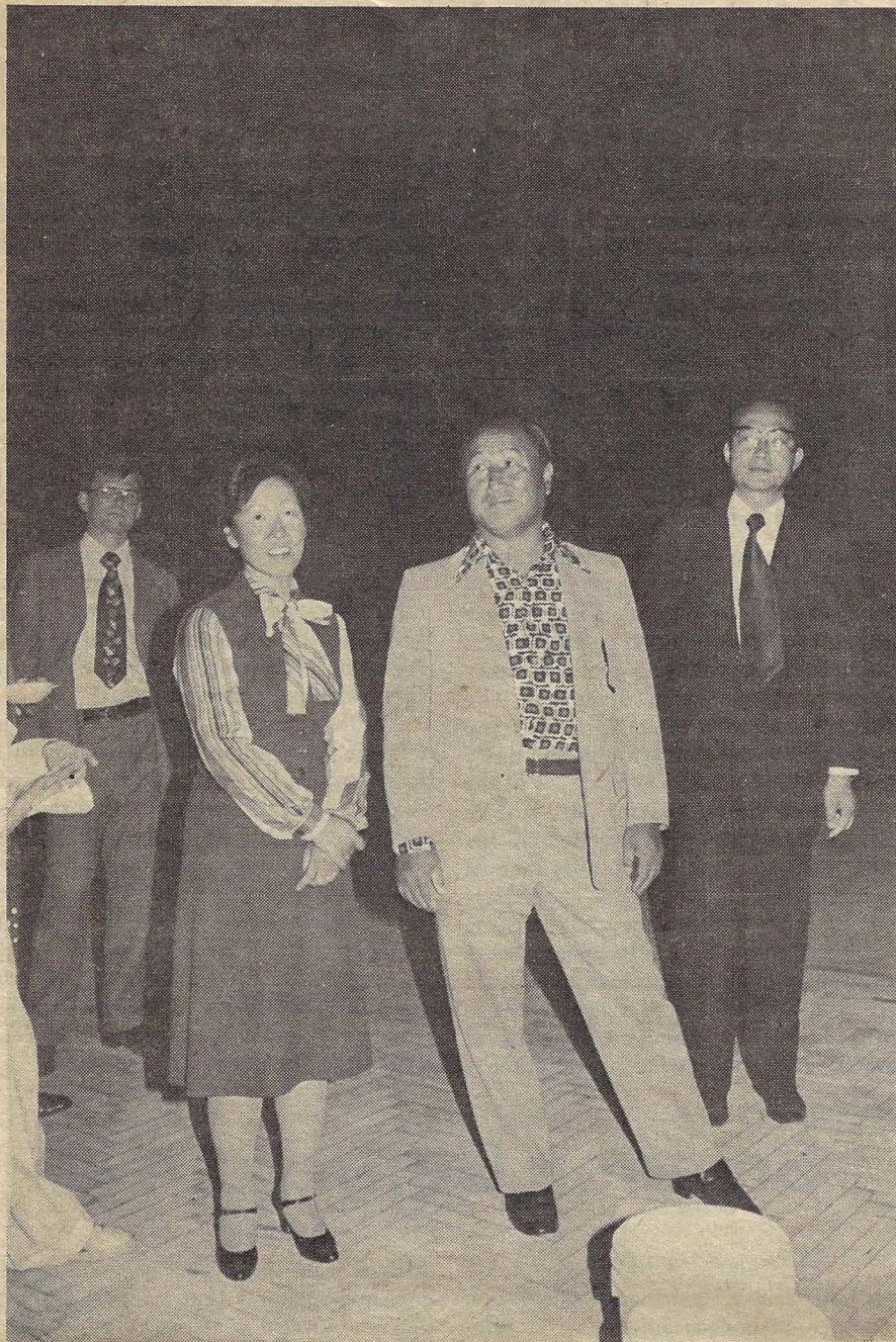
Father and Mother at their dedication of the Manhattan center on October 10. Father has a deep interest in the history of the building, often studying drawings and photographs of former glory. Currently the Performing Arts staff is busily cleaning the building to prepare it for Church functions.