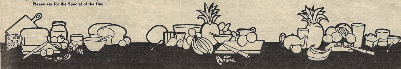
Lunch and dinner menu of the Tea House features natural foods