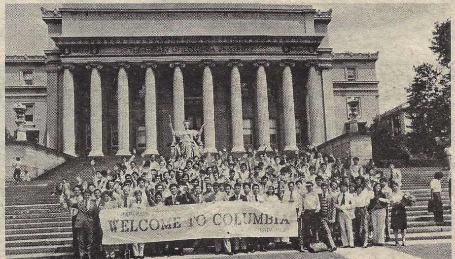
ILS students pose at Columbia University with Columbia CARP members.

differing University systems of Sweden, Australia, and the United States. On the next day they met with Minister Sadako Ogata, leader of the permanent Japanese mission to the United Nations. She summarized current issues before the UN, emphasizing topics of special interest to Japan. Their next trip will be to Boston and Harvard University.