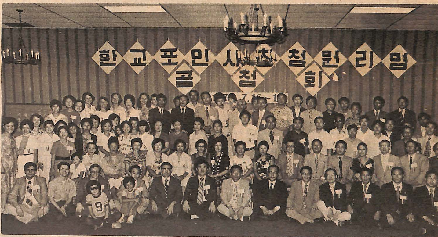
Workshop guests and staff.