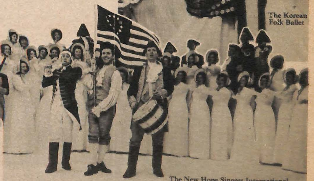
The New Hope Singers International