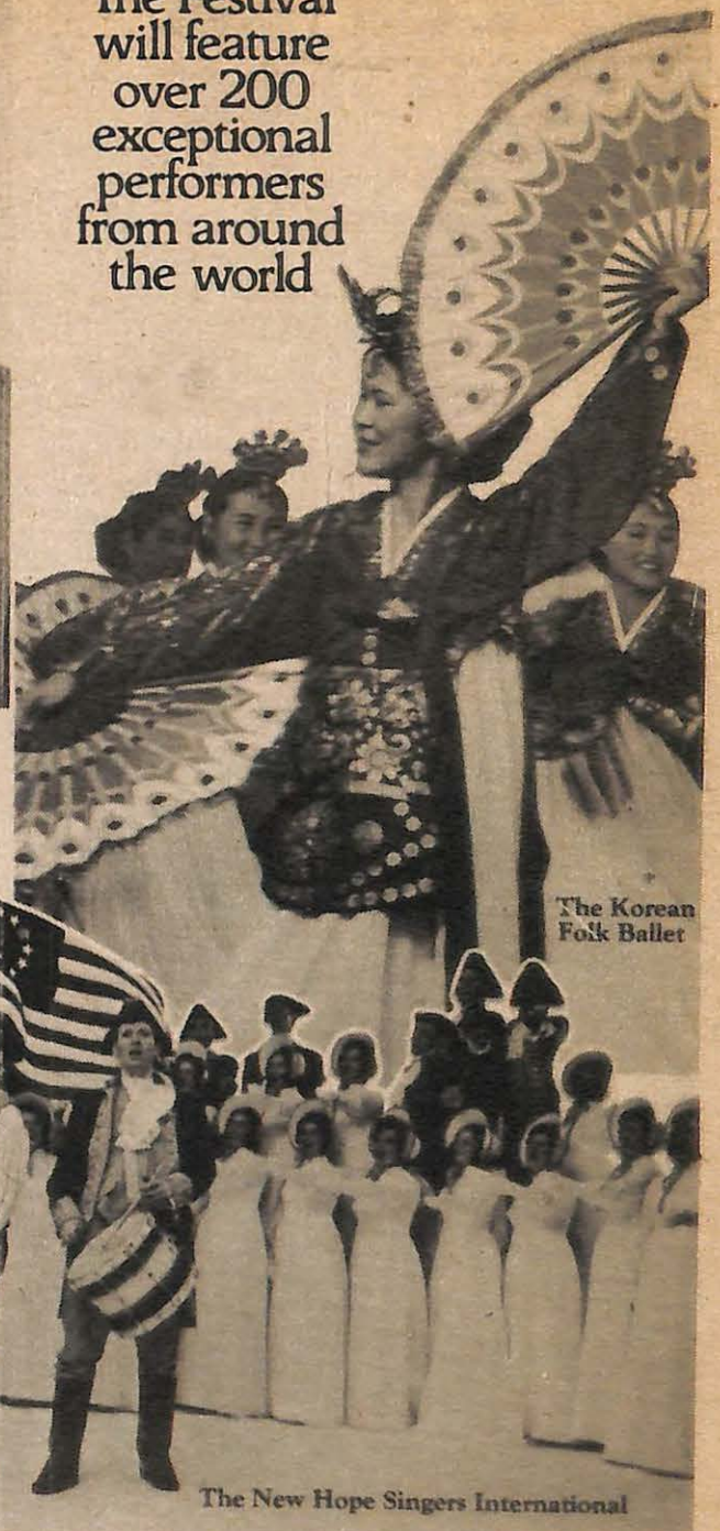
The Korean Folk Ballet

The Festival will feature over 200 exceptional performers from around the world