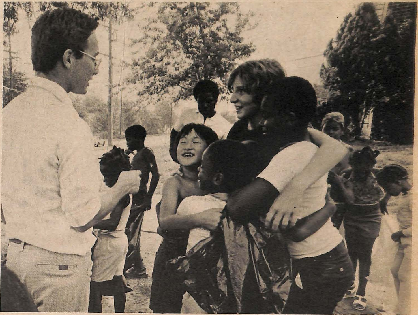
Having a good time together while cleaning up the Shirley Duke area in suburban Virginia.

A number of lucky prize winners at the park were awarded such things as a $10.00 gift certificate from Safeway, $2.00 gift certificates from Chaman Beauty Shop, Bicentennial cake from Mike's Bakery, free record albums from Record Fair, a candle turtle from King's Jewelry, scarf and earrings from Freida's Shop, an electric clock from Meenchon's Hardware. In addition, McDonalds provided three hundred cokes, the Mill End shop supplied fabric, and Meenchon's Hardware, paint for a 12' by 3' banner.