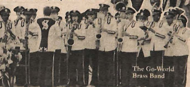
The Go-World Brass Band