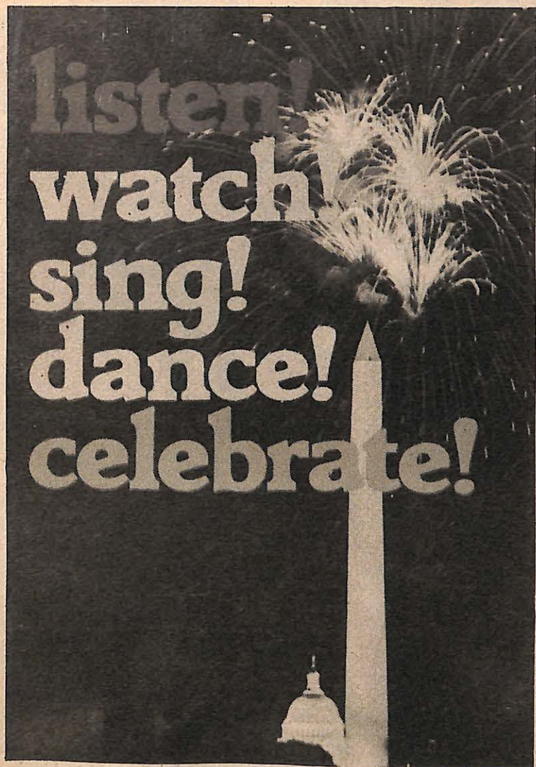
New brochure for Washington Monument rally. Pictured is the upper portion of the front cover. "An invitation for you and your family to the God Bless America Festival, September 18, Washington Monument" appears in the lower portion. See page 6 for text of inside of brochure.