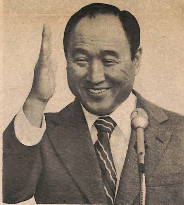
Reverend Sun Myung Moon, an international religious leader who is hailed by millions as a modern day prophet, is crusading for one world family transcending race and nationality.

We invite you to bring your family and friends and have a picnic on the Monument grounds. Raindate: Sunday, September 19.