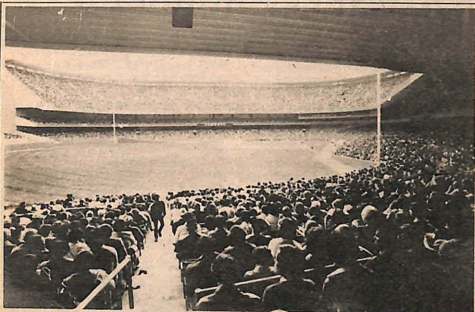
Yankee Stadium at the opening game.