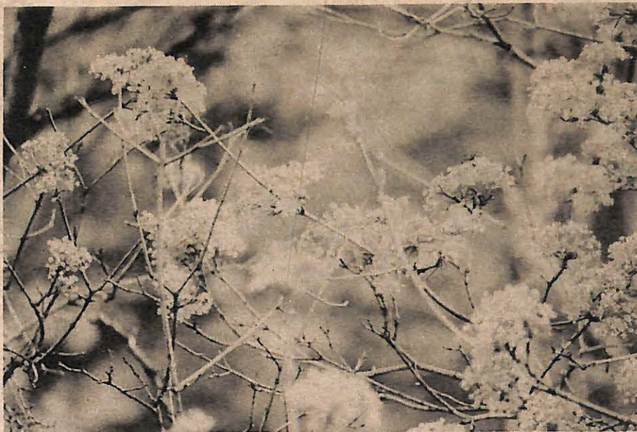
Budding trees at Belvedere on April 18 were signs of the coming spring.

Today Communism has a big crack in itself. The original idealistic international Communism has already broken down into nationalism. A Satanic tree has also been growing, but the leaves are falling off and the branches are falling down. The golden age of the international Communist civilization is over. When will the crossing happen? In the year 1976. That day is