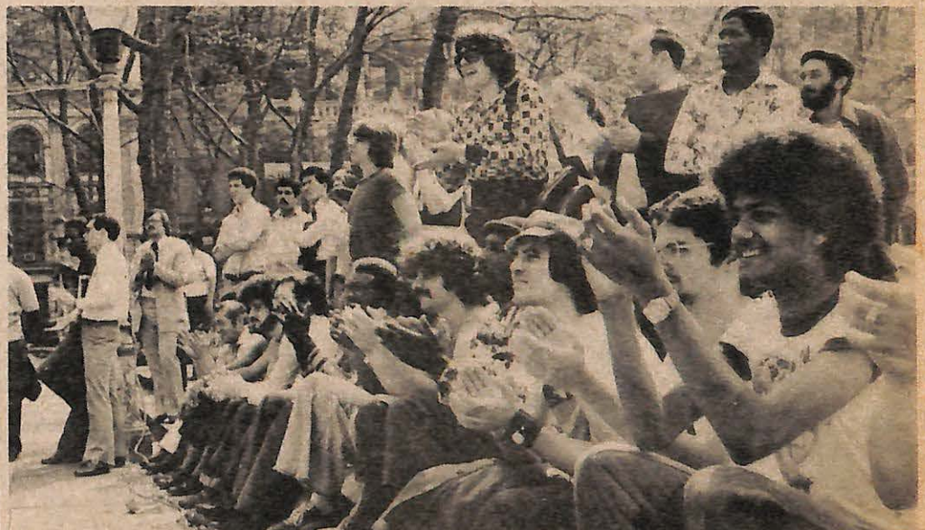
Lunchtime listeners enjoying the concert.