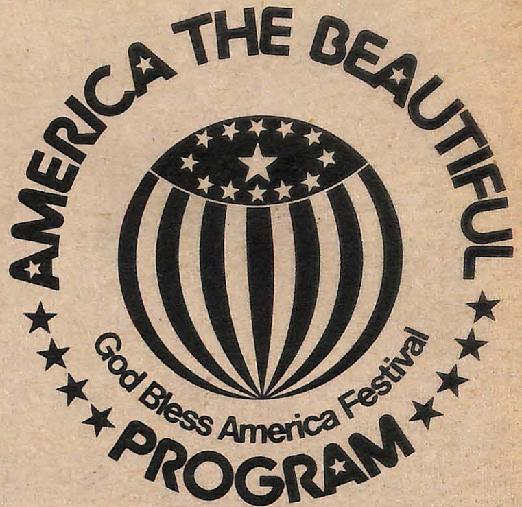
Logo for America the Beautiful program, to appear on jumpsuits and trucks.

efforts as the president of a block association at 71st and Broadway vigorously objected to our posters on the boarded-up site of a doughnut shop under renovation. Father decided that friction over our posters should be minimized; accordingly, the next day a crew went to 71st and Broadway to remove the posters. The unexpected media coverage was very positive. NBC carried a feature on its evening news. "Moon followers bring some sunshine at upper Broadway." On the news, the store owner commented: "I didn't mind them putting up their poster... But it did some good. They covered up some pornography posters." Another man commented: "They cleaned up the whole place-- everything. They did a good job. They're good boys, they are." The coverage also showed a street speaker and some reactions. "He's out to do good. I'm all for it," one woman said. The reporter concluded the broadcast: "While the Reverend Moon's speaker chips away at what he thinks is wrong with America, Reverend Moon's followers chip away at what made this neighborhood angry yesterday." (See page 4 for more campaign photographs)