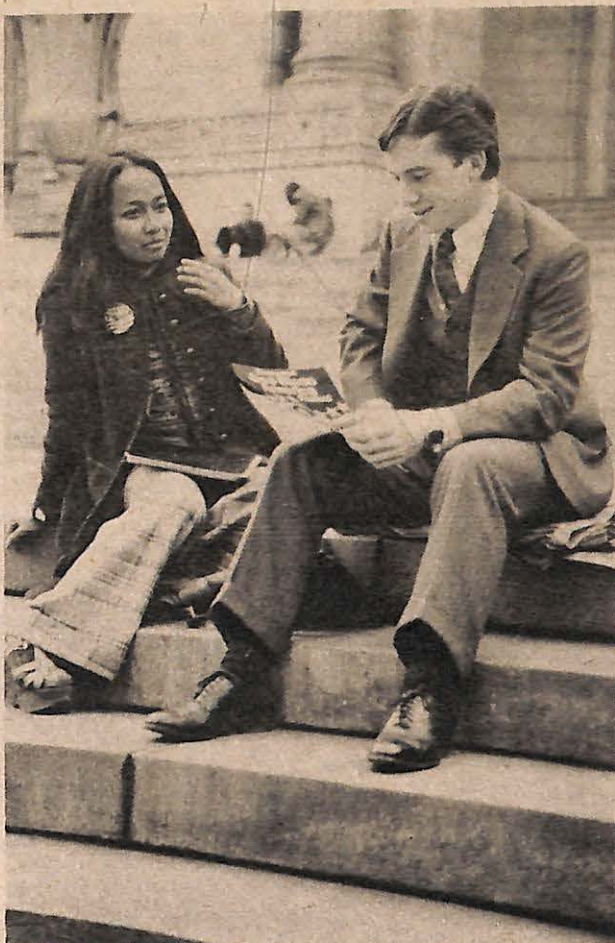
Most work involves personal contact and leafletting. Left: witnessing on the steps of the New York Public Library. Right: 42nd street, with its crowds was a good place for leafletting.