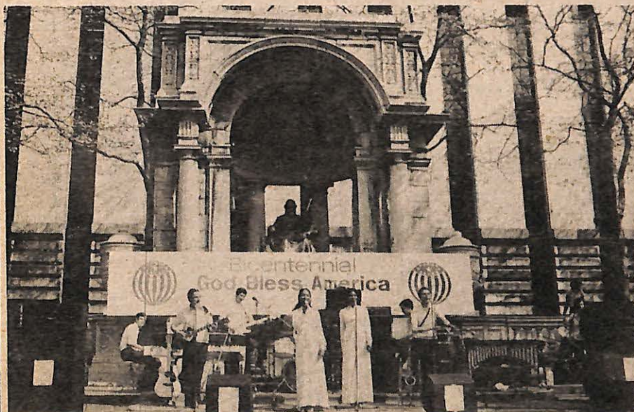
The New York Public Library forms a majestic backdrop for the Sunburst performance in Bryant Park.

most receptive across the board-- to Sunburst, to Yankee Stadium, to the Unification Church. "They understand suffering and they understand spirit. The people don't read the papers so much; they judge by the fruits. They look at the spirit. Many of them have had spiritual experiences while we have been playing. Often the minister will change his sermon topic based on our performance. I feel confident that the black churches will come by the busload to Yankee Stadium. One minister we performed for promised five busloads, and that is a conservative estimate."