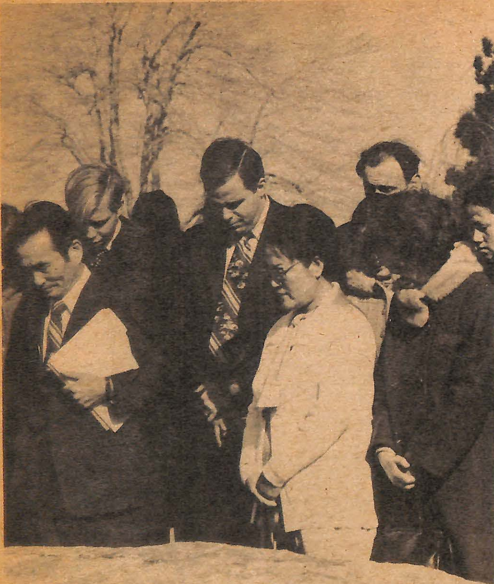
Praying at Holy Ground after the talk.

It is not good not to question. That is not the Unification Church. If you have questions, write them to me. Why don't we have a questioning church? What would be more beautiful than for everyone to think that we are not the people who don't think but rather the people who think more than anyone else? We think a lot in coming to the Church. Why should we stop short? Actually our members don't stop thinking. They may get busy and stop talking, but that may not be good. The members who are rock-solid are not those who never discussed things or refused to answer questions. Those who are like that are sometimes those who have left the church. Questions are real and they have to be faced. If you don't have the confidence to face them, then you have a faith problem, not an information problem. Let's be confident!