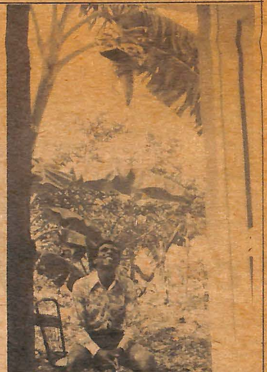
Member of the Dominican Republic Family gazes at the Platano tree in the center's yard.