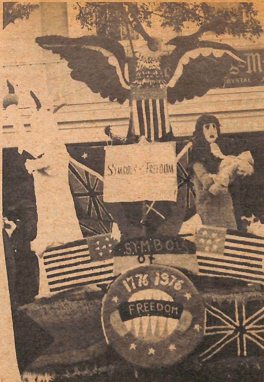
"Junkanoo" is an annual Caribbean New Year's festival. Pictured here are parts of a parade in the Bahamas honoring the U.S. Bicentennial.