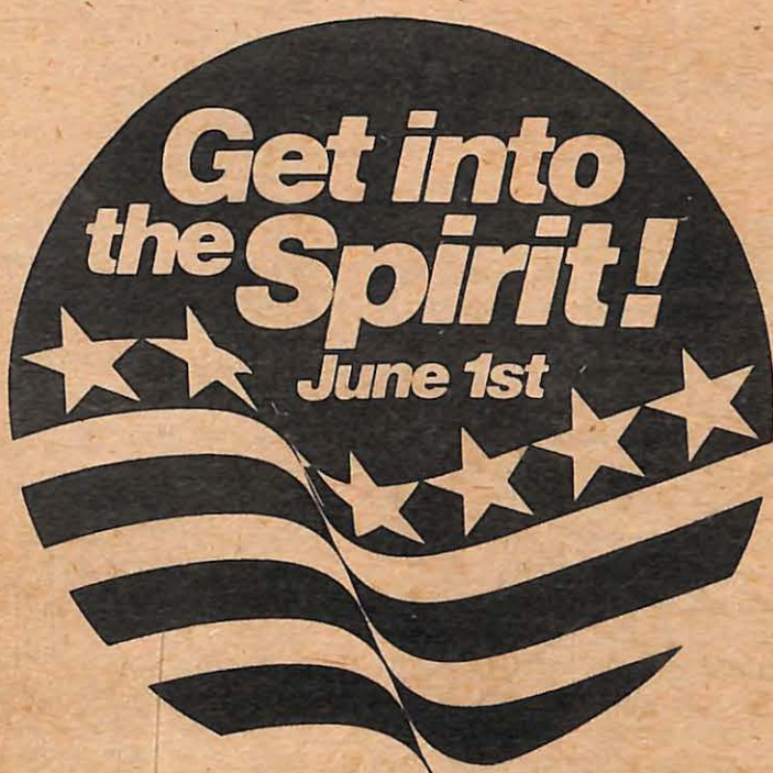
Button design for Yankee Stadium Campaign.

When I first joined in 1967, I was very unaware of the nature of God. When we (continued on page 6)